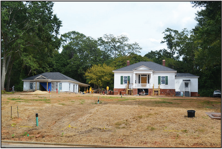
Southwest view of Pebble Hill.

Project Status: The project is 86 percent complete. It is on schedule and within budget. Exterior siding installation continues on the new building. Interior finishes continue inside the Scott-Yarbrough House.