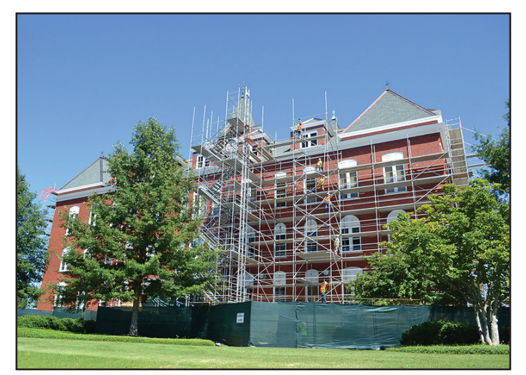
Roof replacement is complete on the back side of the building.