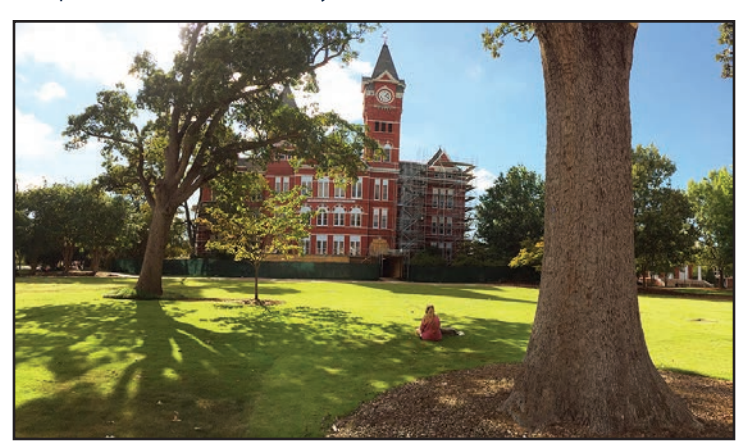
Removing sidewalks in front of Samford Hall adds more greenspace.