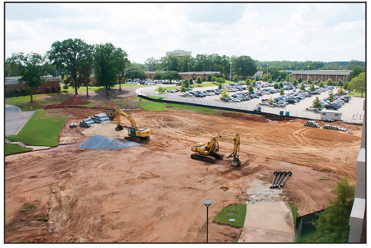
AUM Residence Hall site preparation.