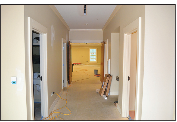
Interior of the new multi-use building.