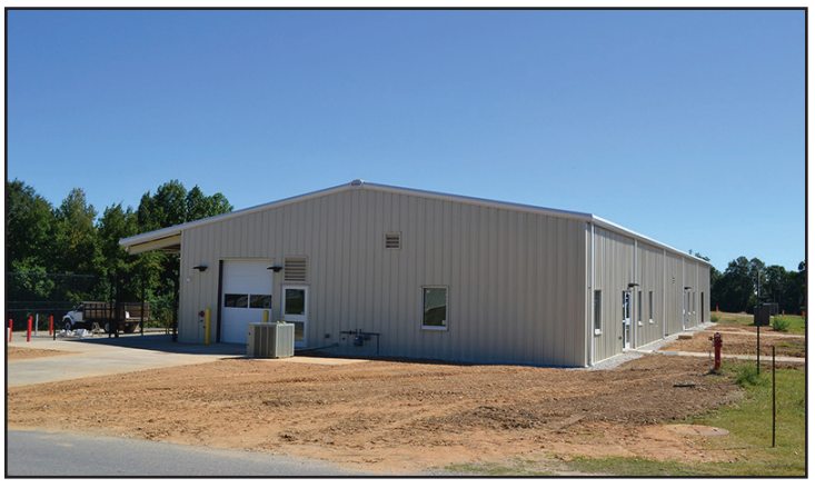
View of the new building from the Facilities' Complex.