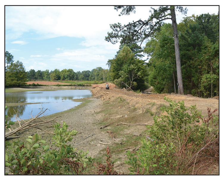
Compactor works to repair the pond dam.