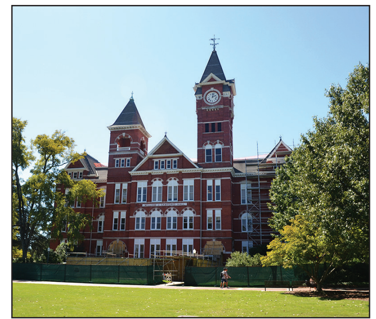
The roof replacement project is moving toward the front of Samford Hall.

Project Status: The project is 60 percent complete. Most of the lower roofing work is complete on the west side. The remainder of low roofs on the east side and the tower roofs are scheduled to be completed by early to mid October. Scaffolding is being relocated to the front of the building. Work is starting on the northeast corner.