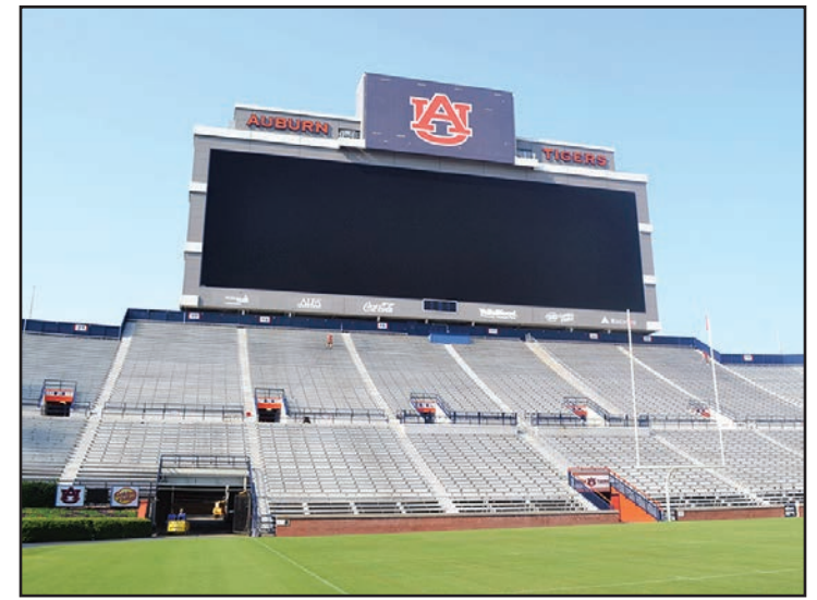
The video board made its debut during Auburn's home opener Sept. 12.

Project Status: The project is complete. It was finished on time and within budget. A follow-up project to install graphics on the video board will be completed later this fall.