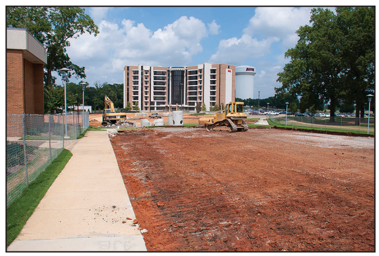
AUM Residence Hall site preparation.