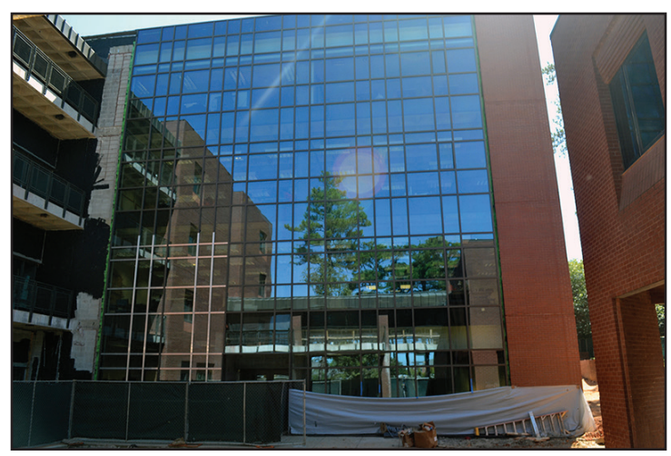
New window wall facing the courtyard.

Project Status: The project is 91 percent complete. It is within budget and on schedule. All window glazing is complete. Metal panel installation and hardscape work continues.