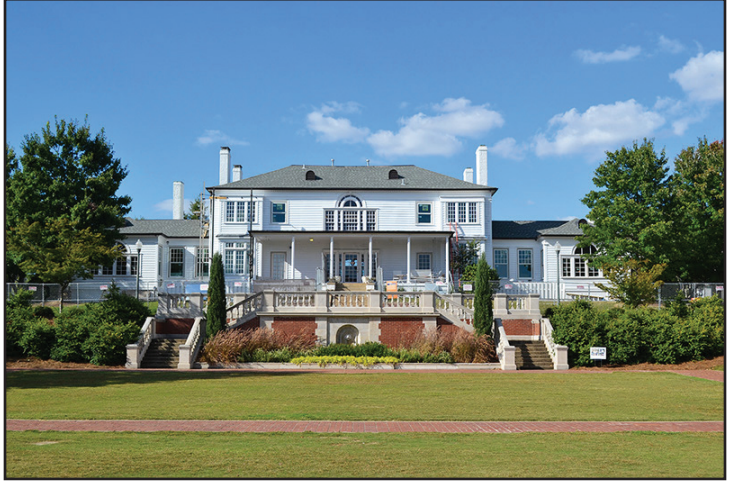
New siding and windows on the Quad side of Cater Hall.