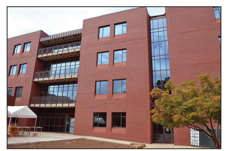
Window installation is complete on the north side of Dudley.