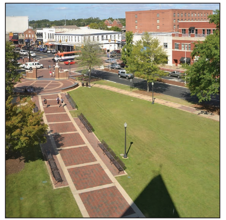
New park benches line the walkway near Toomer's Corner.