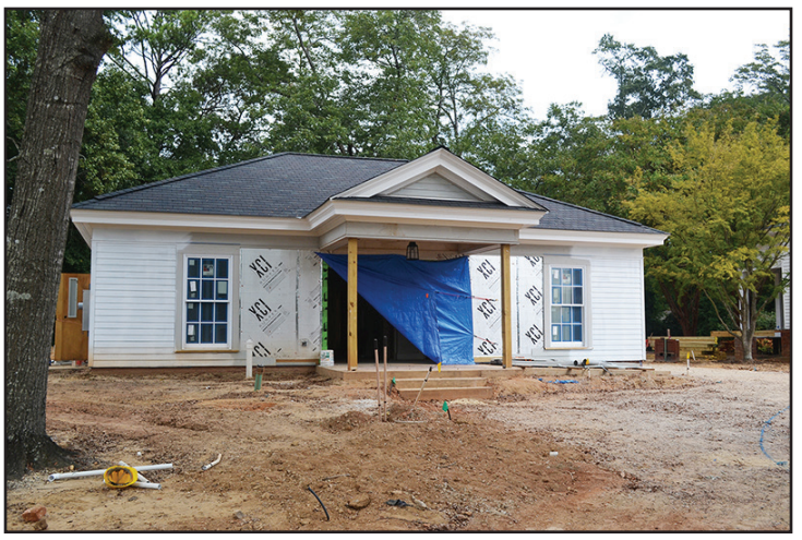
Front view of the new multi-use building.