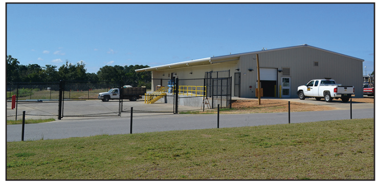
The new Facilities Building 8.

Project Status: The project is 96 percent complete. Final inspections are underway and move-in is scheduled for Oct. 14, 2015.