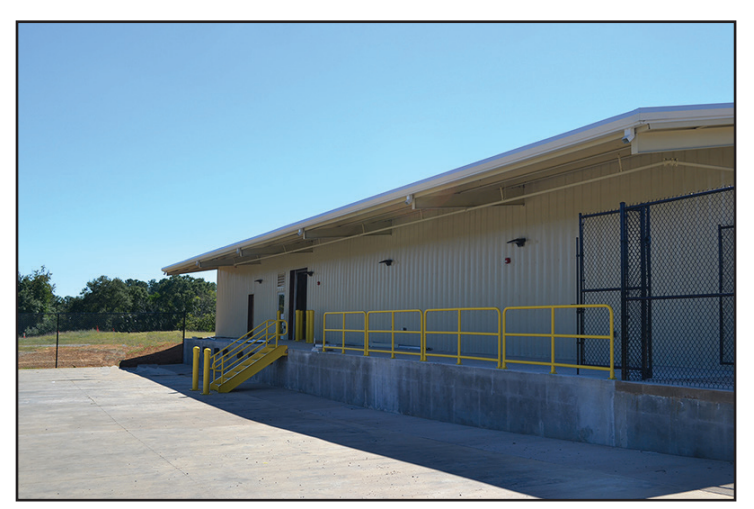
Loading dock on the back side of the building.