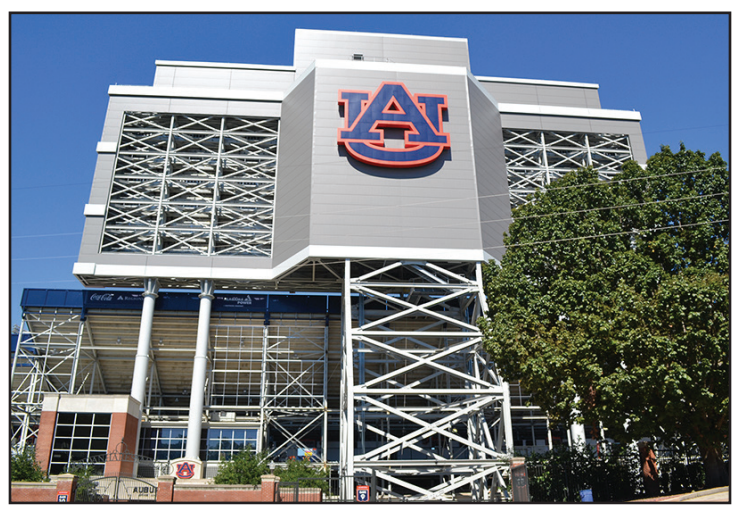
View from Heisman Drive.