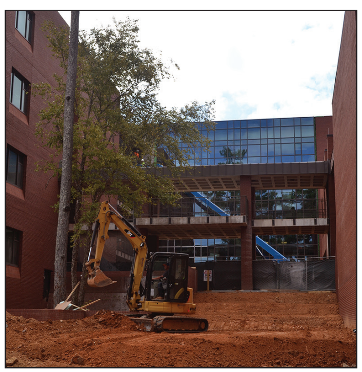
Hardscape work continues near the courtyard.