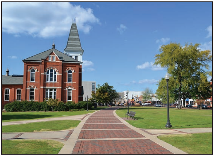
View of the walkway looking toward Toomer's Corner.

Project Status: The first part of Phase II is complete. It finished on schedule and within budget. The final part of Phase II will take place winter 2016 with the planting of live oak trees from the original Auburn Oaks along the new walkway.