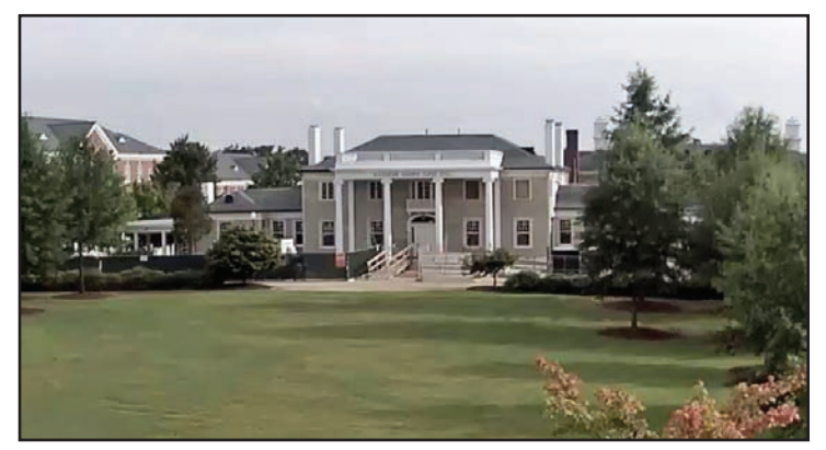
View from the Cater Lawn webcam.