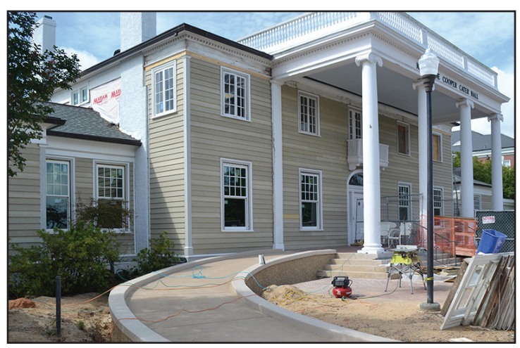
Window and siding installation continues on the front of Cater Hall.

Project Status: Phase I of the project is 83 percent complete, on schedule and within budget. Siding and window sash replacement is almost complete. Exterior painting, new handrailing and landscaping is progressing.