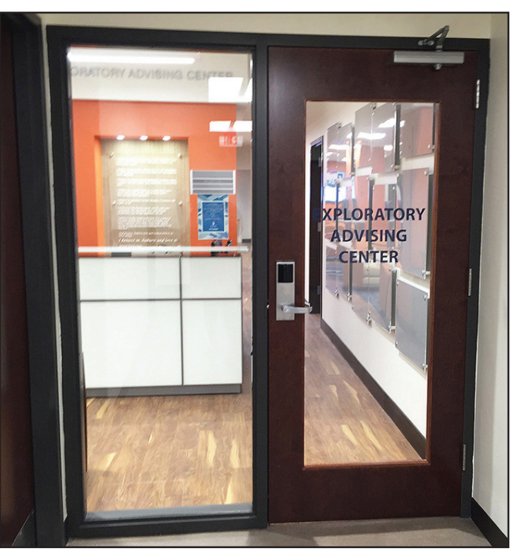
Mary Martin Hall entry to the new Exploratory Advising Center.

Project Status: This project finished on schedule and within budget. The Center opened to students on the first day of Fall semester.