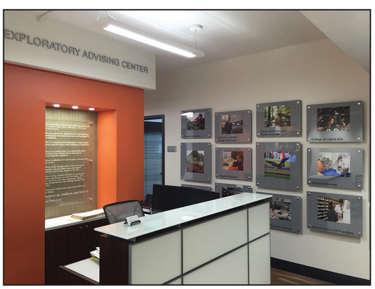
The Center's reception desk.