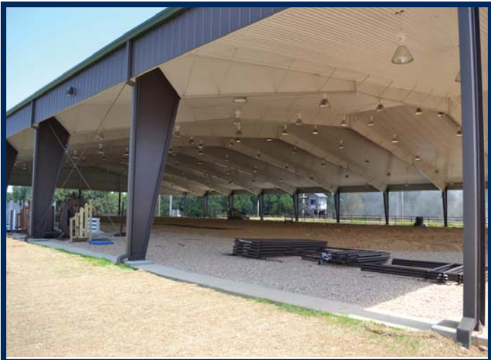
Equestrian Pavilion Interior Views