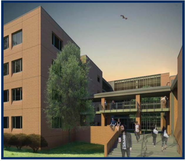
Rendering of North Facade Showing New Curtain Wall Windows

Project Status: Notice to proceed for this project was August 18, 2014, with a preconstruction meeting held the same day. Tree protection and fencing has begun, and the contractor's on-site office trailer has been delivered. The project is scheduled for completion in October 2015.