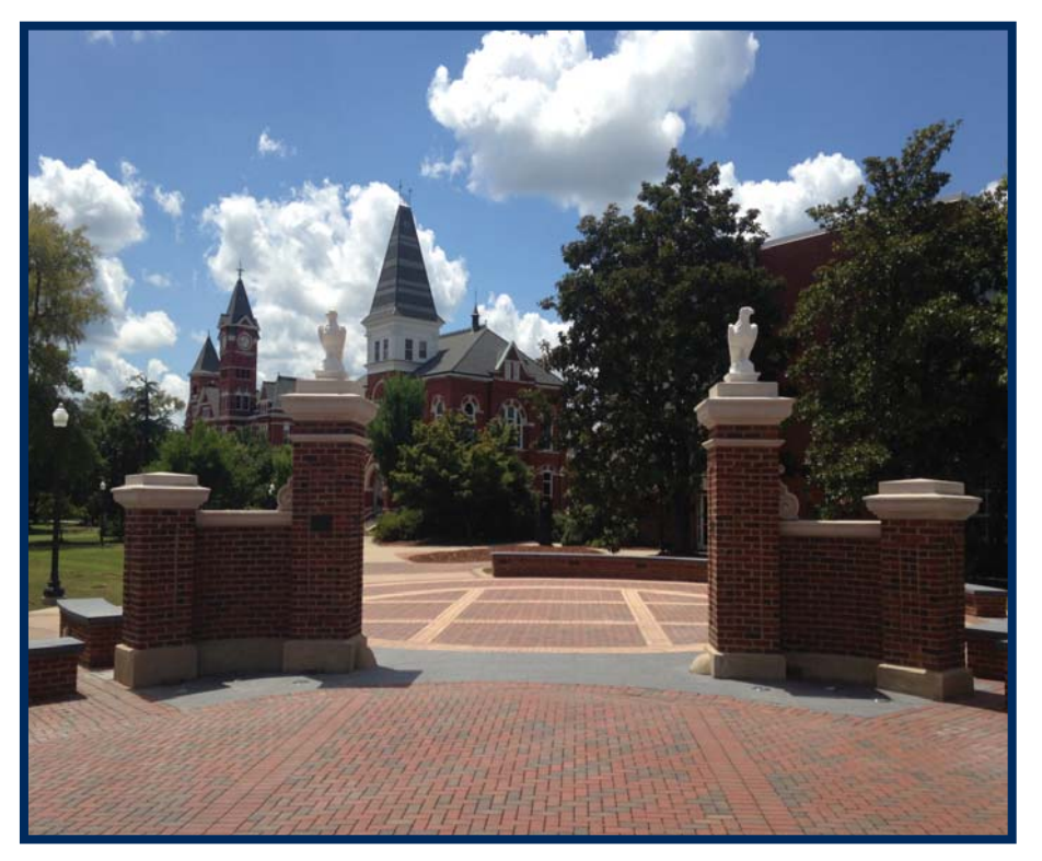
Samford Park at Toomer's Corner

Project Status: The project was substantially complete on August 18, 2014.