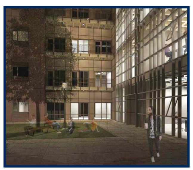
Rendering of the Courtyard From Commons