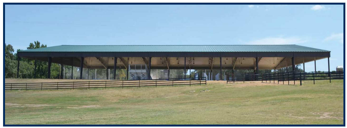
Equestrian Pavilion West Elevation

Project Status: The project is substantially complete and finished within budget.