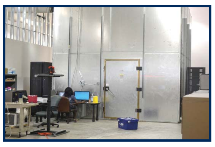
Radio Frequency Identification Laboratory