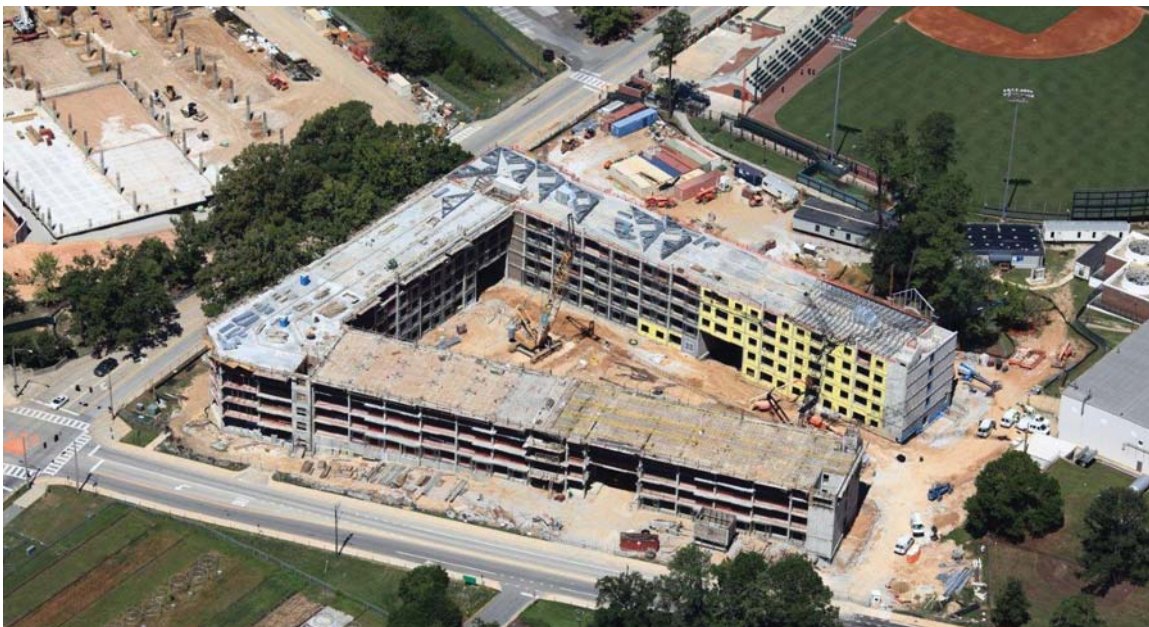
Aerial view looking north