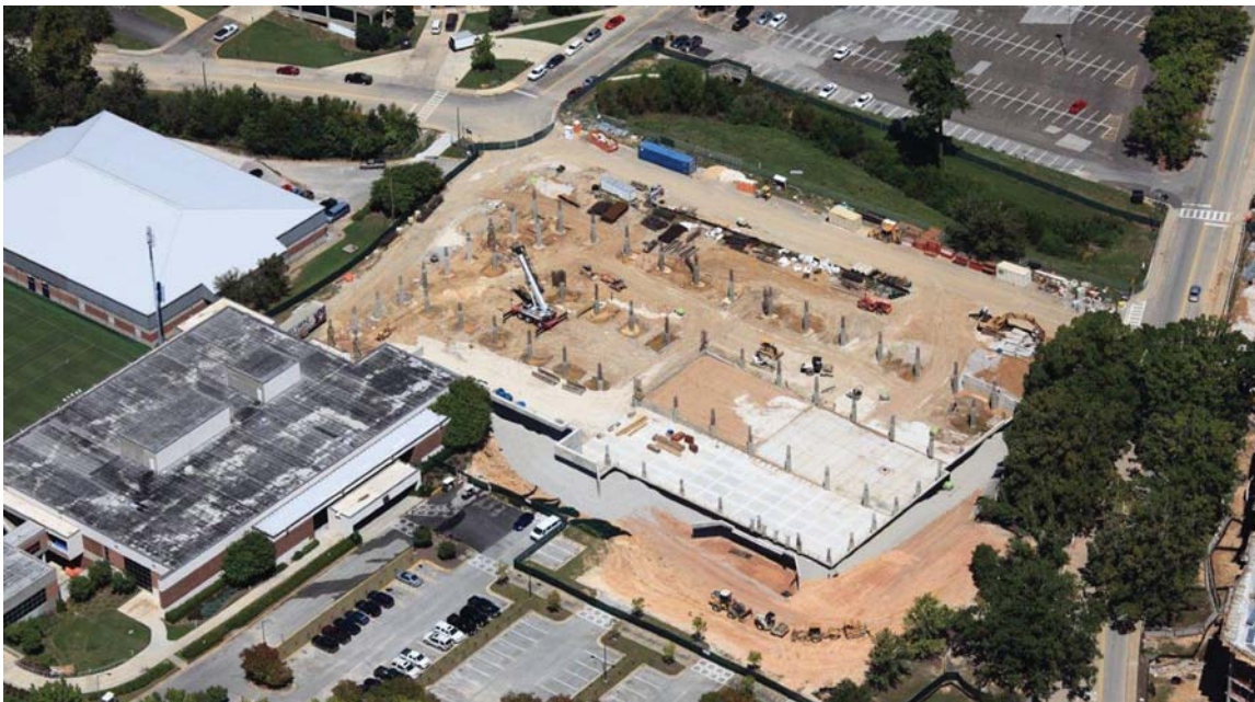
Aerial view looking northwest