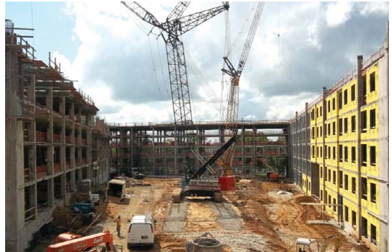
Courtyard view looking west from Leach Center