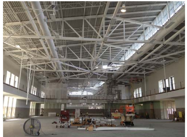
Interior basketball court area