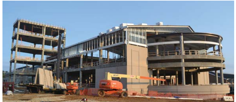
West elevation showing 5-story cardiovascular exercise area and 2-story atrium