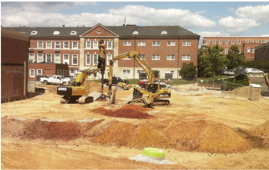
View looking north

Project Status: The project is currently 10 percent complete. The demolition of the existing shop addition to M.W. Smith Hall has been accomplished. The installation of the site utilities, footings, and foundation work is currently in progress and will be followed by underslab plumbing and electrical activities. The project is on schedule and within budget.