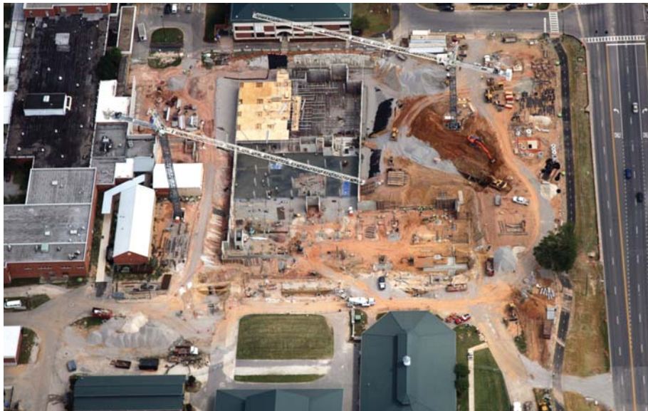
Aerial view looking east