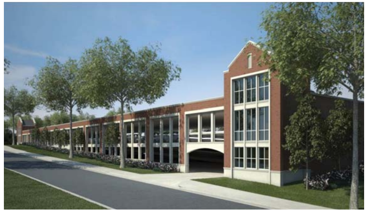
Architect rendering of the Biggio Drive Parking Facility