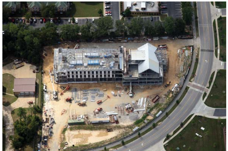
Aerial view looking south