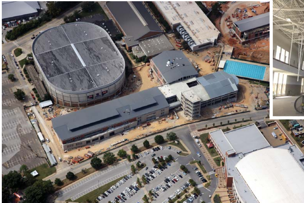
Aerial view looking south