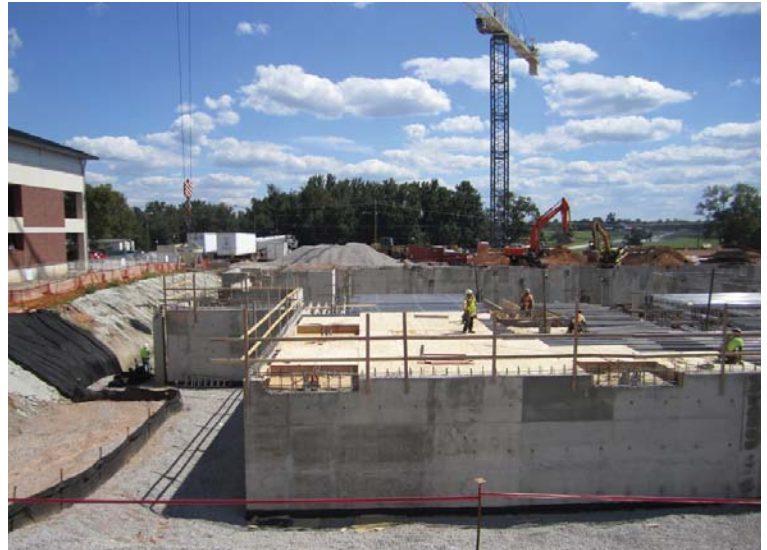
East elevation of first floor framework