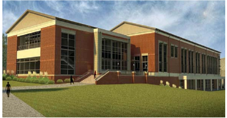
Architect rendering of the Kinesiology Building