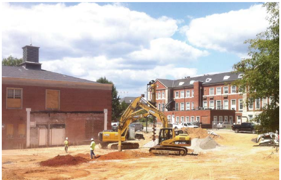
View looking northwest