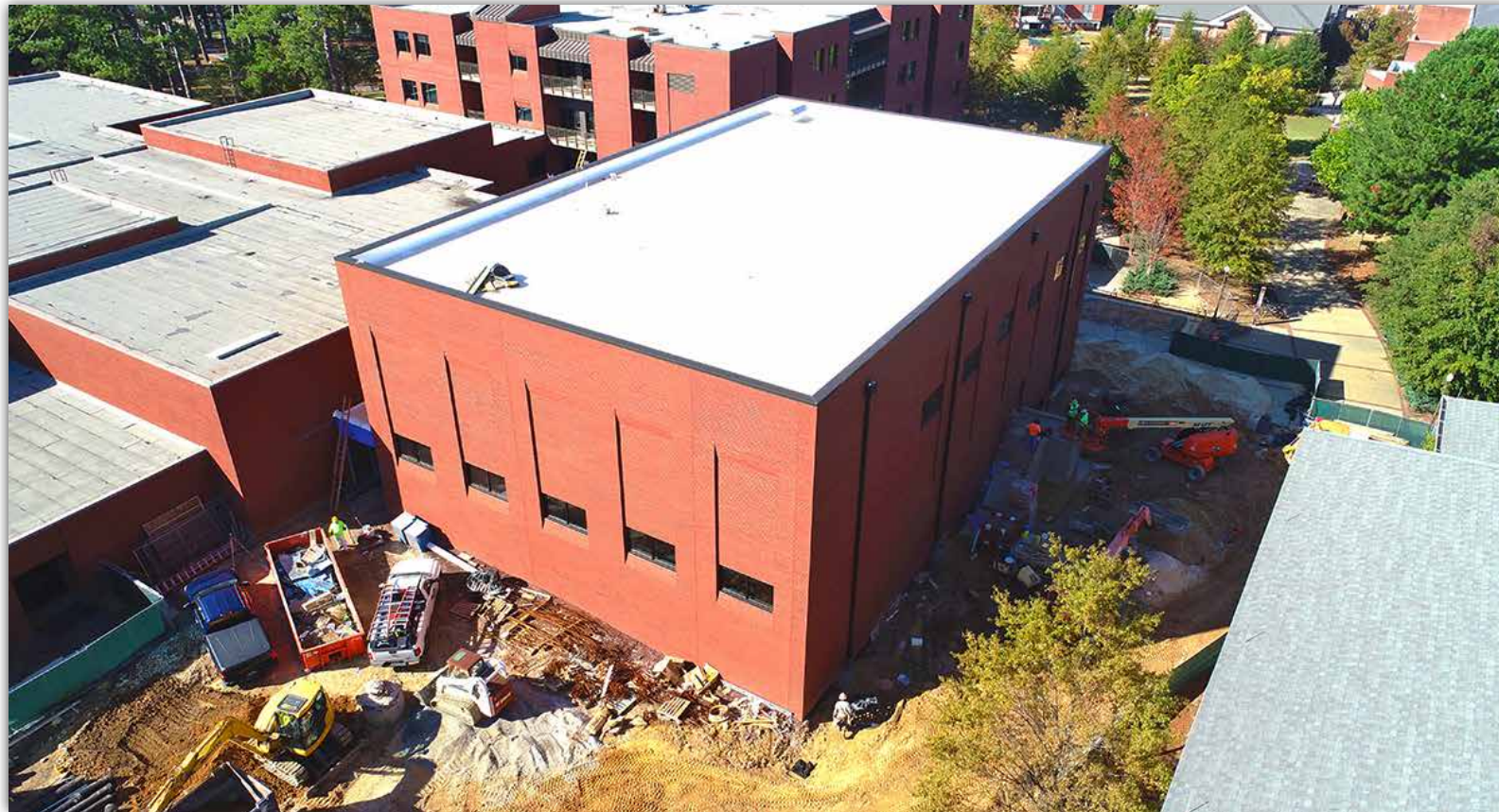
An aerial view of the Goodwin Hall Band Rehearsal addition shows exterior brick installation is complete.

This project is a 14,599 square foot addition to Goodwin Hall. It will include a band rehearsal room, faculty offices, instrument storage, and uniform storage and support space. While designed to accommodate the AU Marching Band, the rehearsal