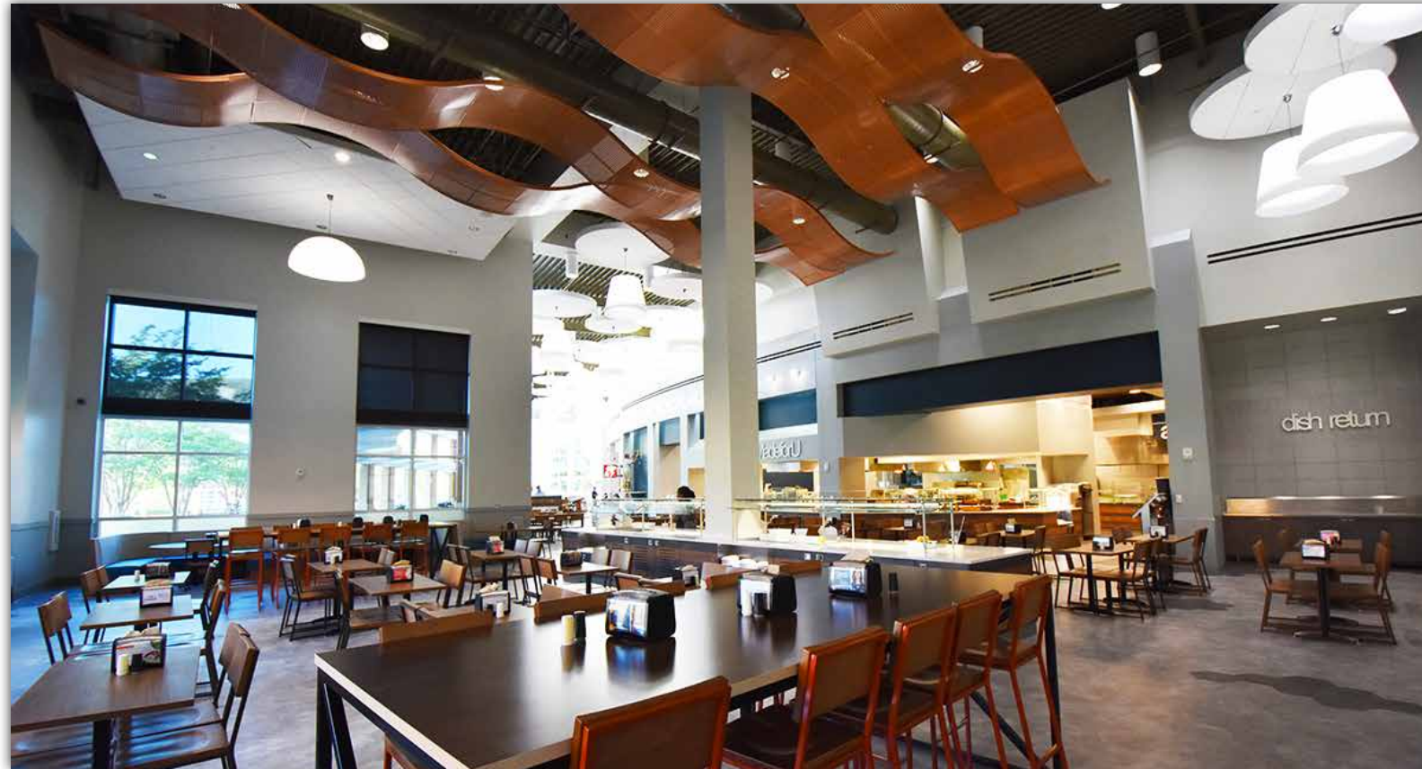
The main dining hall that includes expanded seating areas and all-you-care-to-eat options, opened for the fall semester.

Phase I of the project renovated the dining room space, as well as back-of-house and other preparation areas in the Village View Dining Facility. The renovations included the addition of all-you-care-to-eat kitchen space, dining room improvements,