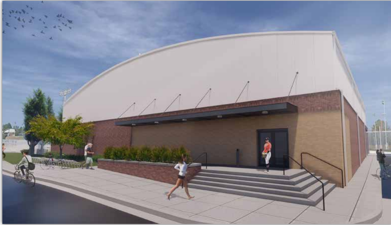
A rendering of the Jane B. Moore Softball Complex Player Development Improvements project.

This project will construct a one-story, 11,597-square-foot facility along the first base line to include an indoor practice