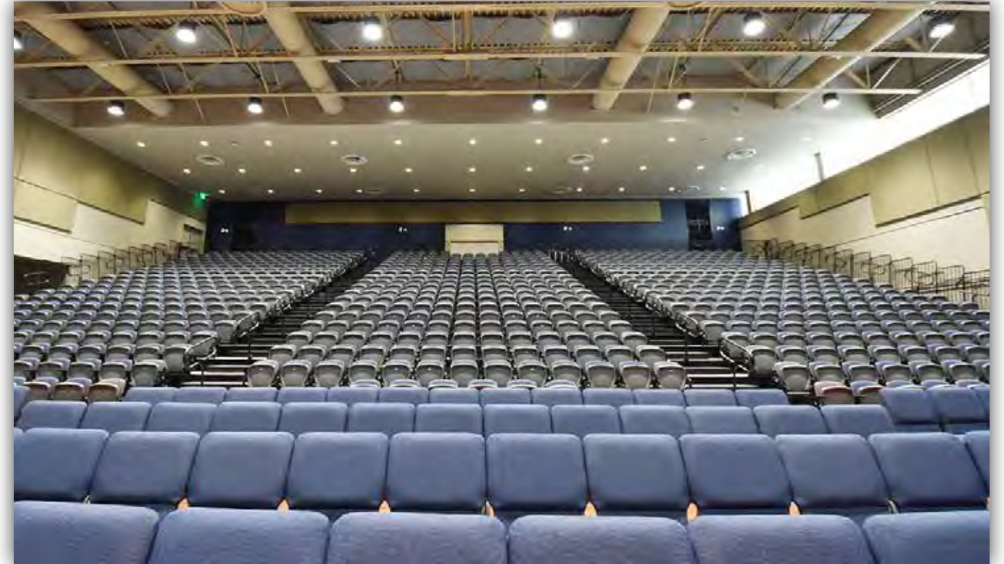
A view of the multipurpose event space from the stage with the retractable seats and removable chairs set in place.