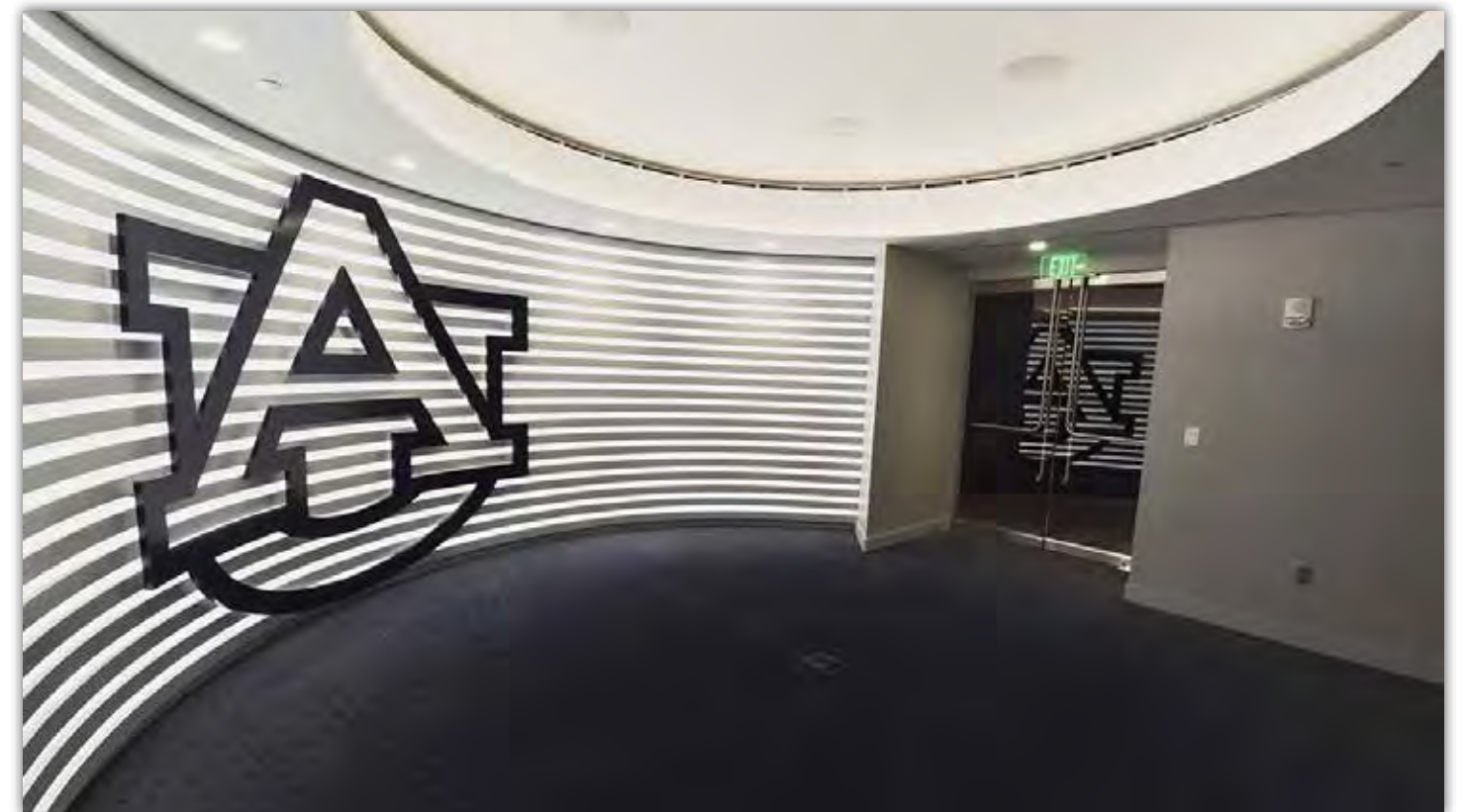
The Hype Room is equipped with specialty lights and speakers to pump up the players prior to entering the basketball court.