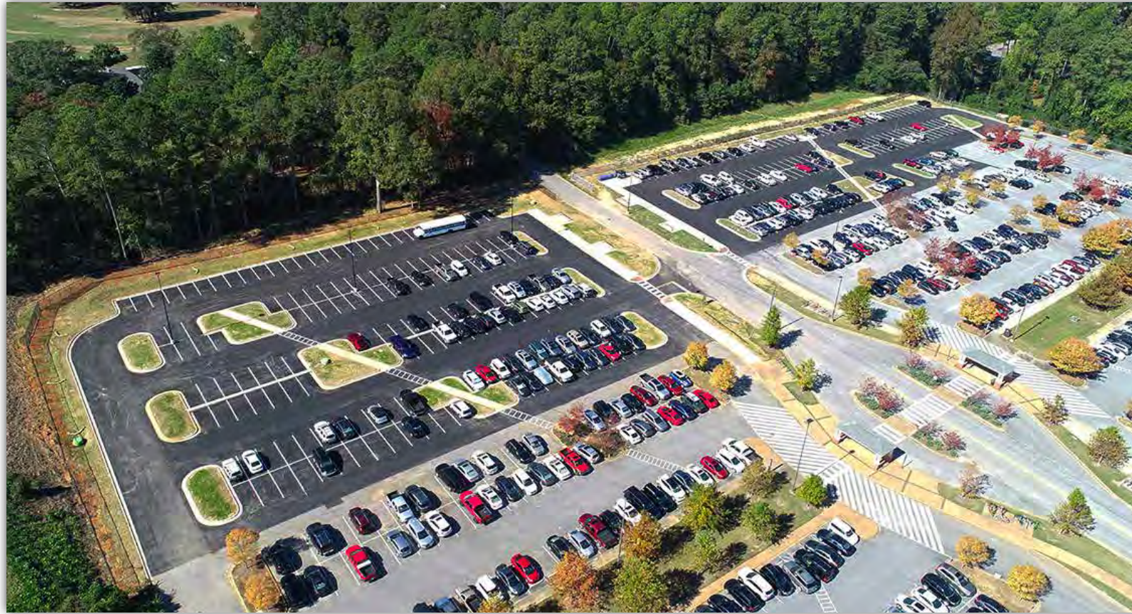
The final phase of West Campus parking recently opened. The new areas are those with the darker pavement.

The project constructed 300 additional paved surface parking spaces at the West Campus Parking Lot for resident students and 300 additional gravel surface parking spaces at the Hayfield Parking Lot (across