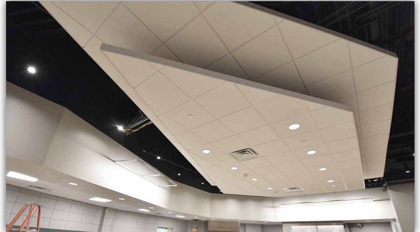
Finishes for Phase II of the renovation, which will include three new dining options, are nearing completion.

Contractor: J.A. LETT CONSTRUCTION COMPANY