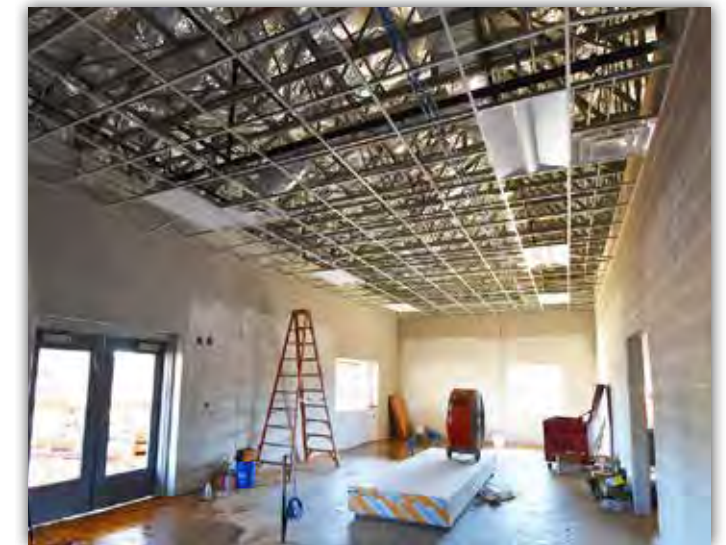
The field house lobby is being prepped for paint.