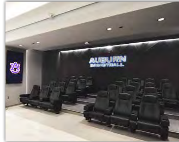
The team meeting room includes tiered seating and a state-of-the-art coaching wall.

Contractor: WHITE-SPUNNER CONSTRUCTION, INC.