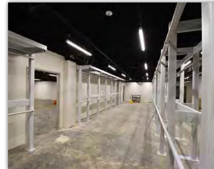
The uniform storage area in the basement nears completion.