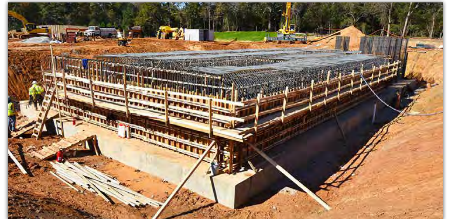
The three-foot thick basement slab has been poured, and now forming and pouring of the two-foot thick walls that will be located under the testing area is underway.