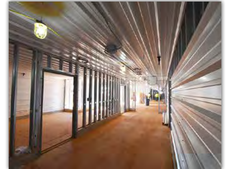
Ceilings are complete and wall panel installation continues in the battery house.