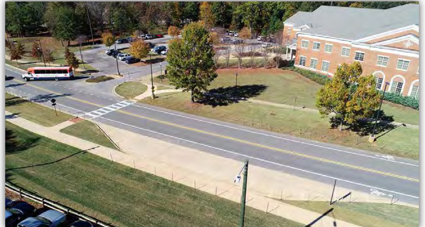
A new Tiger Transit stop has been added to Lem Morrison, along with a sidewalk connecting South Donahue to Duncan Drive.