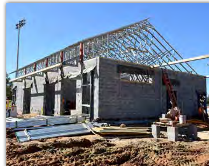
The roof is being framed on the maintenance building.

Contractor: BAILEY-HARRIS CONSTRUCTION COMPANY