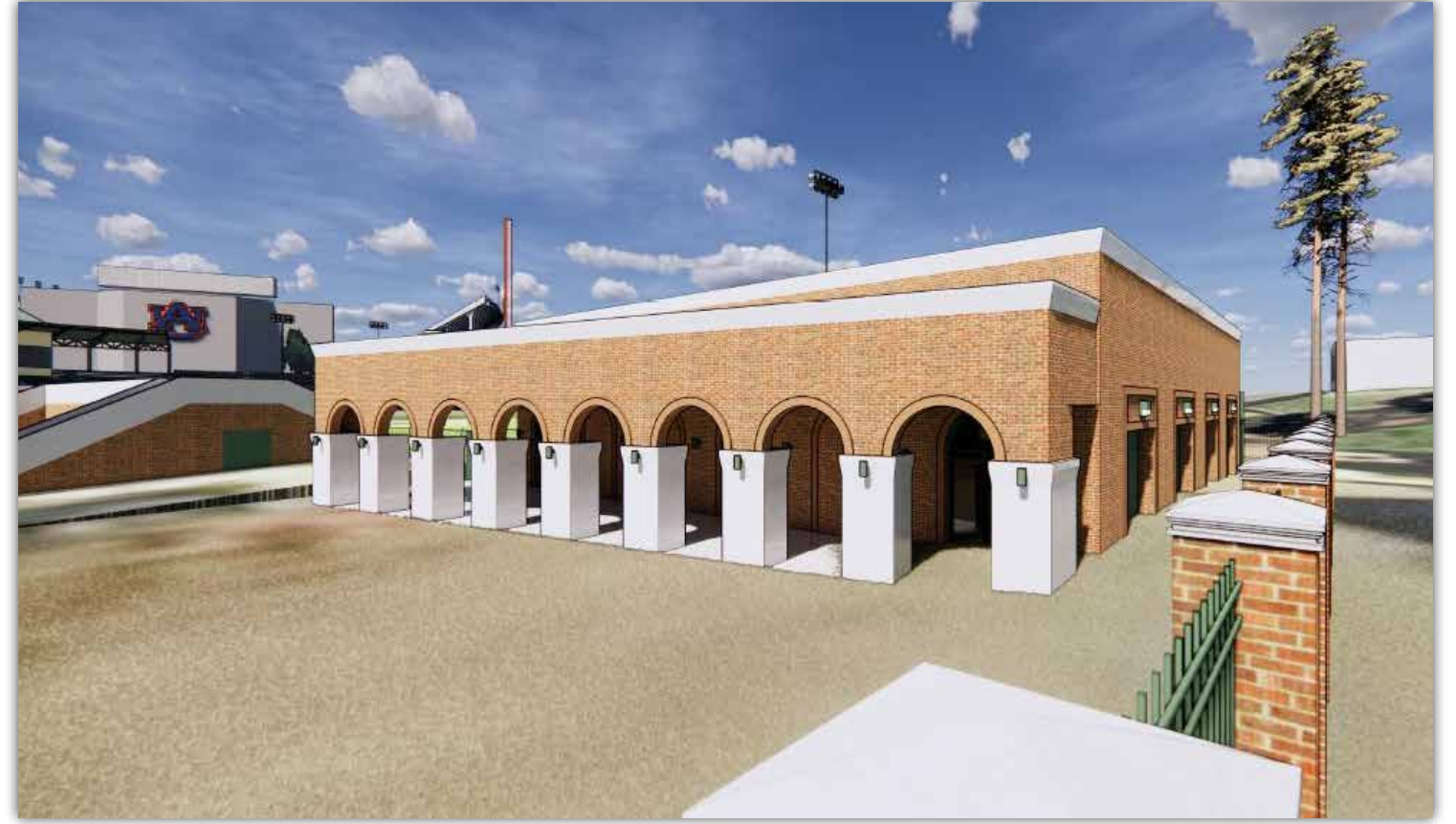
A rendering of the Plainsman Park Player Development Improvements project.

The Plainsman Park Player Development Improvements project will construct a one-story addition to the existing park.