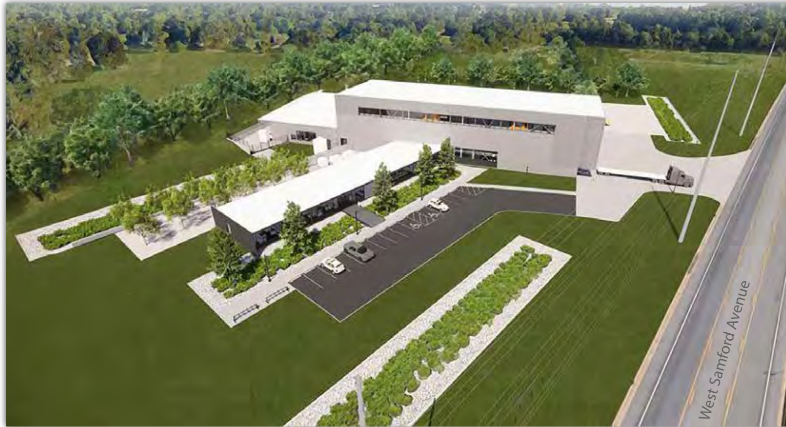
A rendering of the Samuel Ginn College of Engineering Advanced Structural Testing Laboratory.

This facility will provide 39,000 square feet of engineering testing capabilities with modern structural testing equipment. The project will enable the Samuel Ginn College of Engineering to conduct state-of-the-art research and instruction, as well