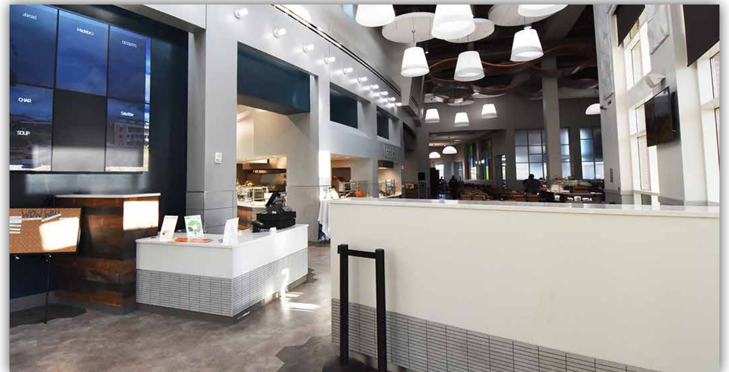
The new entrance to the all-you-care-to-eat dining room.