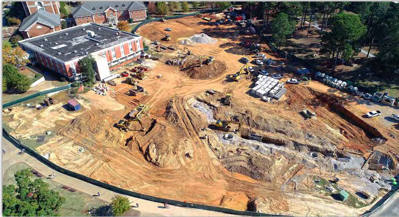
Underground utility (storm, sewer, electrical, water) work continues across the site. Earthwork is also underway to construct the building pads for both the ACLC Classroom and Central Dining Facility.

Phase I of the Academic Classroom and Laboratory Complex (ACLC) and the Central Dining Hall includes abatement and demolition of Allison Laboratory followed by installation of a new storm drainage