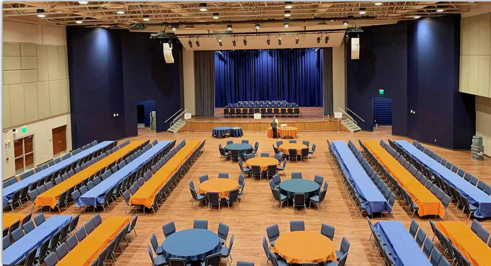
The new multipurpose space inside the renovated Student Activities Center can be set up for special events such as guest speakers, concerts and banquets.

This project renovated 33,400 square feet of the building. It provides a multipurpose event space, which includes an expanded stage, new lighting, theatre equipment, acoustical treatment and event furniture. The project converted the corridors into