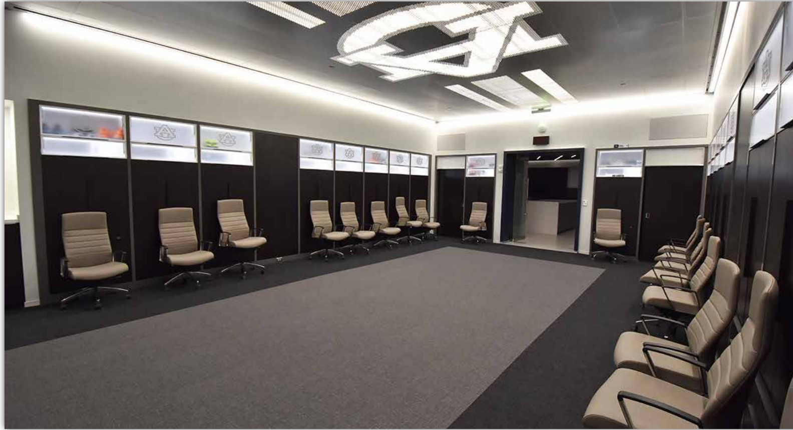
The men's basketball team's new locker room opened in time for the first game of the season.

The Auburn Arena Locker Room Enhancement project renovated 6,700 square feet of the existing Auburn Arena and enhanced the men's basketball support spaces to include a new locker