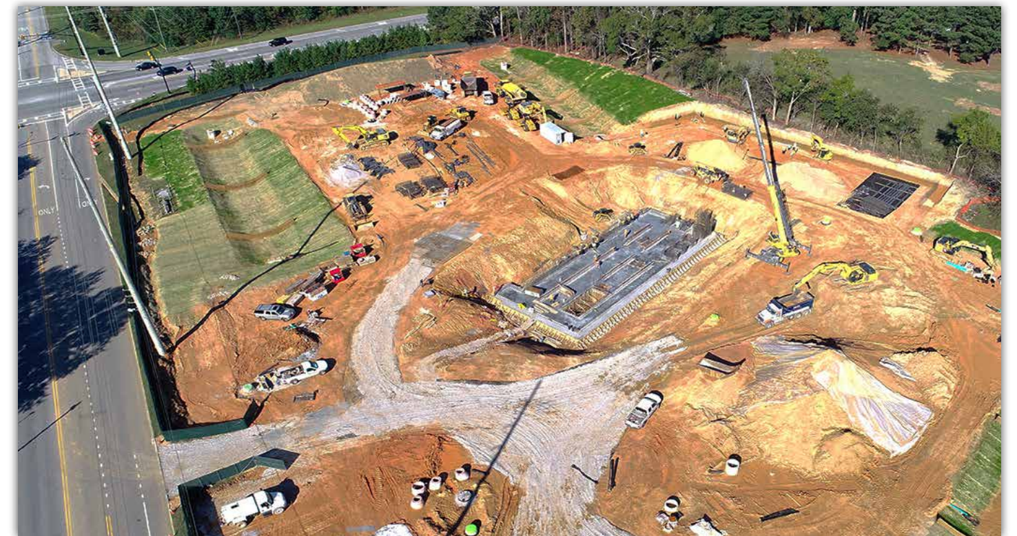
An aerial view of the Advanced Structural Testing Laboratory site located on the corner of Shug Jordan Parkway and West Samford Avenue.