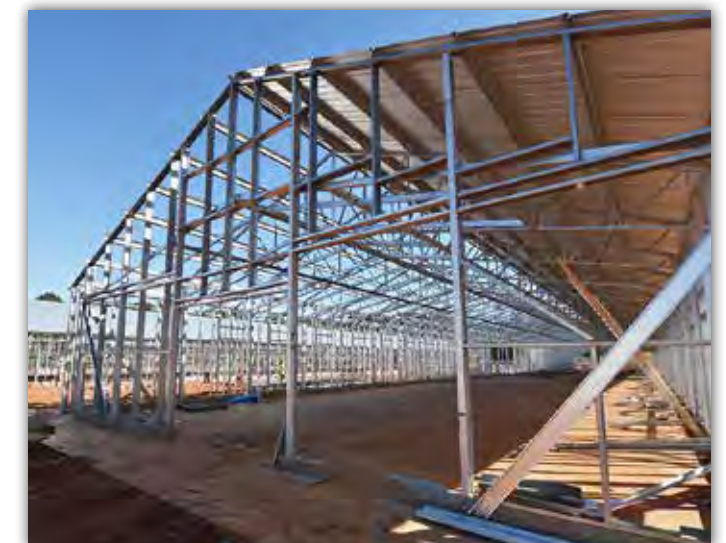
Roofing for pen houses two and three is nearing completion.