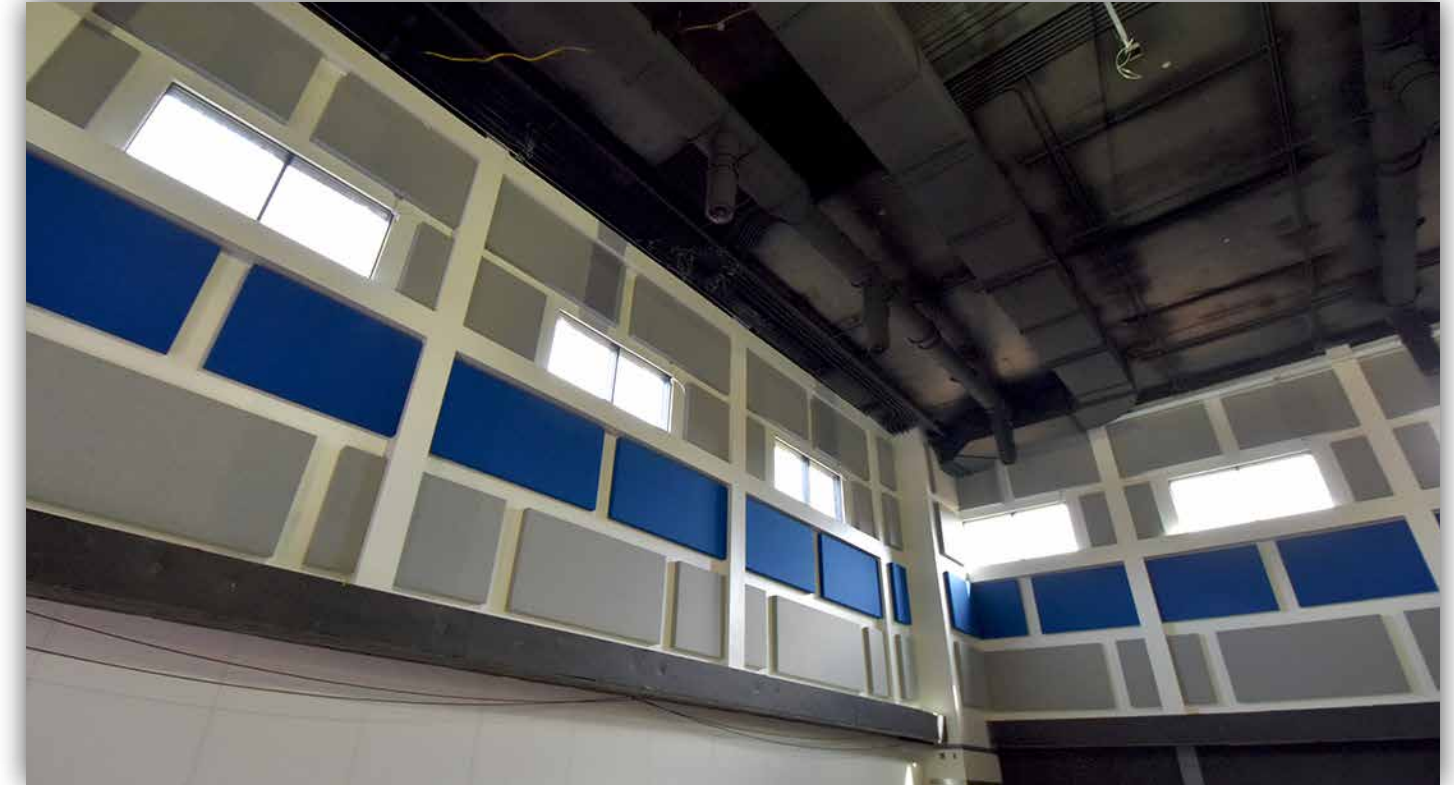
Acoustical panel installation is ongoing on the main level with finishing touches scheduled to begin in mid-November.