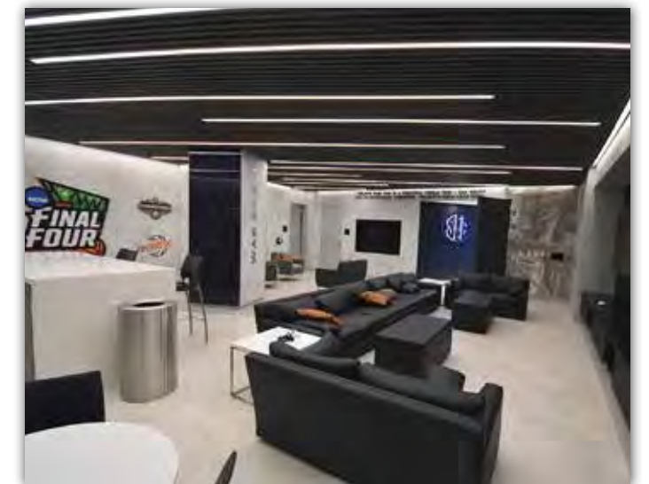
The team lounge area provides space for collaboration, studies and relaxation.