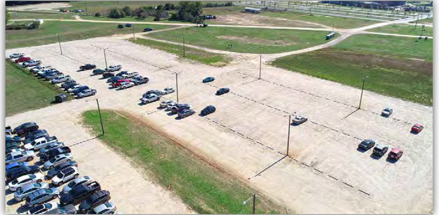
Concrete parking blocks have been added to the hayfields' lot to help align vehicles and maximize use of the space.