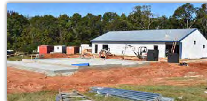
The foundation has been poured for the utility building. The hatchery appears in the background.