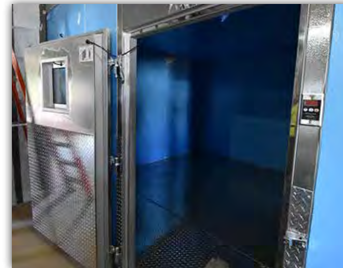
Freezers and coolers have been installed in the processing plant.

Contractor: BAILEY-HARRIS CONSTRUCTION COMPANY