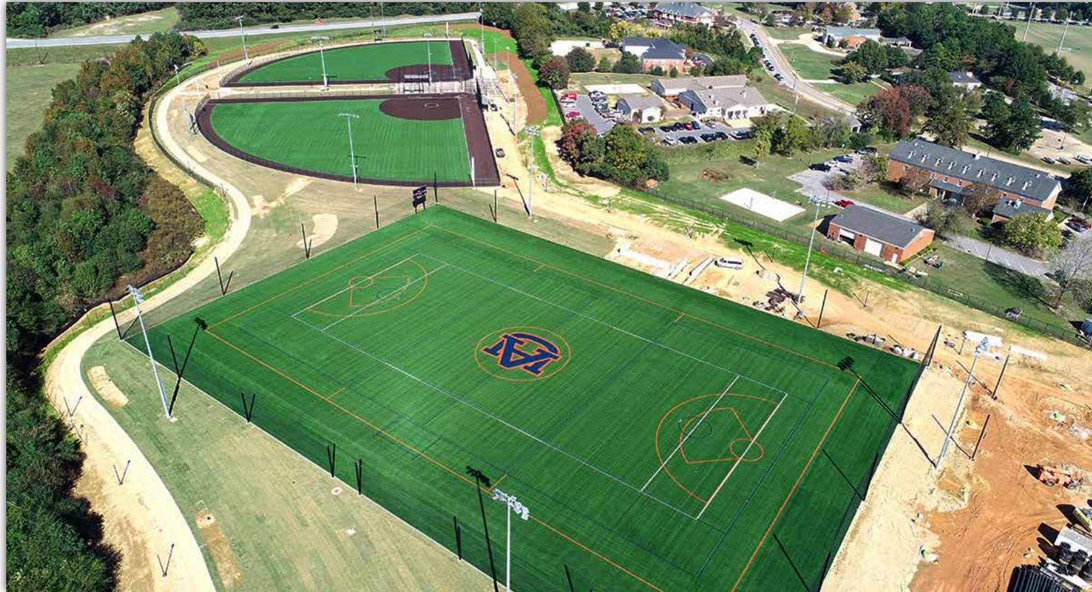
Three of the five new fields are complete - two softball and one soccer. Construction of the remaining two multipurpose fields is ongoing.