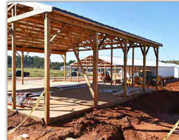
Poles barns are scheduled for a mid-November completion.