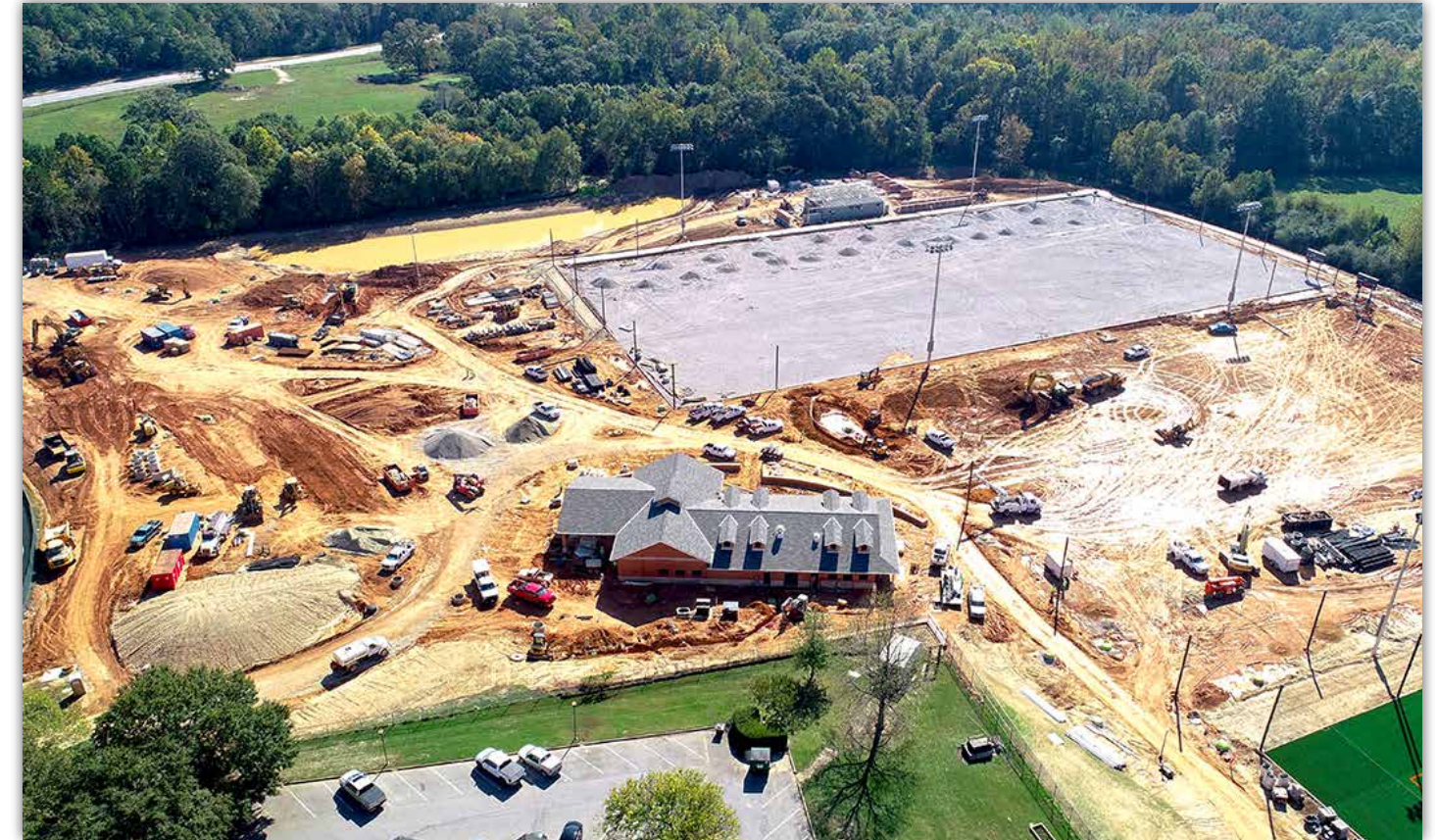
The gravel drainage layer is being applied to one of the two multipurpose fields, while construction of the field house and walking path continues.

This project will include construction of additional new softball and multipurpose lacrosse/rugby/soccer fields to provide more capacity for outdoor intramural and