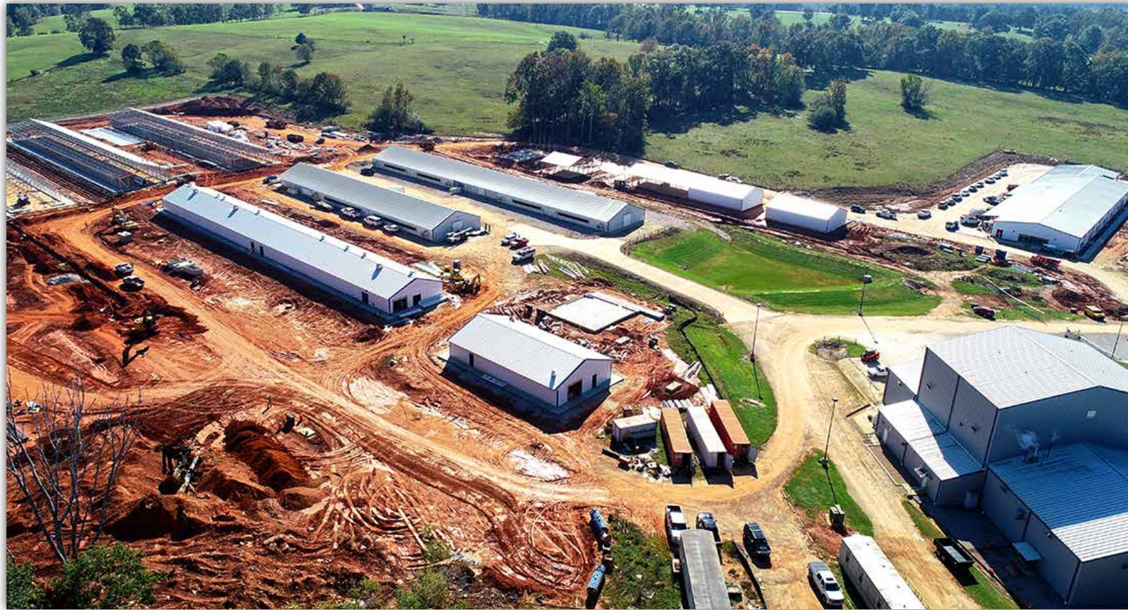
An aerial view of the Poultry Research Farm Unit Relocation site located in North Auburn.

The Poultry Research Farm Unit Relocation Phases III-V will construct the new Phase III Processing Plant. Phase IV will include multiple pen-houses, a hatchery, a battery house, a breeder house and various ancillary buildings. It is anticipated that