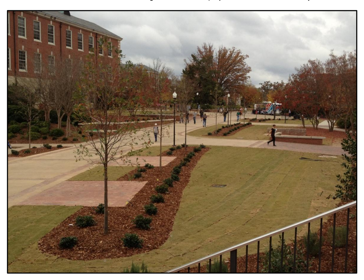
Tiger Concourse and Ginn Plaza – Looking South From Broun Hall to West Thach Concourse

Construction Cost: $1.9 million. The project is on schedule and within budget. The project is currently 75% complete and has Substantial Completion at the end of December 2011. The Carroll Commons/Broun parking lot was completed early for pedestrian use in mid-August, coinciding with the completion of the east-west pedestrian way through the Shelby Center. The portion of the Tiger Concourse from the eastern entrance to Broun Hall southward to Thach was completed for pedestrian use in mid-October. Meanwhile, the project is moving rapidly forward in several areas. The Transit Stop on Magnolia Avenue is under construction along with the bus drop-off area. The concrete walls forming the water feature are complete and the brick veneer and granite facing is being installed. The brick entrance walls and Portals at the Magnolia end of the project are also well underway.