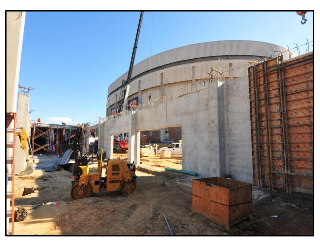
AU Recreation and Wellness Center – Interior View of Foundation Walls