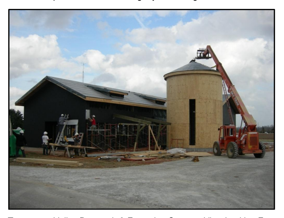
Tennessee Valley Research & Extension Center – View Looking East

Construction Cost: $1.0 million. The project is on schedule and within budget. The project is currently 50% complete and has a Substantial Completion date of January 2012. Electric, water, and gas line installations to the site have all been completed. Exterior framing and insulation are complete. Installation of the metal roof panels for final building dry-in will begin this month.