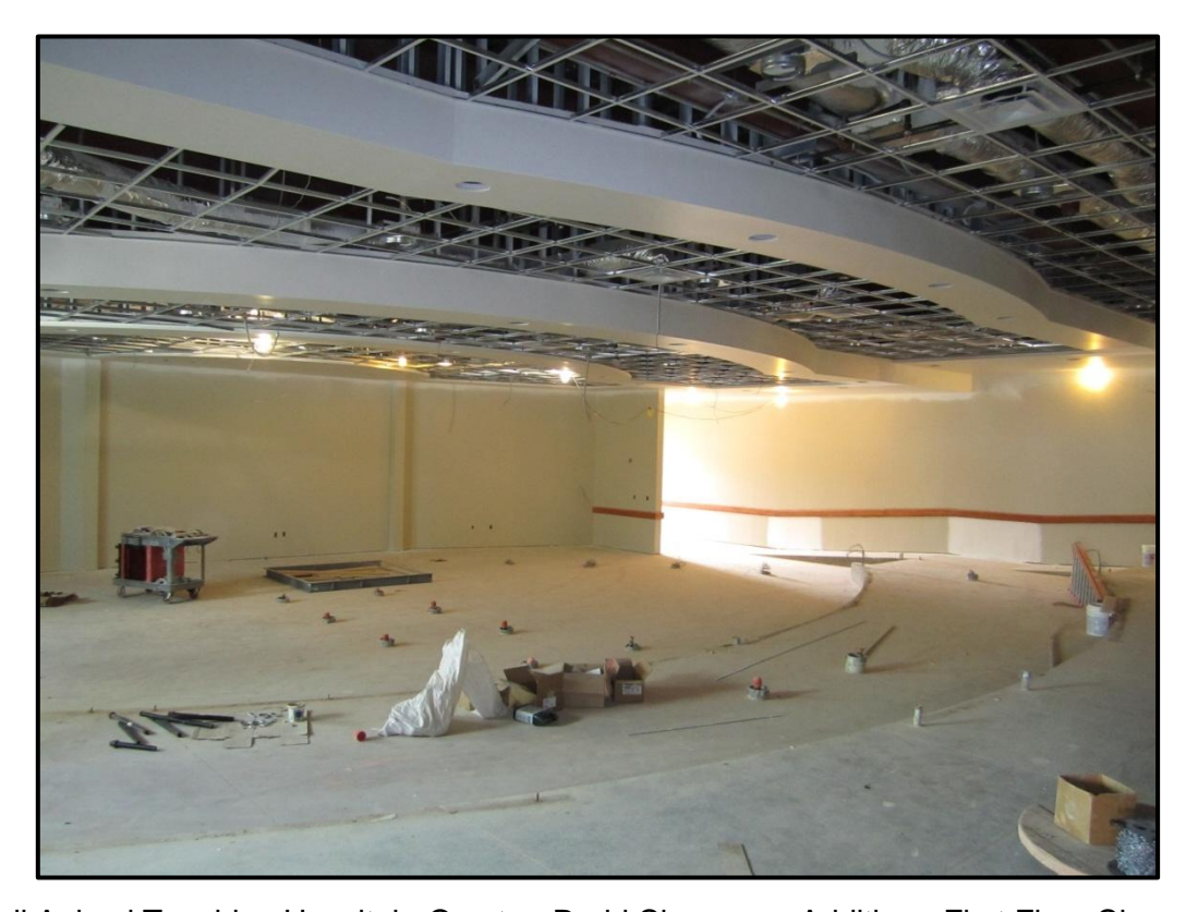
Small Animal Teaching Hospital - Overton-Rudd Classroom Addition - First Floor Classroom