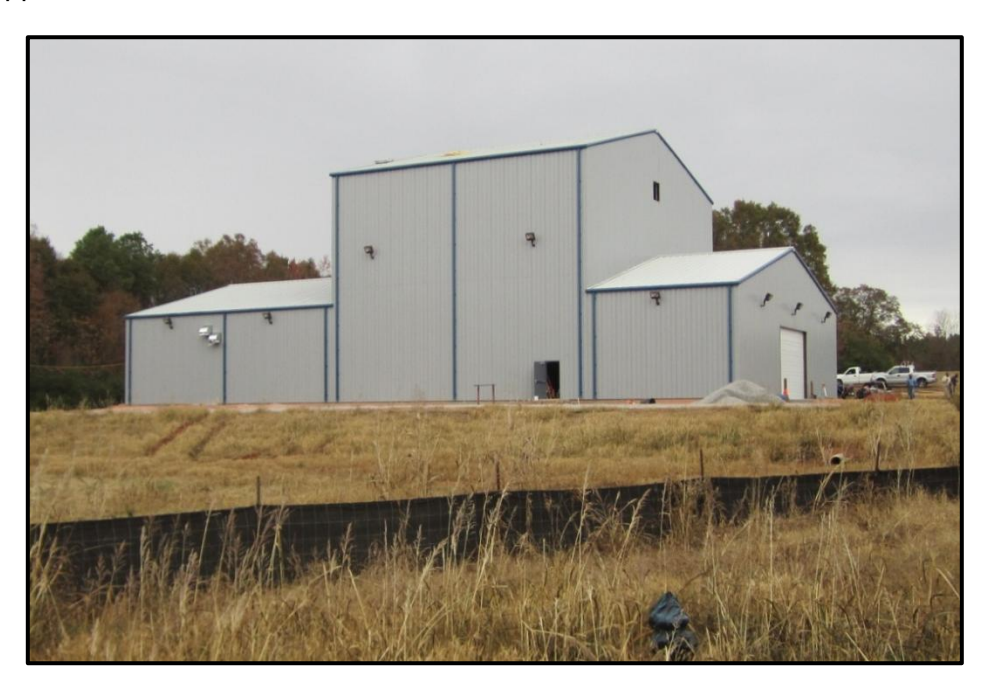
Animal and Poultry Nutrition Feed Mill - East View

Construction Cost: $1.4 million. The project is on schedule and within budget. The project is currently 90% complete and has a Substantial Completion date of December 2011. The metal building is complete and interior finishes are nearing completion. Close coordination continues with the Feed Mill equipment supplier.