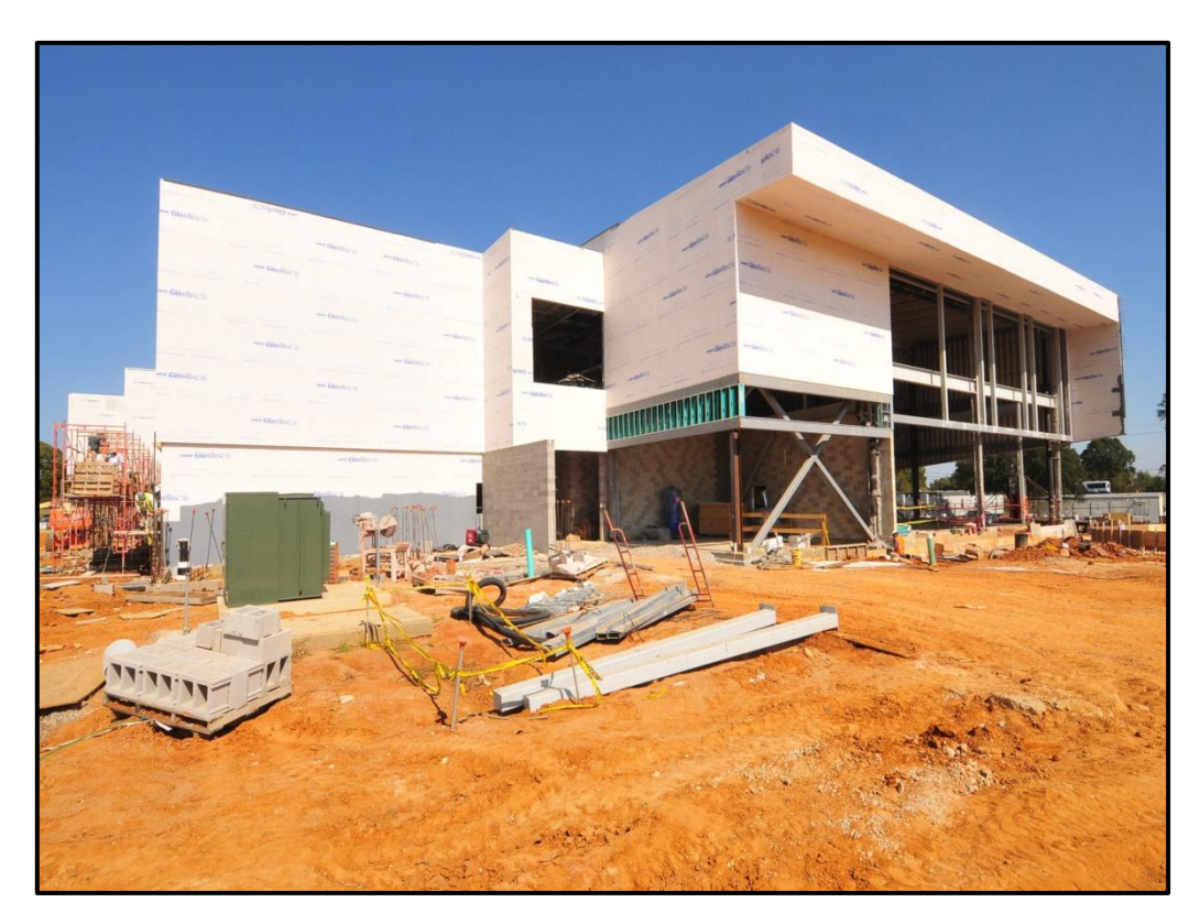
AUM Wellness Center - View Looking South