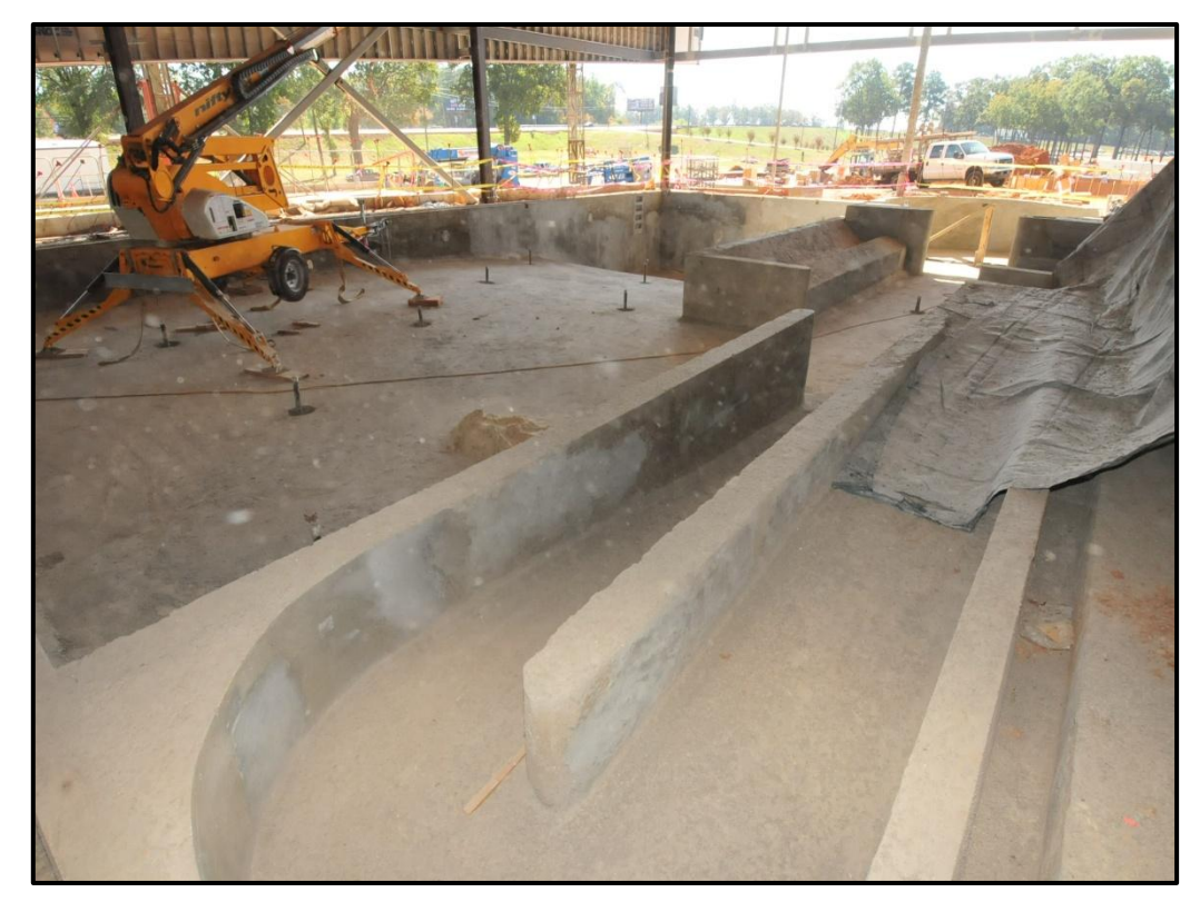
AUM Wellness Center - Interior Pool Construction