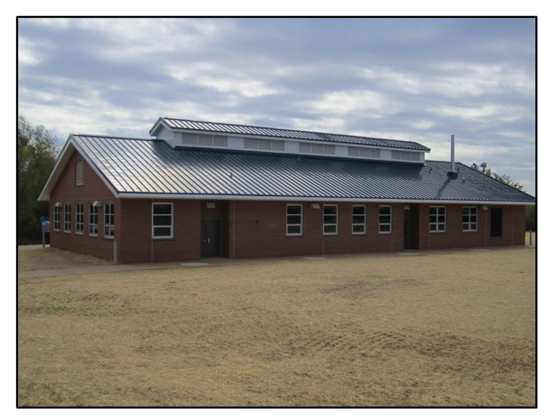
Small Animal Teaching Hospital - Research Lab Building - Northeast View