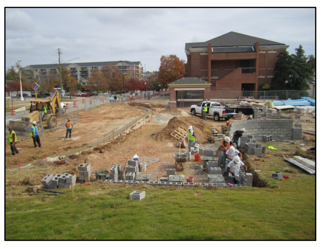
Tiger Concourse and Ginn Plaza – Magnolia Street Transit Bus Drop Off—Looking East