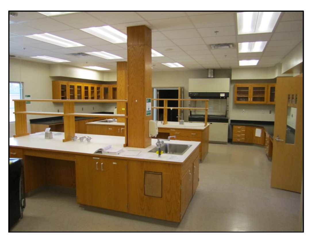
Small Animal Teaching Hospital – Research Lab Building - Laboratory