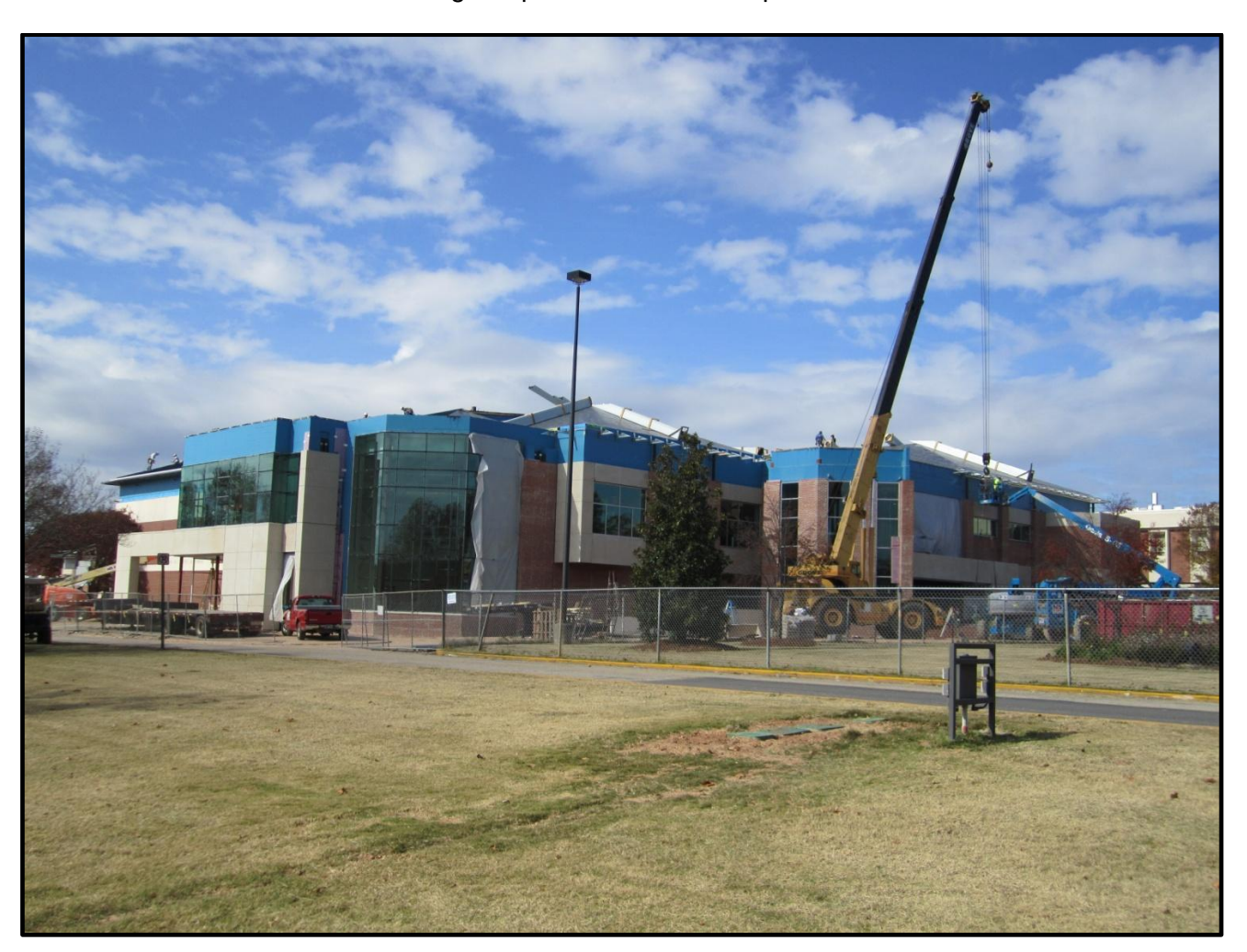
Small Animal Teaching Hospital - Overton-Rudd Classroom Addition (Southeast View)

Phase II of the Small Animal Teaching Hospital will bid the first part of 2012.