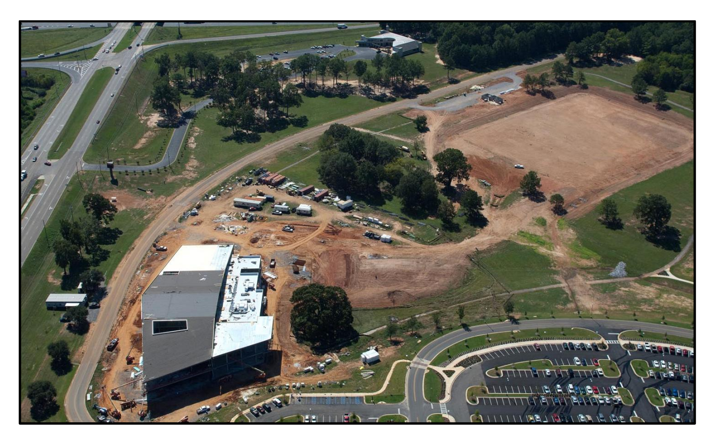
Auburn University Montgomery Wellness Center Aerial View of the New Wellness Center and Intramural Fields

Construction Cost: $16.1 million. The project is on schedule and within budget. The project is currently 65% complete and has a Substantial Completion date of June 2012. The structural steel is complete along with the exterior wall framing and sheathing. The installation of the masonry, stucco, and the window curtain wall system is underway. The roof construction is complete with only perimeter work remaining. Interior mechanical, plumbing and electrical systems are in place with piping and ductwork connections underway. The indoor pool piping is complete, and the exterior spa is currently under construction.