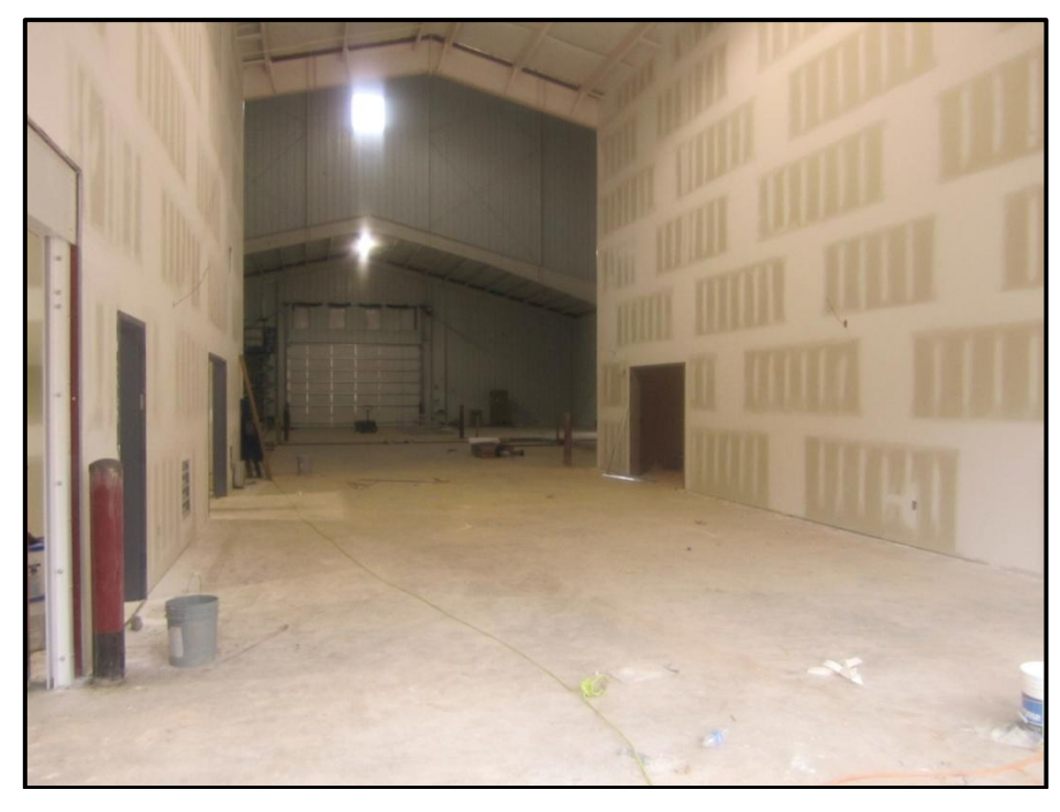
Animal and Poultry Nutrition Feed Mill - High Bay Area For Deliveries