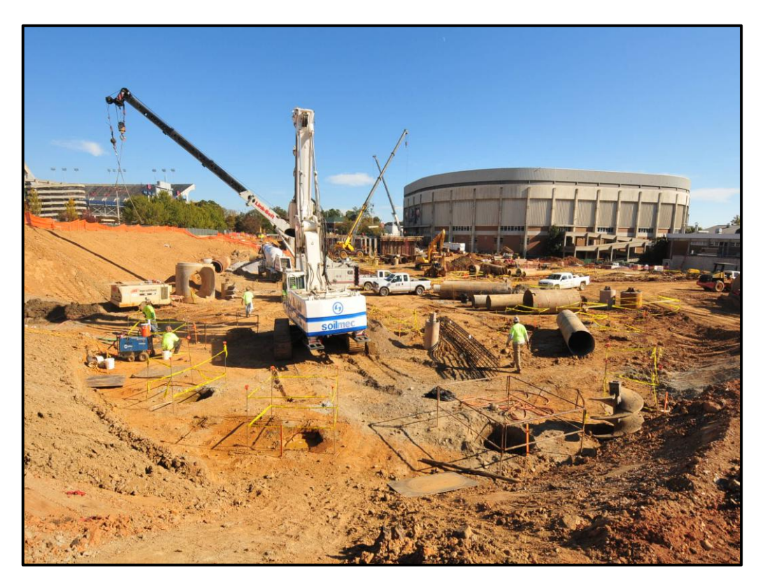
AU Recreation and Wellness Center – Drilled Foundation Pier Holes