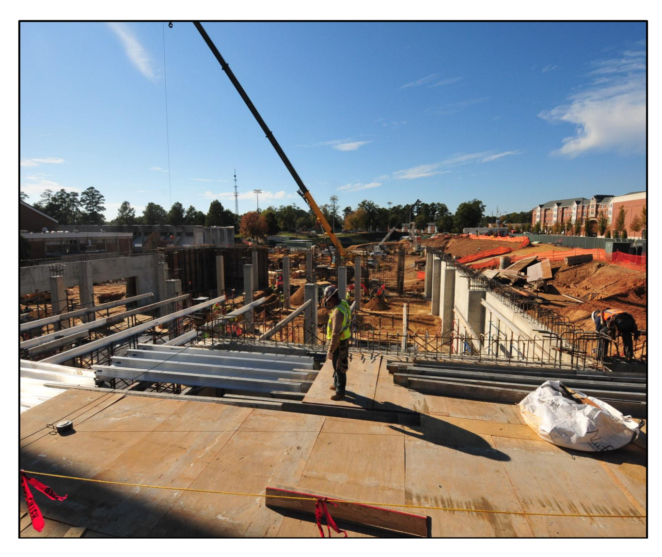
AU Recreation and Wellness Center - View of Elevated Slab, Foundation Walls, and Columns

Construction Cost: $53.0 million. The project is on schedule and within budget. The project is 22% complete and has a Substantial Completion date of May 2013. Foundation walls and columns are about 75% complete in the basketball and racquetball court area of the Wellness Center and progressing well in the elevated track area. The fourth elevated slab pour, which is in the basketball and racquetball court area, occurred the week of November 7, 2011. In the Health and Wellness area, the drilled piers for the building foundation continue to progress well and will complete this month. The underground domestic water and sanitary sewer are complete. Structural steel erection began the week of November 14, 2011. The closure of Heisman drive will take place over Christmas break to complete sanitary, storm, and electrical connections. A great deal of effort has gone into coordination and communication of this road closure in order to mitigate its impact to campus.