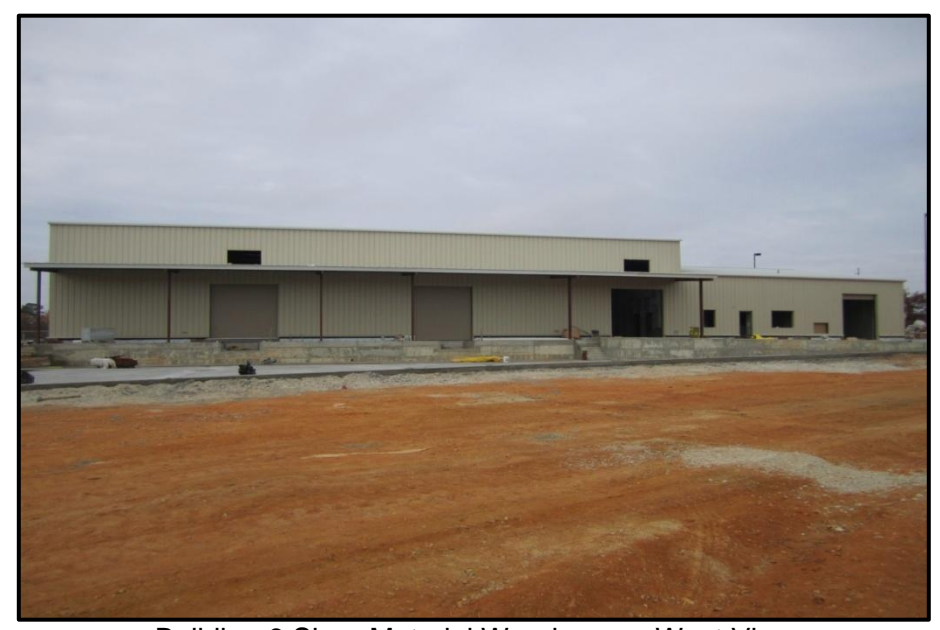
Building 6 Shop Material Warehouse -West View

Construction Cost: $4.1 million. The project is 76% complete and has a Substantial Completion date of late December, 2011. In the Building 6 Shop Material Warehouse, the drywall, electrical and plumbing work is nearly complete, and the heating and air conditioning system installation continues to progress. The contractor has poured the loading dock apron and is currently installing masonry around the perimeter of the building. In the Building 7 Shop Facility, final paint is underway and mechanical and electrical systems are nearing completion. On the exterior, the masonry is installed, and window installation will begin this week.