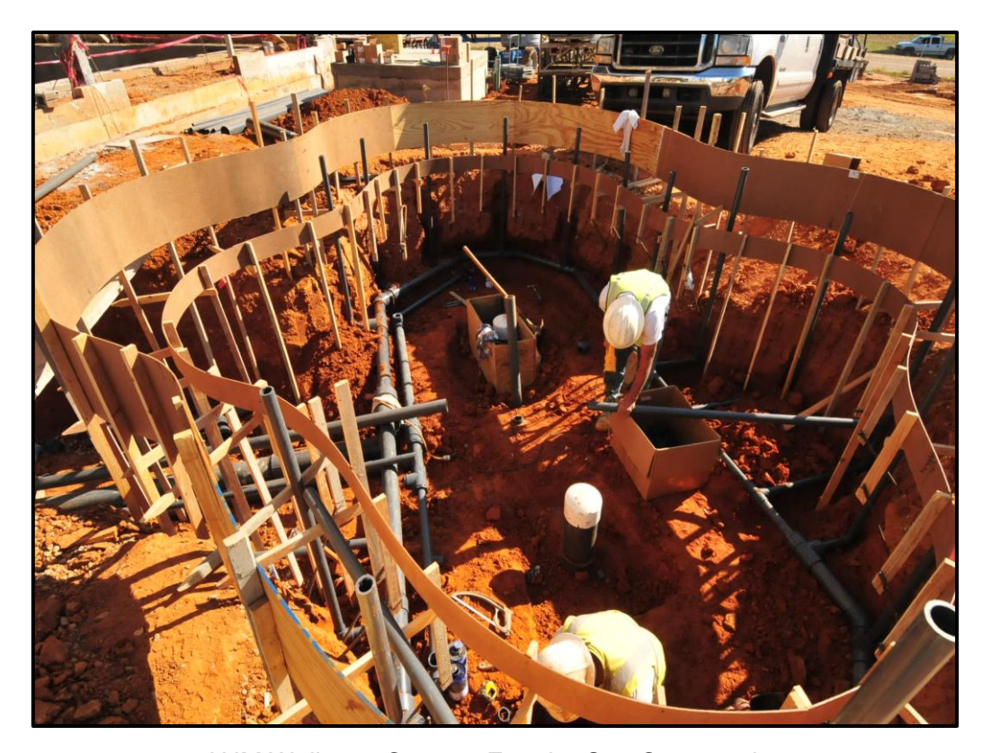
AUM Wellness Center - Exterior Spa Construction