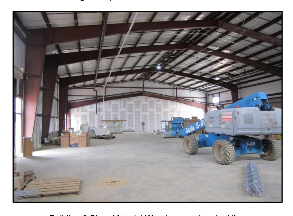
Building 6 Shop Material Warehouse - Interior View