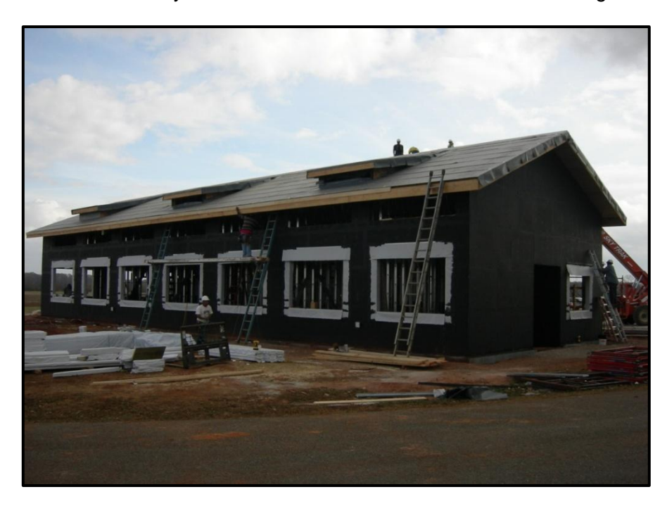
Tennessee Valley Research & Extension Center – View Looking Southeast