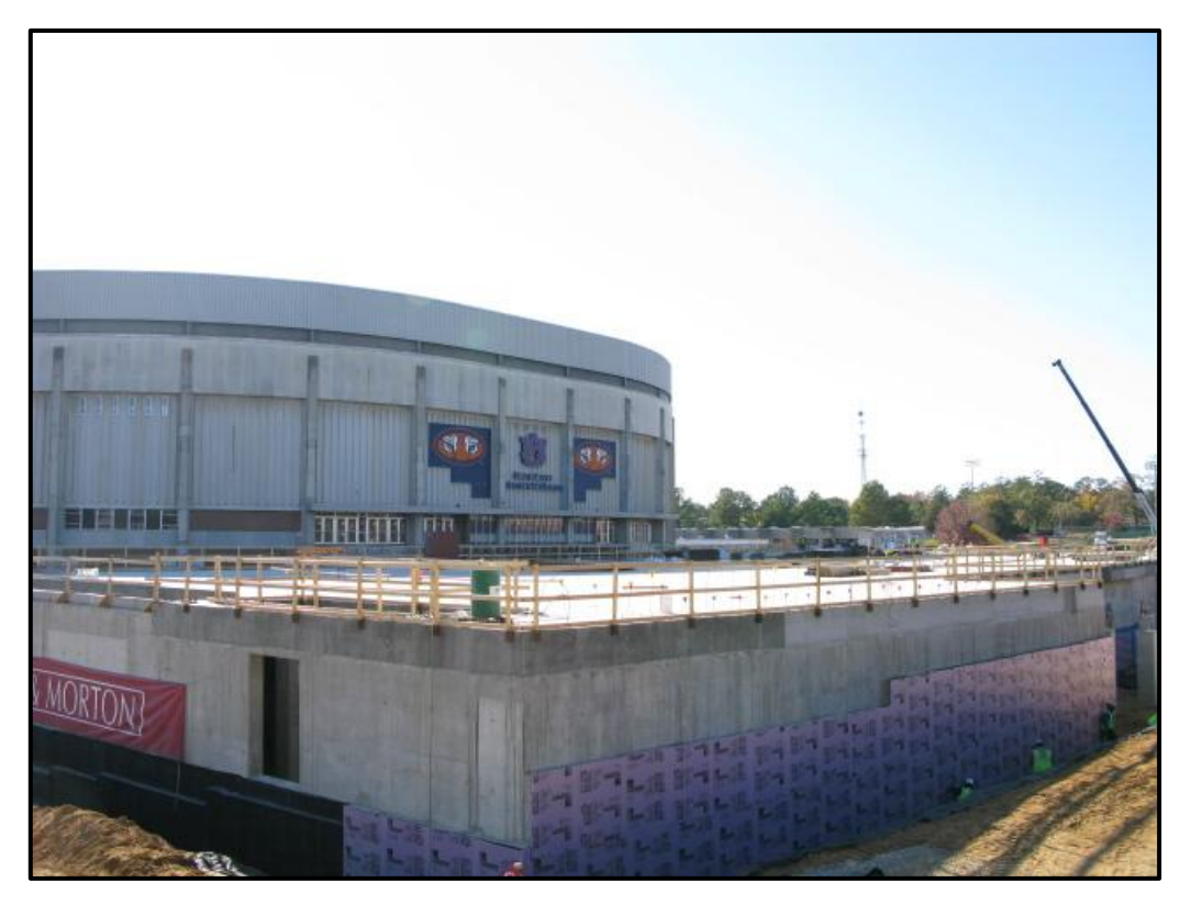
AU Recreation and Wellness Center - Northeast Corner - Elevated Slab