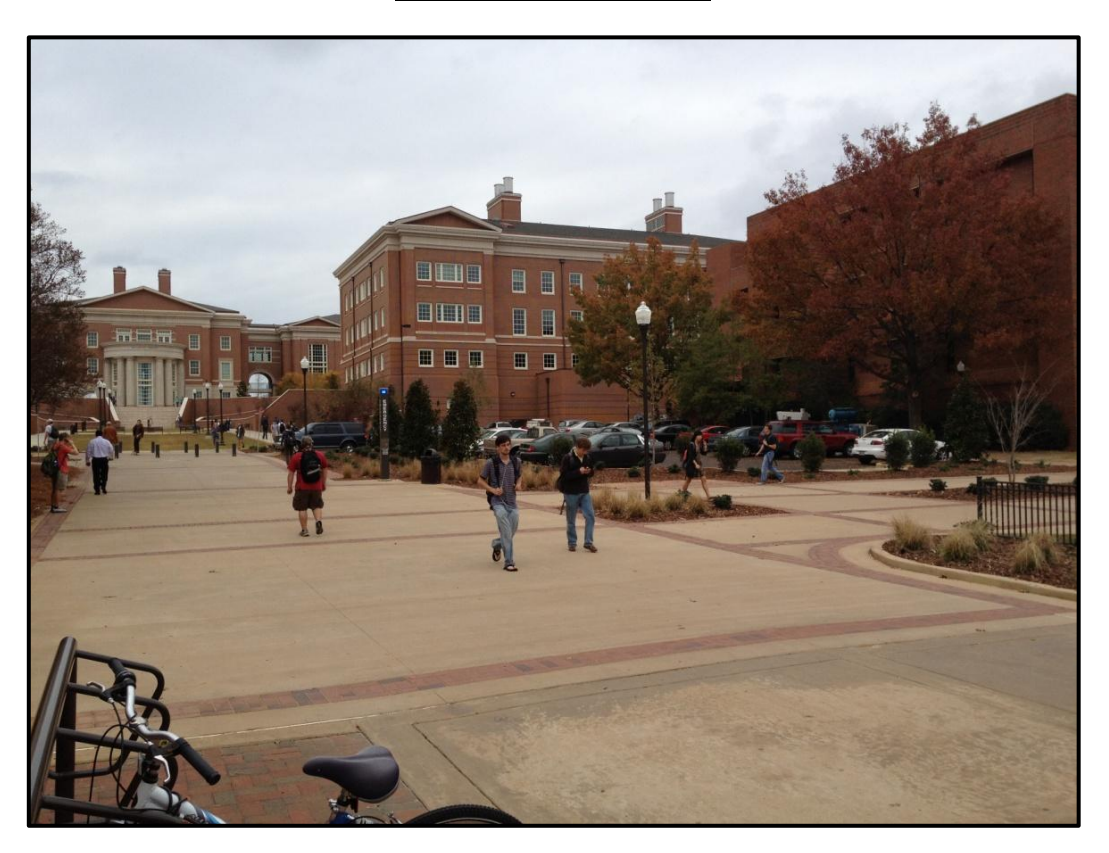
Carroll Commons Area - Looking North toward Shelby Center