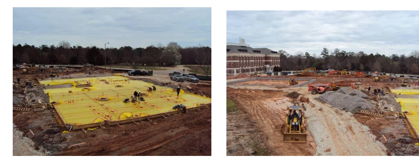
Construction Work on Foundation

<u>Office or Information Technology (OIT) Building</u>: Construction Cost: $12.0 million. Project is 8% complete. Building site work, foundation construction, and installation of underground utilities are underway. Project completion date is February 2011.