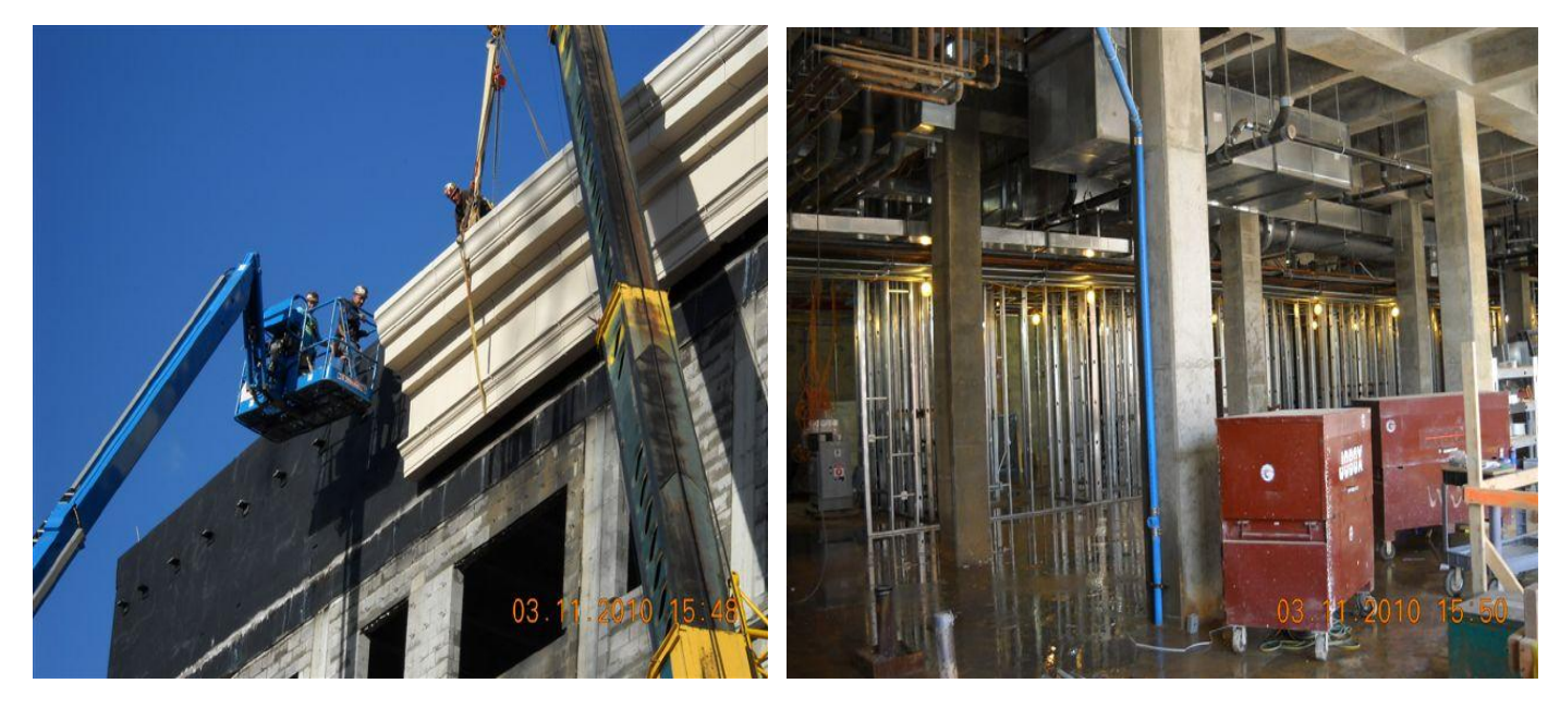
Decorative Stonework Installation