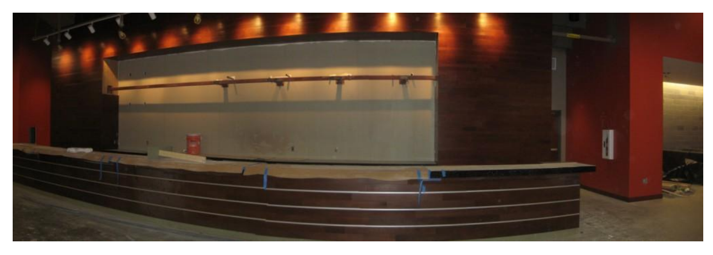
Courtside Club Area