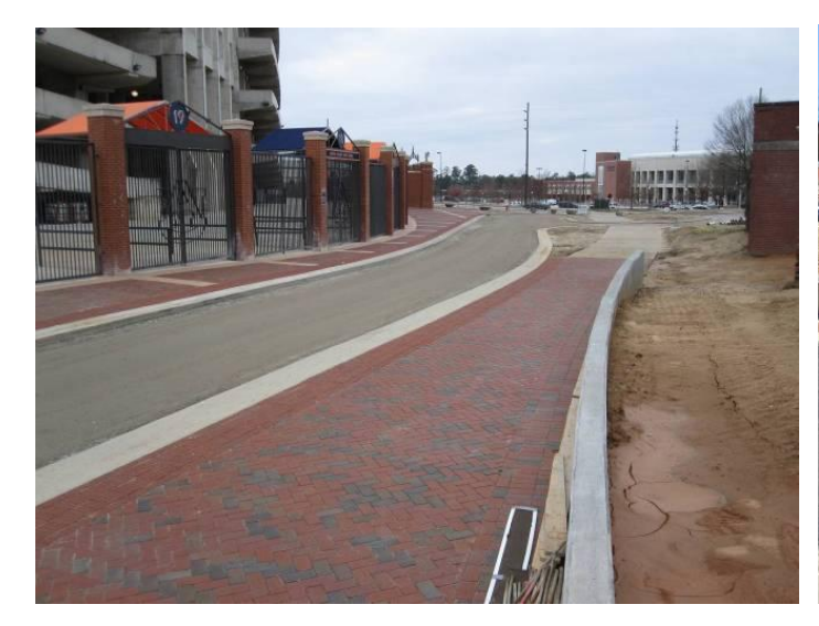
Stadium Loop Road Northwest End of Stadium