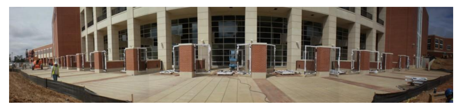
View of the New Basketball Arena from East (Tailgate Suite Area)