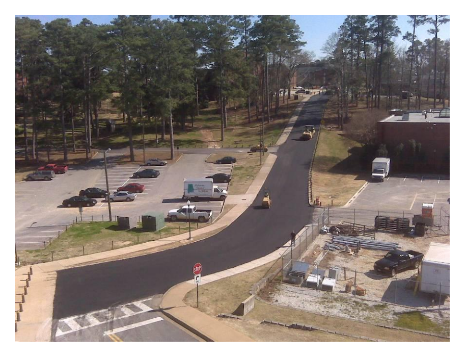
Duncan Drive Looking South from the Parking Garage