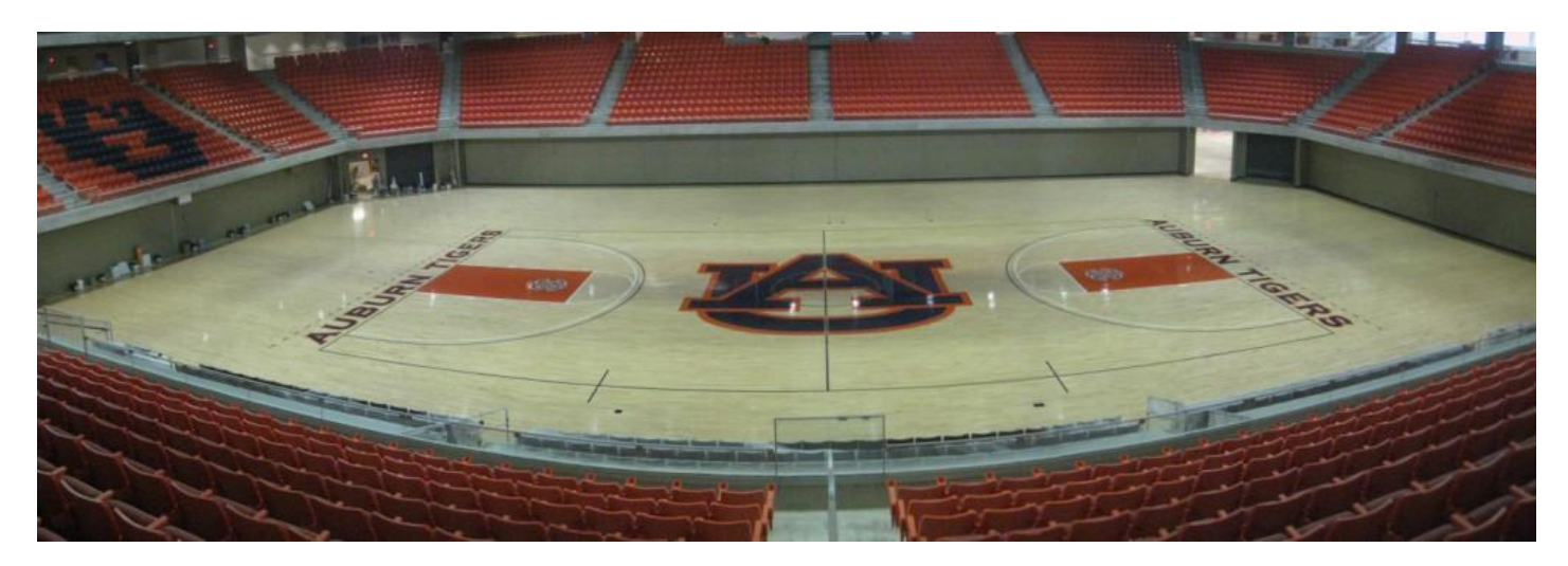
Main Arena Bowl as Seen from Concourse Level