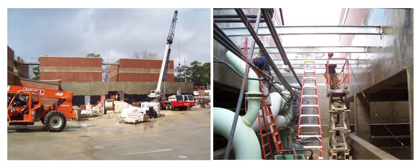
Two New Cooling Towers

District Energy Plant Expansion: Construction cost: $9.9 million. The project is 85% complete. This project will provide additional cooling capacity to the University chilled water system to support the Village Housing complex, Village View Dining facility, and the new Basketball Arena. The installation of two new 2500 ton chillers inside the existing plant is complete. Currently work is ongoing on the construction of two cooling towers to support the new chillers. The project is on schedule to be completed in May 2010 and is within budget