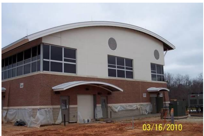
View of Terminal from South End