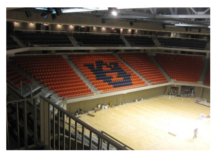
Logo in the Seats at the South End