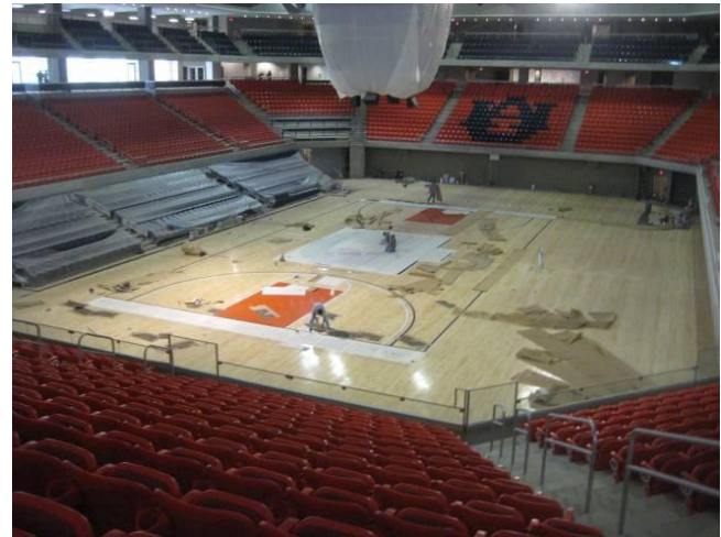
Main Arena Floor Being Prepped for Paint