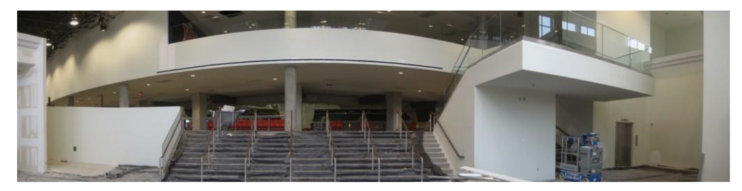
General Public Entrance at North Clerestory