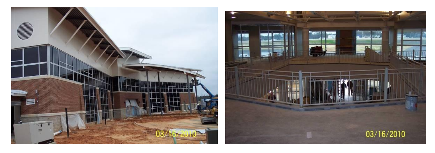
Front View of Terminal