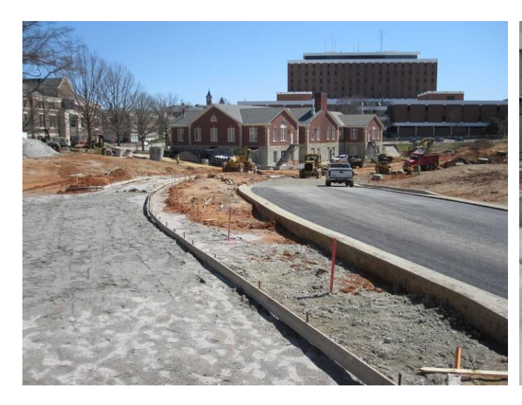
Stadium Loop Road – North End of Stadium