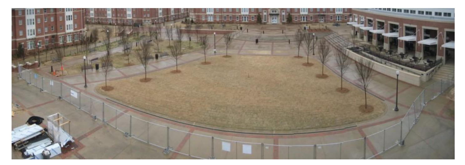
Village Plaza Phase II Looking from Arena