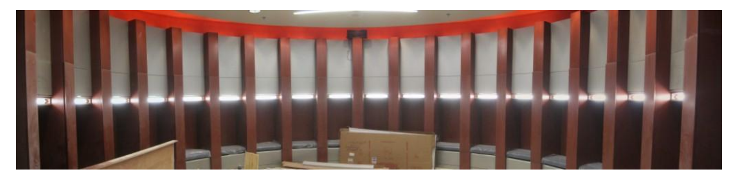
Women's Locker Room Area