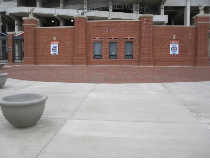
New Plaza at West Side of Stadium