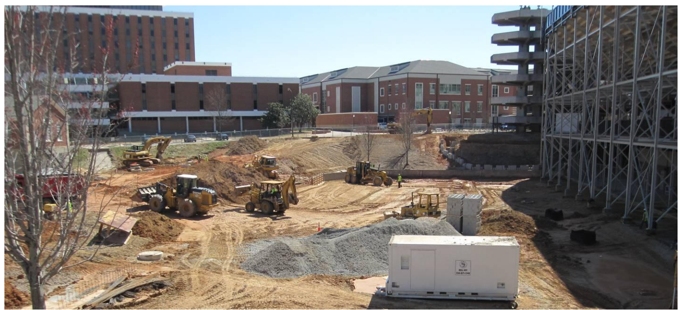
Work in "Petrie Bowl" at North End of Stadium

Campus Green: Construction Cost: $7 million. Phase I of the project was completed on August 17, 2009. Phase II began December 1, 2009 and is scheduled to be complete by May 29, 2010. Currently, the overall project is 86% complete. Phase II extends Stadium Loop Road behind Petrie Hall to Donahue Drive and constructs brick plaza areas adjacent to the Stadium on the North side similar to those constructed on the East side.