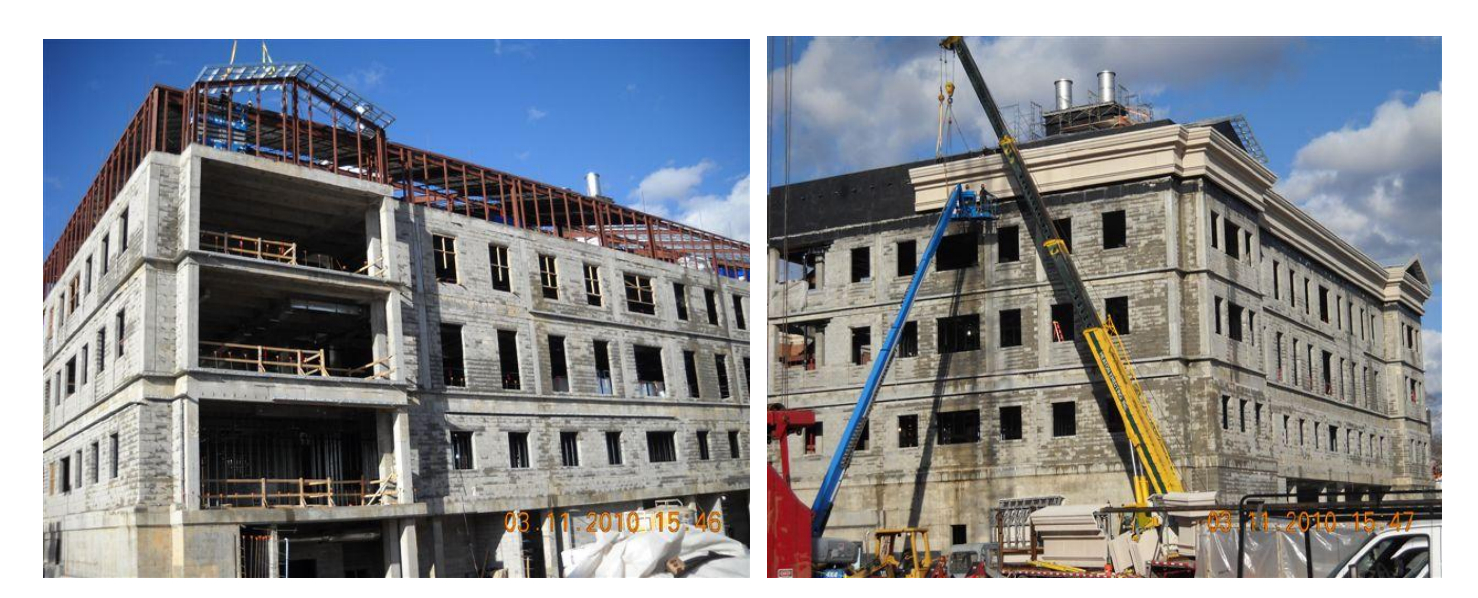
View of Building G looking Northeast