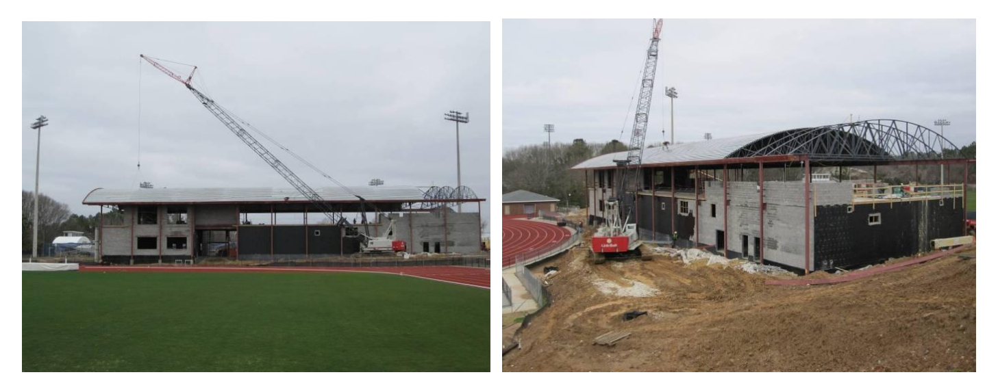
View of Soccer/Track Facility Looking North

Soccer/Track Facility: Construction Cost: $4.8 million. Project began in August 2009. Project is currently 32% complete. Progress on this project has been slowed by wet winter weather. First and second floor concrete slabs are in place. Structural steel and metal roof are ongoing. Work on interior plumbing, electrical, concrete block walls is ongoing. Anticipated completion date is July 2010.