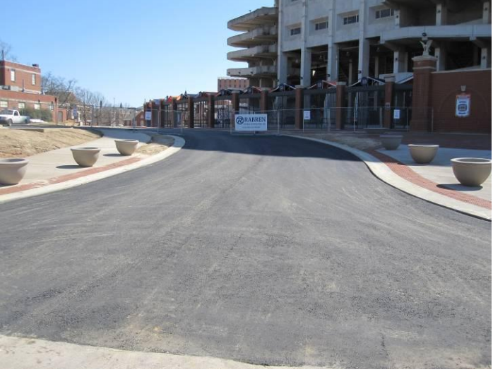
Stadium Loop Road - West End of Stadium