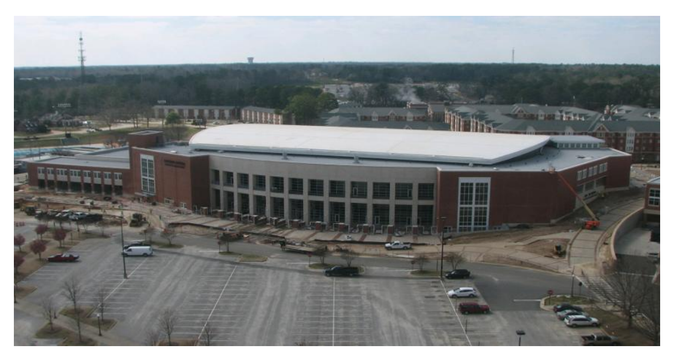
View of the New Basketball Arena from Jordan-Hare Stadium

New Basketball Arena : Construction Cost: $68.5 million. The Arena is currently 91% complete. Contract completion is July 25, 2010, but the project is on schedule to complete by May 2010. Interior finish activities such as painting and cabinetry are complete in some areas and well underway in others. Architectural punch lists are also in progress in select areas. Finish exterior work, such as sidewalks and landscaping is also underway. The Hall of Honor work has begun and is scheduled to complete in June 2010.