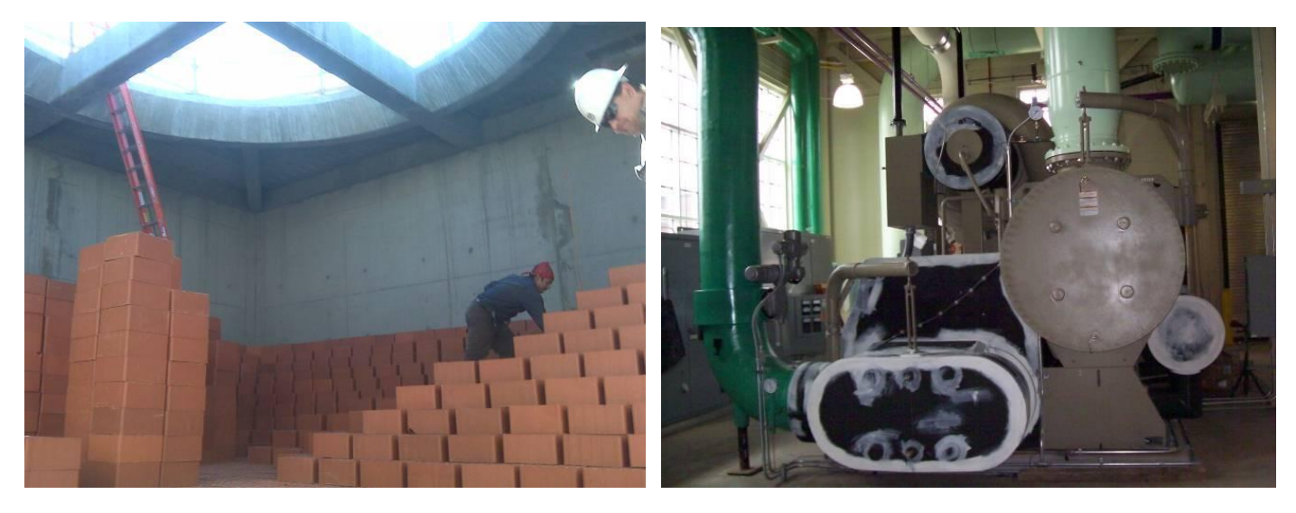
Placing Fill Block in Cooling Towers