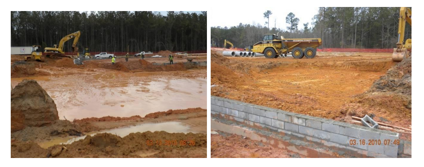
Project Site after 5 Inches of Rain