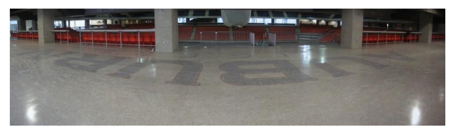
Auburn Tiger Logo in Terrazzo Floor at Concourse A-B