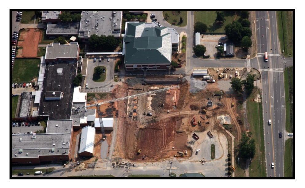
Aerial Photo of Small Animal Teaching Hospital Phase II

Construction Cost: $47 million. This project is on schedule and within budget. The project is currently 4 percent complete and has a substantial completion date of September 2014. Excavation for the terrace level continues towards Wire Road. One of two tower cranes has been erected and foundation construction has commenced for this lower level. Underground utilities are being installed. A new client equine drop-off/pick-up area is being coordinated and built for the Large Animal Hospital.