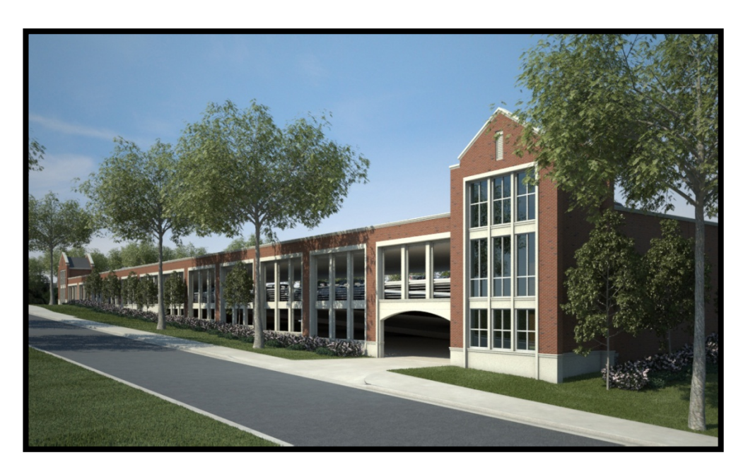
Rendering of Biggio Drive Parking Facility Building

Construction Cost: $8 million. This project is on schedule and within budget. The overall project is 28 percent complete and has a substantial completion date of March 2013. Mass grading operations are 95 percent complete with more than 50,000 cubic yards of soil removed from the site. Foundation installations are 30 percent complete and scheduled to be complete by late July 2012.