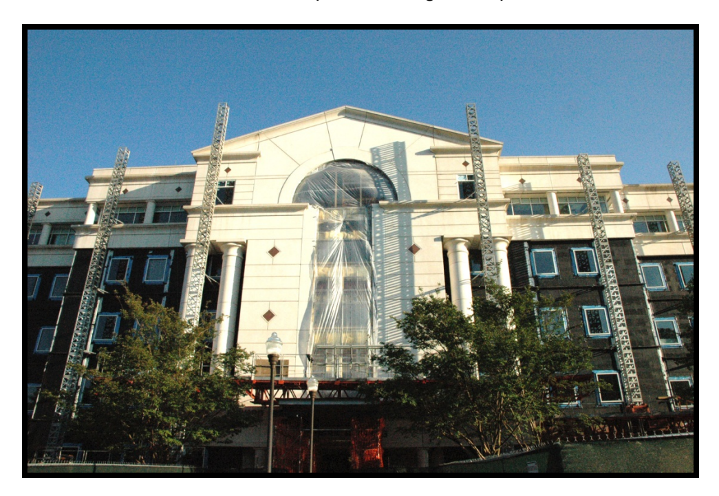
Lowder Business Building - North Elevation Repair Work

Construction Cost: $5.6 million. This project is currently 28 percent complete and has a completion date of February 2013. The demolition phase of the project is about 45 percent complete overall and "new masonry" installation is approximately 25 percent complete while installation of the new waterproofing and new masonry continues as scheduled in phases around the building. The demolition of the structural window wall is complete. The individual window replacement is complete on the north (front) and west elevations. The work at the dome atop the building is complete