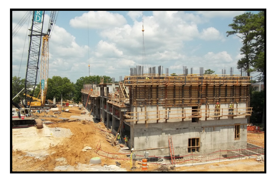
Student Residence Hall at West Samford Avenue and South Donahue Drive View Looking West