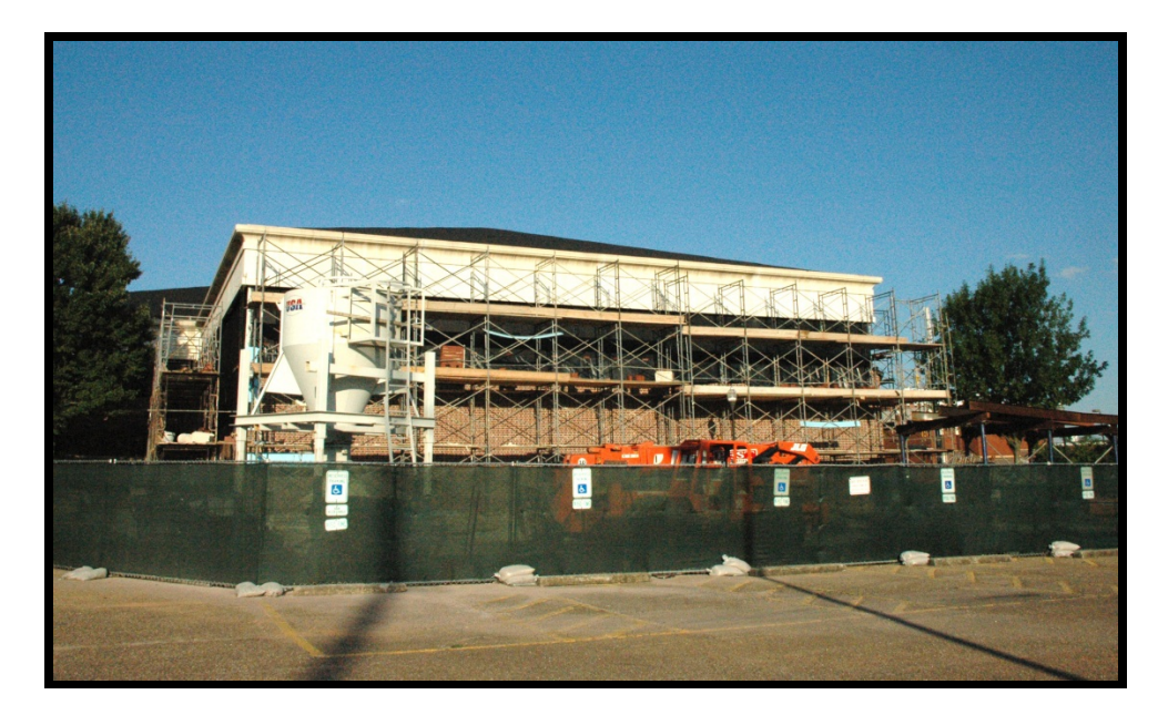
Lowder Business Building – Classroom – View Looking East