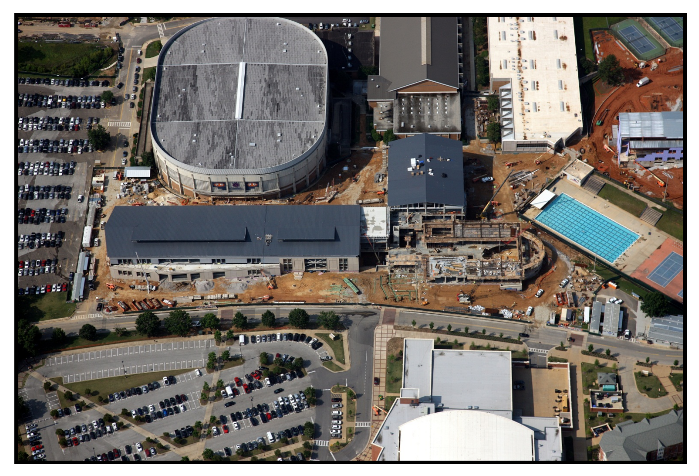
Aerial Photo of AU Recreation & Wellness Center

Construction Cost: $53 million. This project is on schedule and within budget. The project is 63 percent complete and has a substantial completion date of May 2013. The exterior elevations are currently being covered with precast panels, brick, and window framing systems and are approximately 90 percent complete. This protection from the weather will allow the installation of interior finishes to begin within a few weeks. Interior mechanical, electrical, and plumbing installations are well underway and interior wall framing has begun. Primary electrical power to the building is scheduled to be online July 6, 2012. The courtyard area concrete work is complete as well as all major foundation work for the tower and climbing wall.