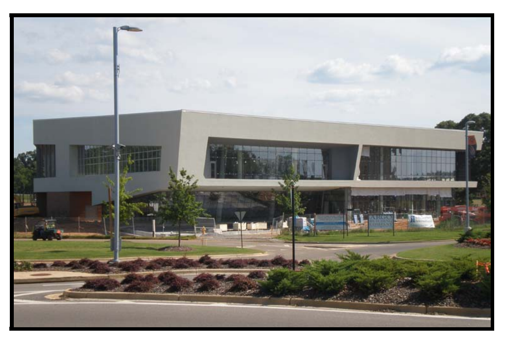
Auburn University Montgomery Wellness Center - View Looking South

Construction cost $16.1 million. The project is on schedule and within budget. The project is currently 92 percent complete and has a substantial completion date of July 2012. The exterior glass wall installation is 95 percent complete. Final painting, cabinet work, and other interior finishes are well underway. The floor installation of the gym and elevated running track has begun. The tile installation for the main pool and spa is complete. Landscape, irrigation, and the exterior volleyball court have all commenced.