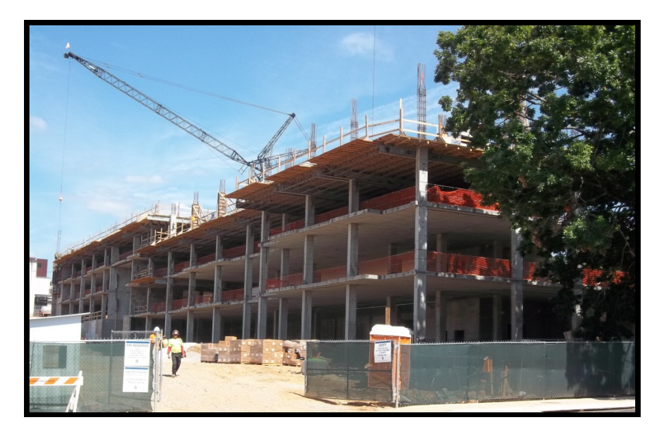
Student Residence Hall at West Samford Avenue and South Donahue Drive View Looking Southeast

Construction Cost: $51 million. This project is on schedule and within budget. The overall project is 19 percent complete and has a substantial completion date of June 2013. Foundation installations are 95 percent complete with only punch list items remaining. The concrete frame is 25 percent complete and scheduled to be complete late September 2012. All slab on grade and elevated concrete deck rough-in activities are ongoing. Exterior framing and sheathing is scheduled to begin late June 2012.