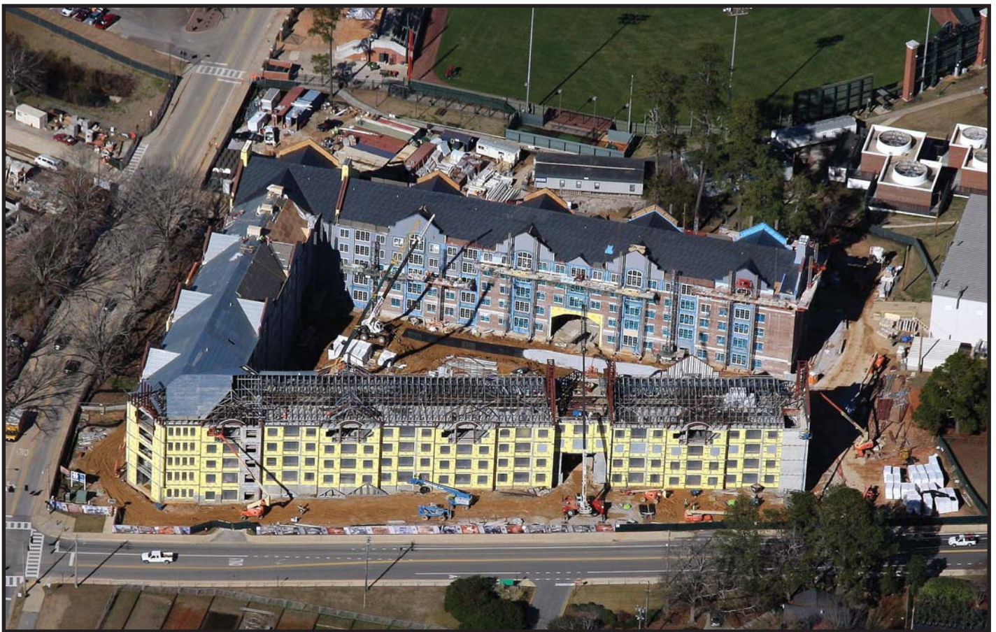
Aerial view from south

Project Status: The project is 50 percent complete. The exterior brick and window installation is ongoing. Interior framing, drywall, mechanical, electrical, and plumbing systems installations are underway throughout the facility. The project is within budget and scheduled to be ready for fall semester 2013.