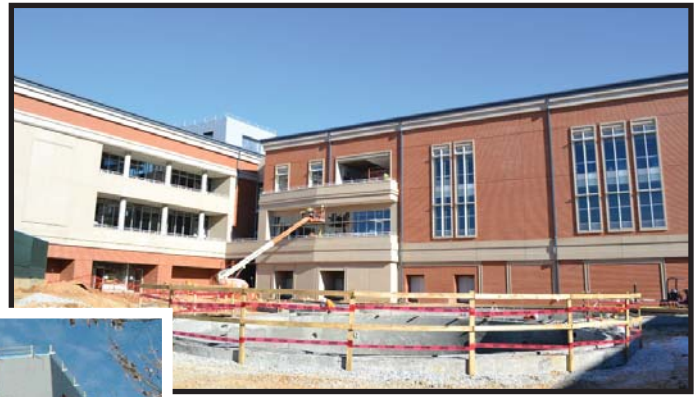
Outdoor pool on southeast side of building