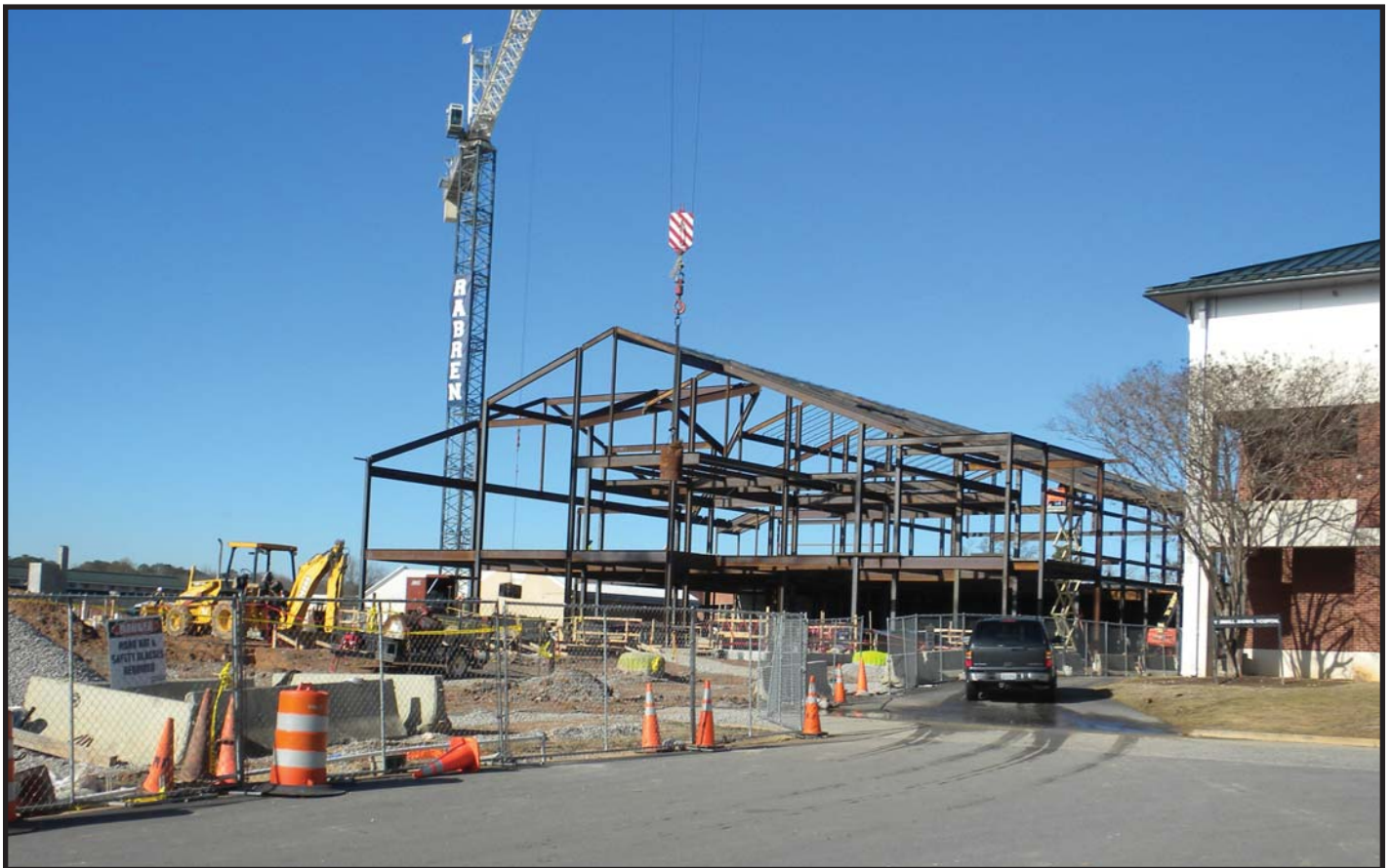
View from east

Project Status: The project is currently 30 percent complete. Interior masonry walls for the underground terrace level are complete and overhead air ducts and piping are being installed. Erection of the structural steel frame is underway with the structure being complete on the east half of the building. Exterior wall installation and roof construction have begun on the east side. The project is on schedule for the main hospital building to be complete in February 2014. The project is on schedule and within budget.