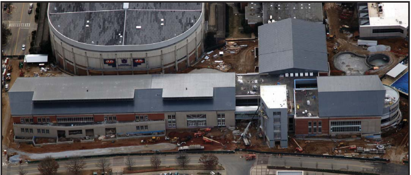
Aerial view of north elevation