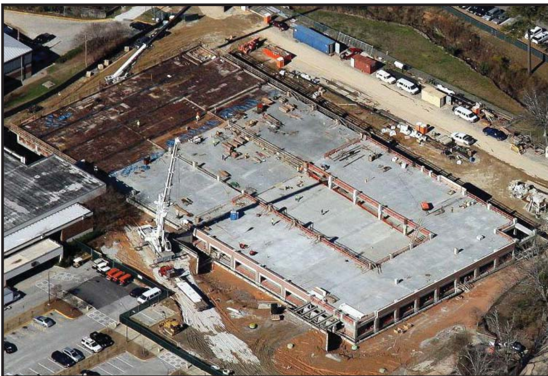
Aerial view looking north