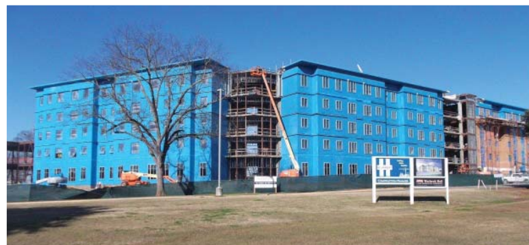
East elevation Back to top