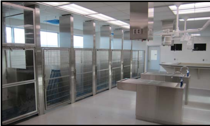
Intermediate care room

Project Status: The project is 95 percent complete and is within budget. Occupants are expected to move into the new hospital in mid-February. Sidewalks, paving, and landscaping are progressing. Inside the facility, final testing, cleaning, and punch list work are underway. The third and final phase of the project will commence after occupants have moved into the hospital. The third phase includes the connection of the hospital to the existing Hoerlein Hall and to the Overton-Rudd Education Building. An outdoor dog park will also be constructed. This phase is expected to be complete in September 2014.