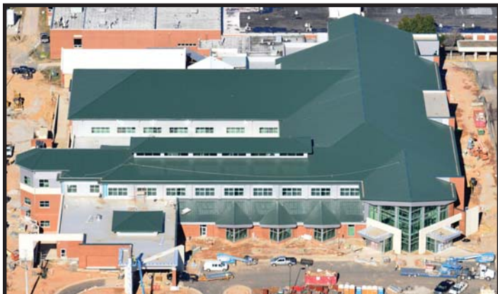
Aerial view of Small Animal Teaching Hospital - Phase II