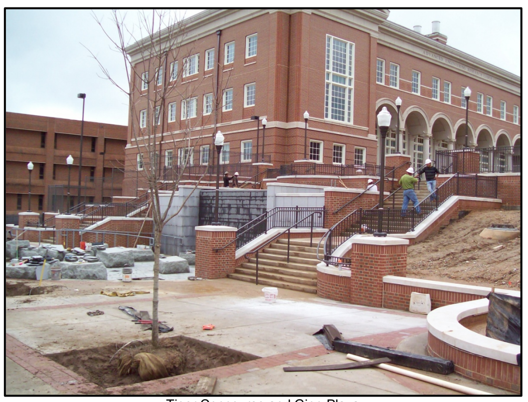
Tiger Concourse and Ginn Plaza Transition Walkway between College of Engineering and Tiger Concourse