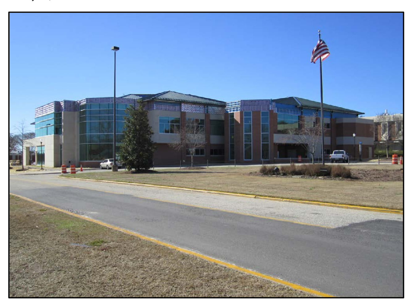
Small Animal Teaching Hospital Overton-Rudd Classroom Addition, Fascia Installation Nearing Completion

Phase II of the Small Animal Teaching Hospital project is out for bid with a bid opening scheduled for February 16, 2012.