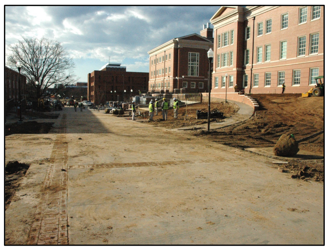
Tiger Concourse and Ginn Plaza View Looking South