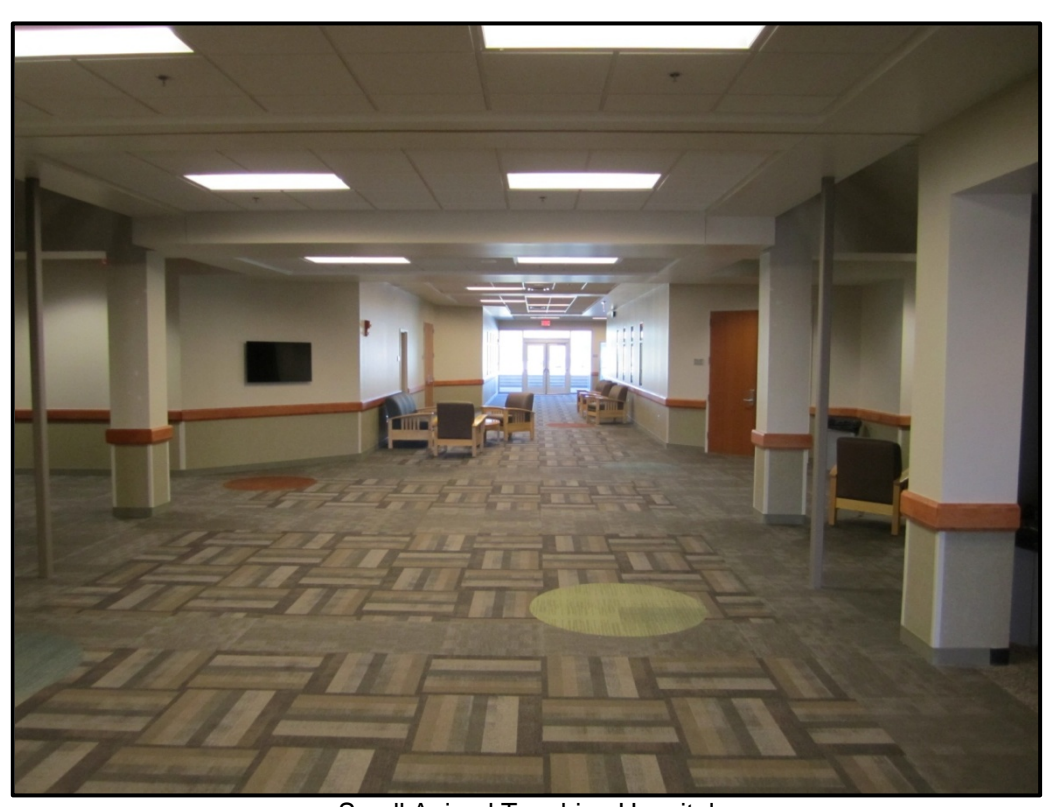
Small Animal Teaching Hospital Overton-Rudd Classroom Addition, First Floor Common Area