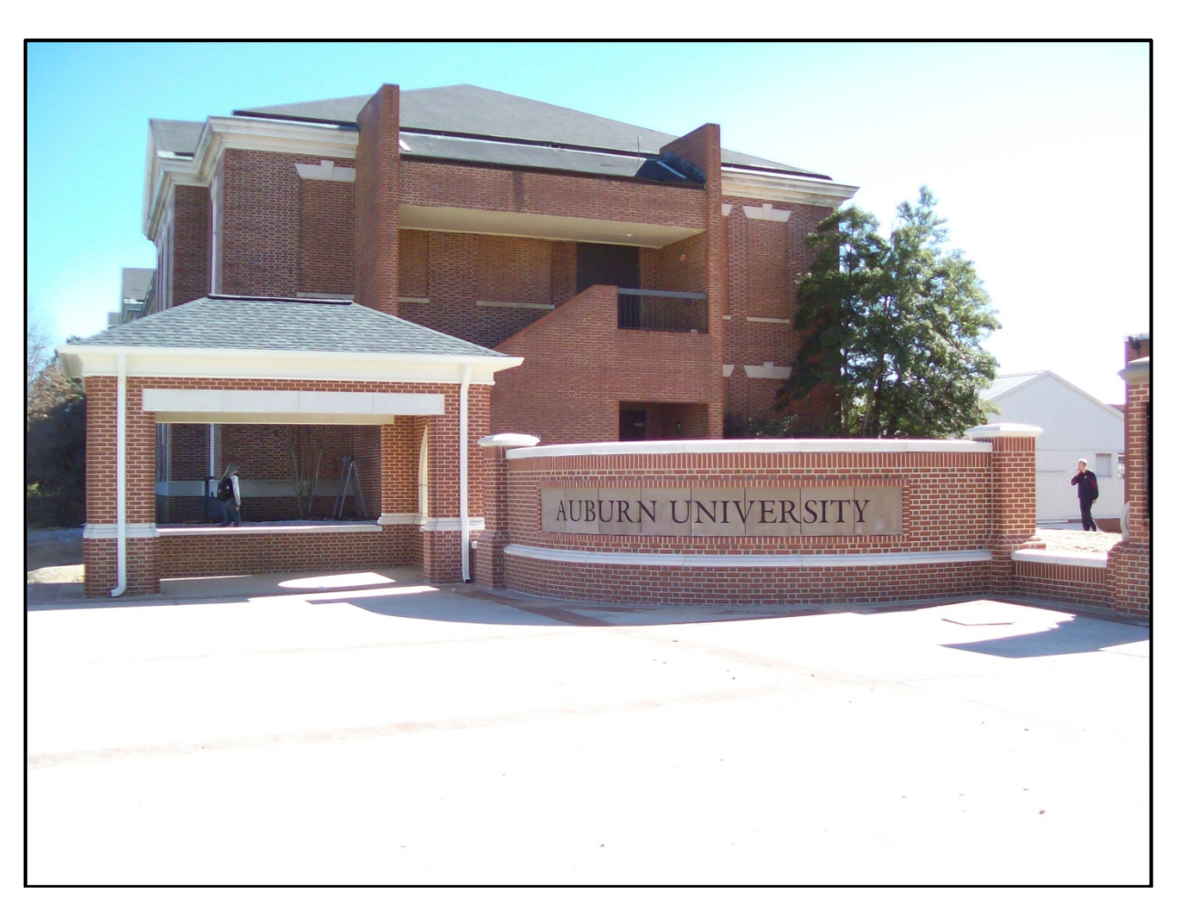
Tiger Concourse, Carroll Commons, and Ginn Plaza Project Magnolia Street Transit Bus Stop, East View

Construction Cost: $1.9 million. Project completion has been delayed due to inclement weather but is still within budget. The project is currently 97 percent complete and has a substantial completion date of February 2012. The Carroll Commons/Broun Hall parking lot was completed early for pedestrian use in August 2011. The southern portion of the Tiger Concourse was completed for pedestrian use in October 2011. The final phase of the project is the pedestrian walkway from Broun Hall north to Magnolia Avenue. The transit stop and bus drop-off area on Magnolia Avenue is nearing completion, as is the stone work for the Ginn Plaza fountain.