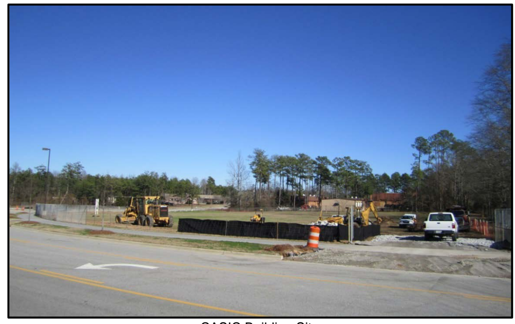
CASIC Building Site Northeast View--Project Fencing Installed