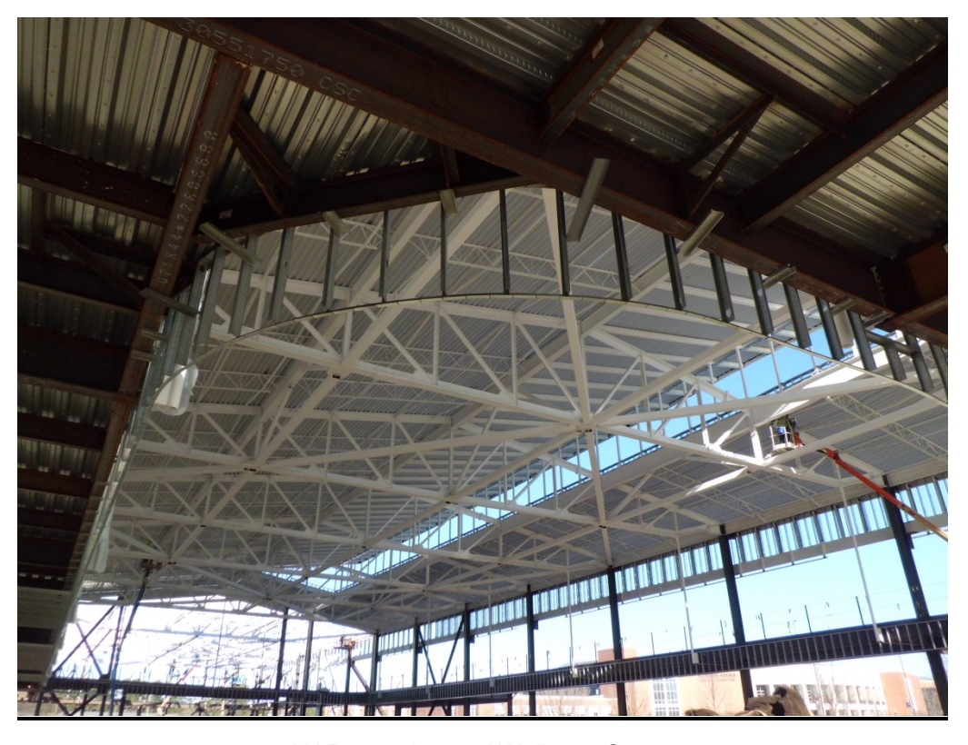
AU Recreation and Wellness Center Roof Deck in Basketball Court Area