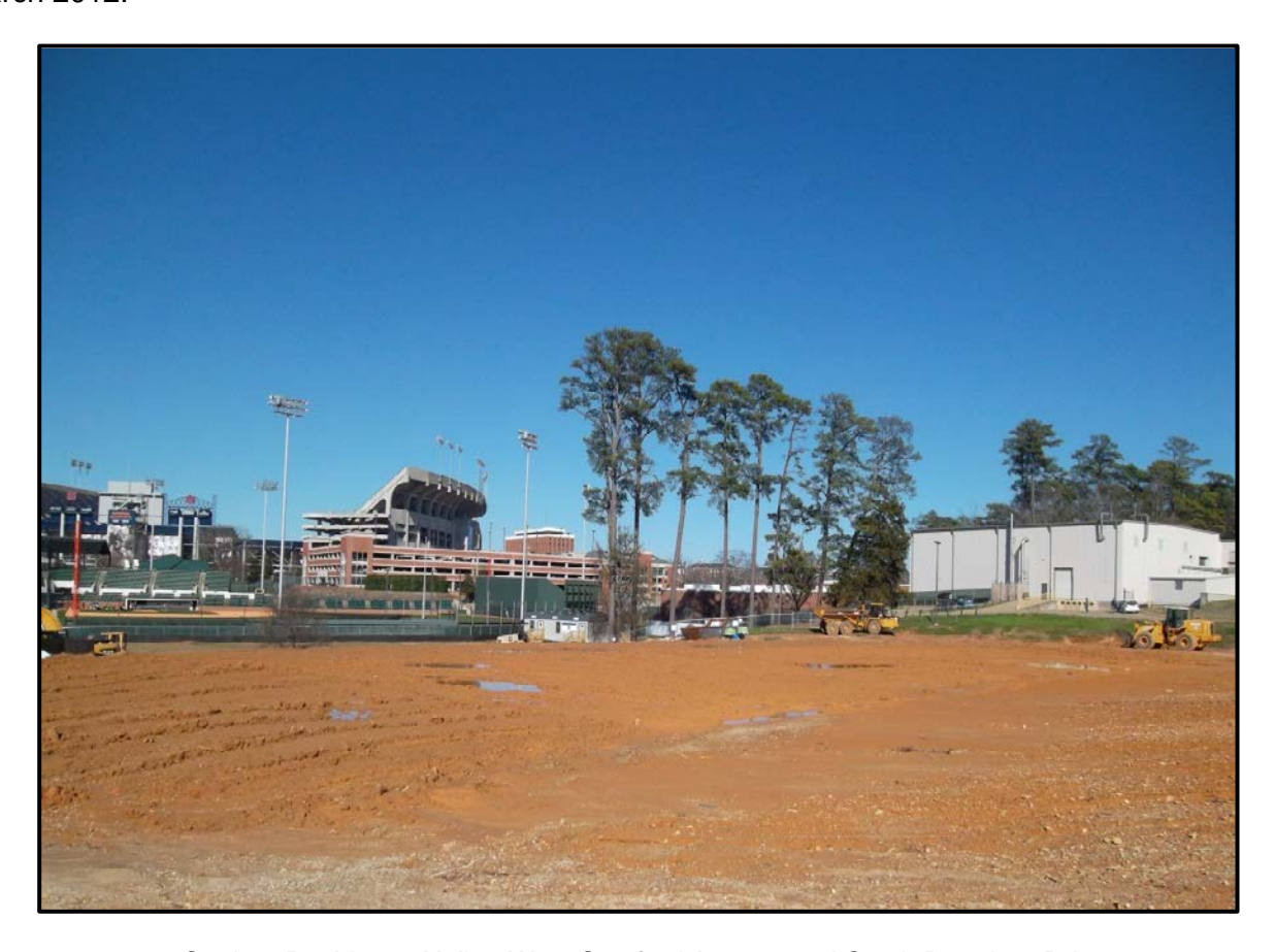
Student Residence Hall at West Samford Avenue and South Donahue Drive Project Site with Sewell Hall Demolition Complete

Construction Cost: $51.0 Million. The project is on schedule and within budget. The overall project is seven percent complete and is scheduled for substantial completion in June 2013. Demolition of Sewell Hall is complete. Site work and foundation project packages have been successfully bid. Site grading is 40 percent finished. Foundation construction is scheduled to begin the last week of February 2012. The remainder of the project design is 90 percent complete and is scheduled to bid in March 2012.