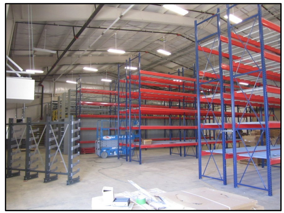
Building 6 Shop Material Warehouse Interior Storage Space