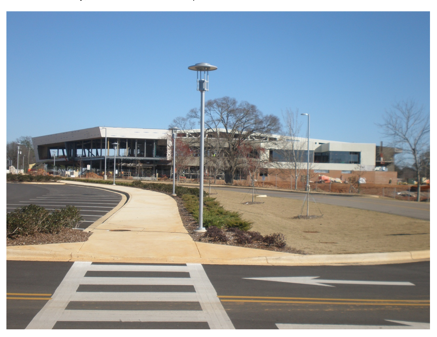
Auburn University Montgomery Wellness Center North View

Construction Cost: $16.1 million. The project is on schedule and within budget. The project is currently 75 percent complete and has a substantial completion date of June 2012. The exterior wall framing, sheathing, roofing, and masonry are complete. Installation of stucco and curtain wall system is well underway. Interior framing is 98 percent complete, as are mechanical, electrical, and plumbing rough-ins. Drywall hanging/finishing is ongoing. The Intramural fields have been graded and field house masonry, columns and roof are complete.