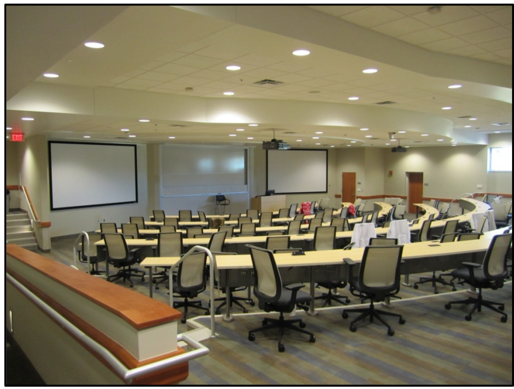
Small Animal Teaching Hospital Overton-Rudd Classroom Addition, Lecture Hall