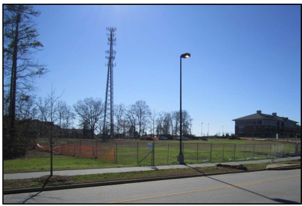
CASIC Building Site West View

Construction Cost: $19.6 million. This project is an 82,200 square foot, three-story laboratory and research building for the College of Agriculture. This project is located in the Auburn Research Park. Construction site work has started with the installation of project fencing, site entrances, and erosion control measures. Substantial completion of this project is scheduled for July 2013.