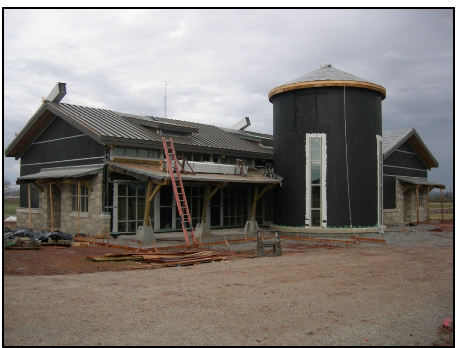
Tennessee Valley Research & Extension Center Northwest View

Construction Cost: $1.0 million. The project is on schedule and within budget. The project is currently 90 percent complete and has a substantial completion date of March 2012. Exterior stone work is complete, and the installation of the metal wall panels and roof is underway. Interior concrete staining is complete.