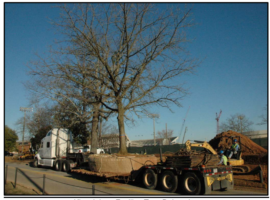
Kinesiology Facility-Tree Relocation