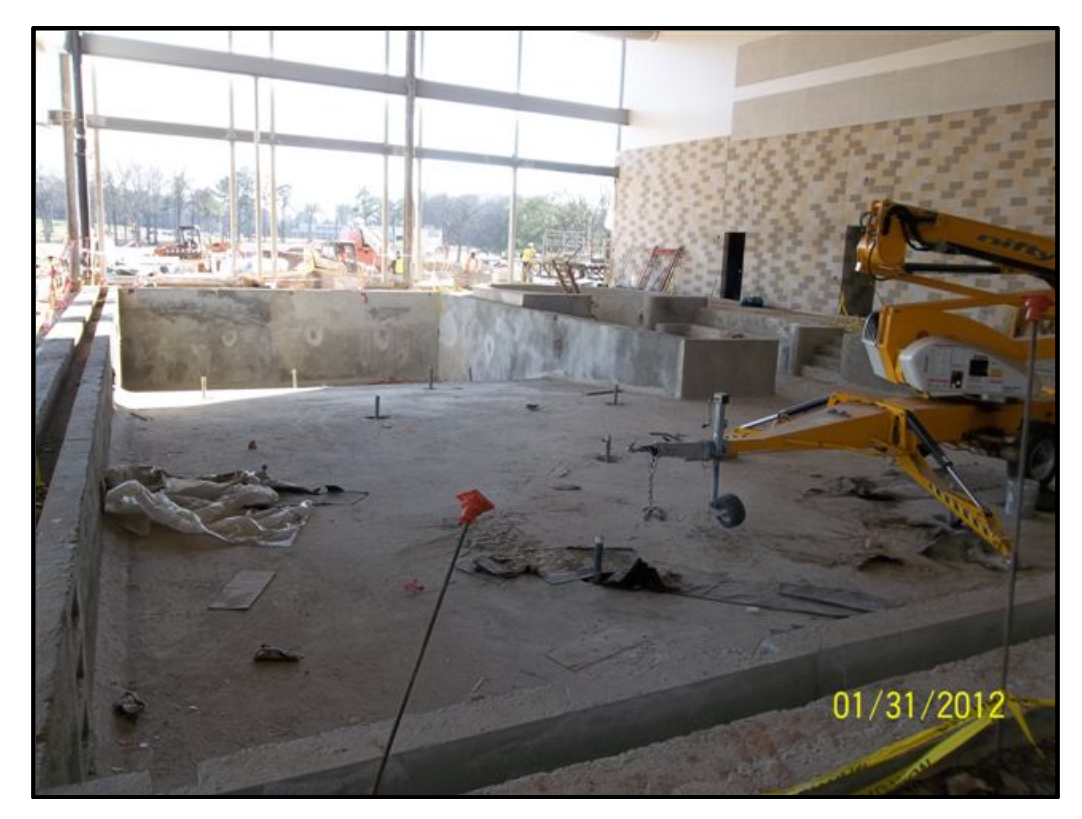
AUM Wellness Center Swimming Pool