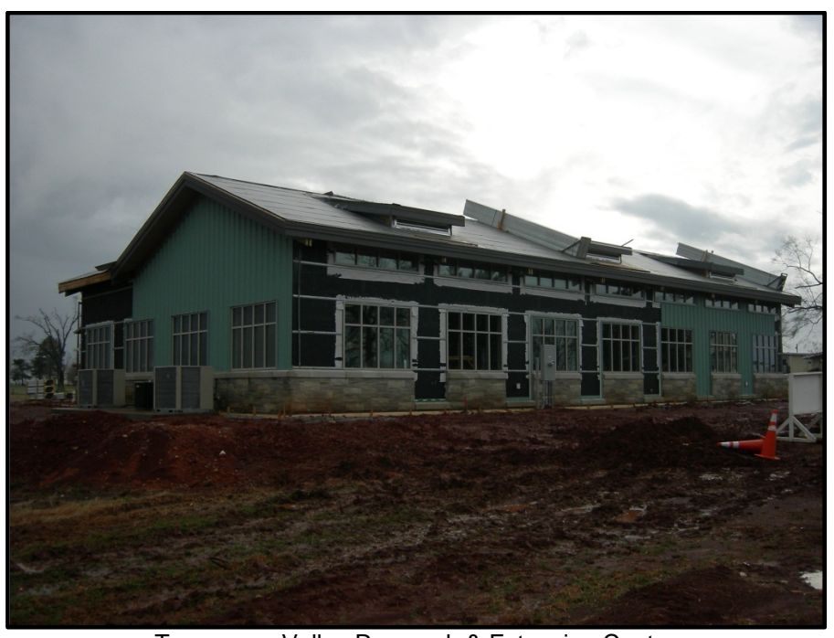
Tennessee Valley Research & Extension Center Southeast View