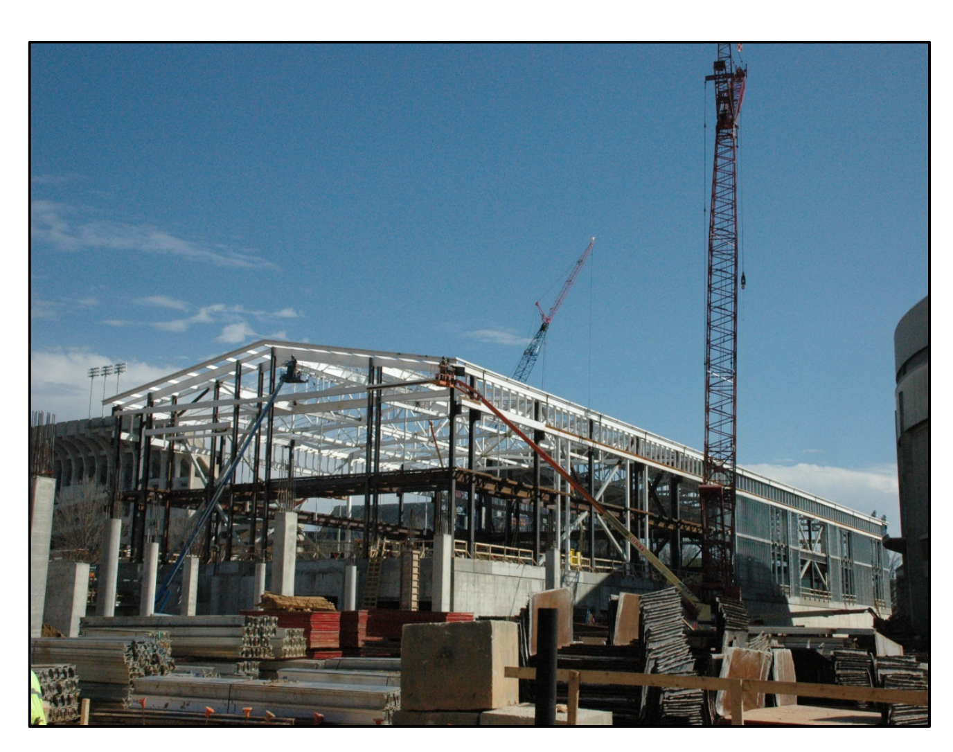
AU Recreation and Wellness Center Structural Steel, Elevated Slab, Foundation Walls, and Columns – Basketball Court Area

Construction Cost: $53.0 million. The project is on schedule and within budget. The project is 31 percent complete and has a substantial completion date of May 2013. In the health and wellness area, the drilled foundation piers are complete, as are all underground water and sewer lines for the facility. Roof decking and structural steel erection is complete in the basketball court section of the building, and steel stud wall framing is progressing well. The concrete pours for the elevated exercise track have begun. The closure of Heisman Drive during Christmas break was successful in that all sanitary, storm, and electrical connections were made at once, diminishing its impact to campus. The road was reopened prior to the first day of classes on January 9, 2012.