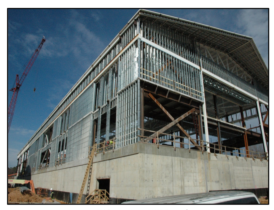
AU Recreation and Wellness Center Basketball Court Area Steel Framing