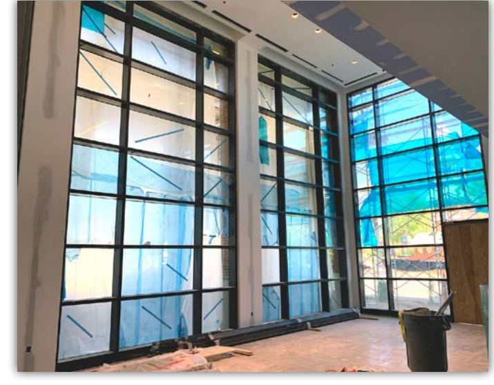
Window installation and ceilings are complete in the 1856 Restaurant.