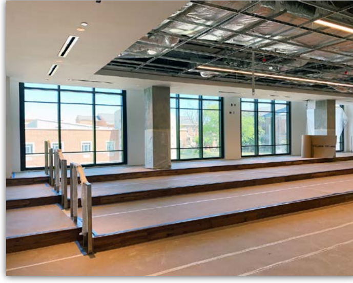
This second floor classroom is ready for ceiling tiles and furniture.