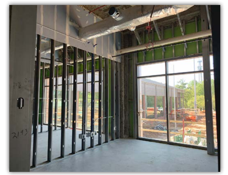
Metal wall frames have been erected in the office areas on the second floor.