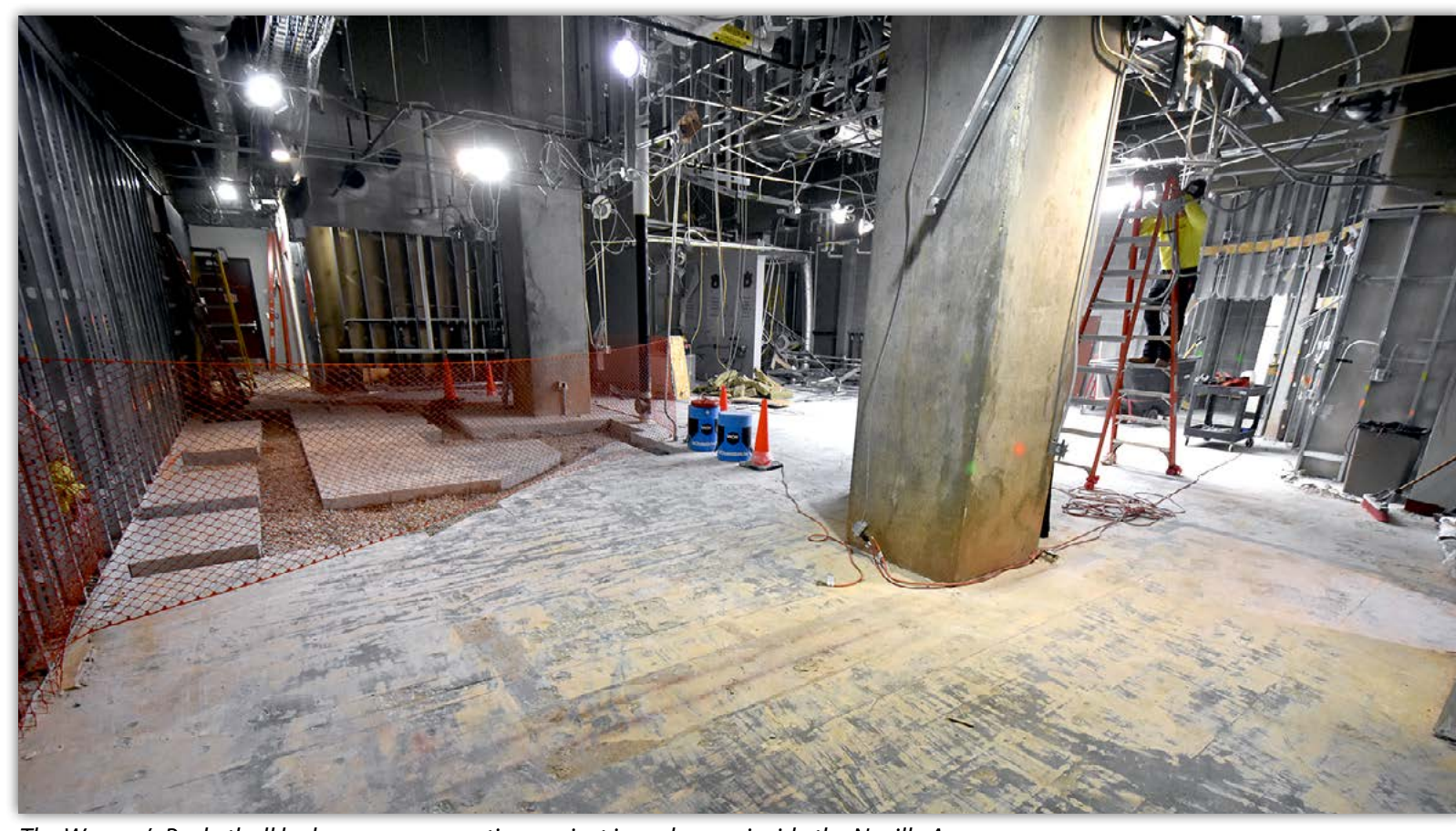
The Women's Basketball locker room renovation project is underway inside the Neville Arena.

The Women's Basketball Locker Room Renovation project will remodel approximately 4,000 square feet of the existing team space inside Neville Arena.