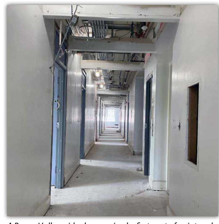
A Broun Hall corridor has received a first coat of paint and is ready for ceiling tiles to be installed.