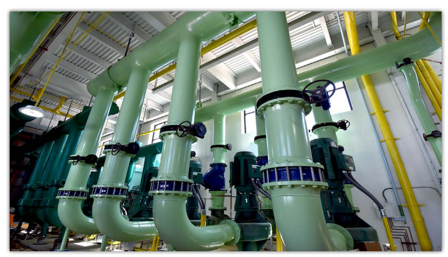
Installation of chilled water system piping, which will distribute chilled water to facilities across campus, is complete.