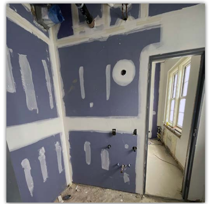
Bathrooms are ready for wall tile and flooring installation to begin.