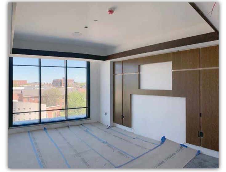
Installation of wood finishes are underway in the hotel guestrooms.

its Culinary Science, Event Management, and Hotel and Restaurant Management academic options. The project combines academic instructional and laboratory space, as well as operational food venues and hotel spaces in which students will train.