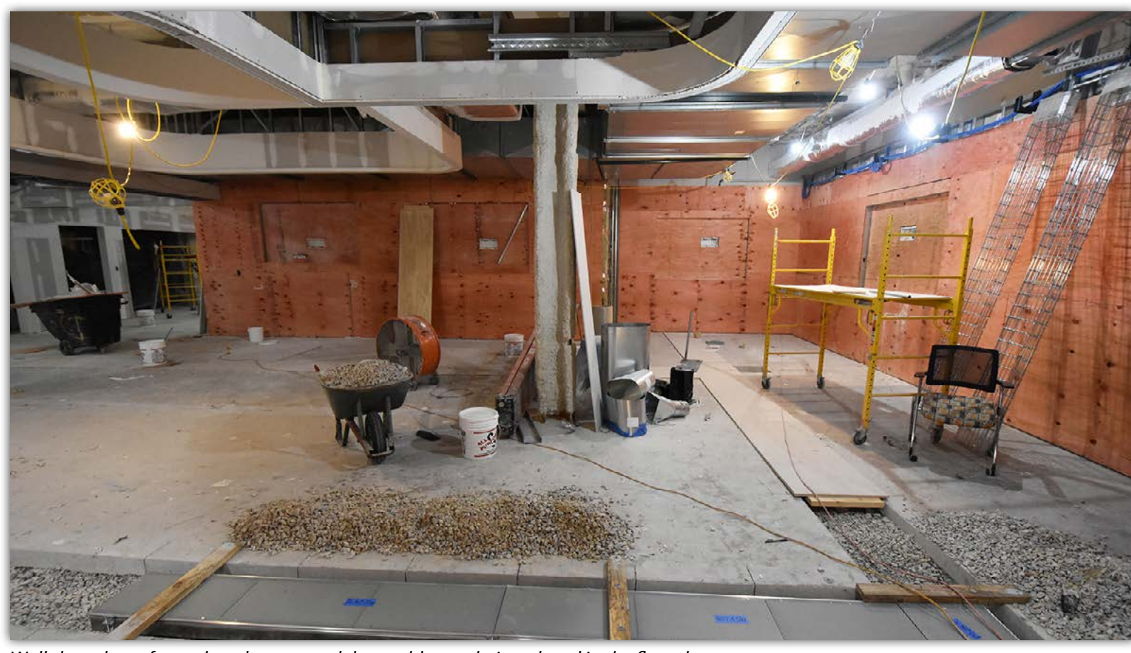
Walls have been framed, and power and data cables are being placed in the floor ducts.

The Lowder Hall Financial Leadership Collaborative Laboratory Renovation project will renovate approximately 4,000 square feet of existing interior space in Lowder Hall. The renovation will create two state-of-the-art laboratories of up to