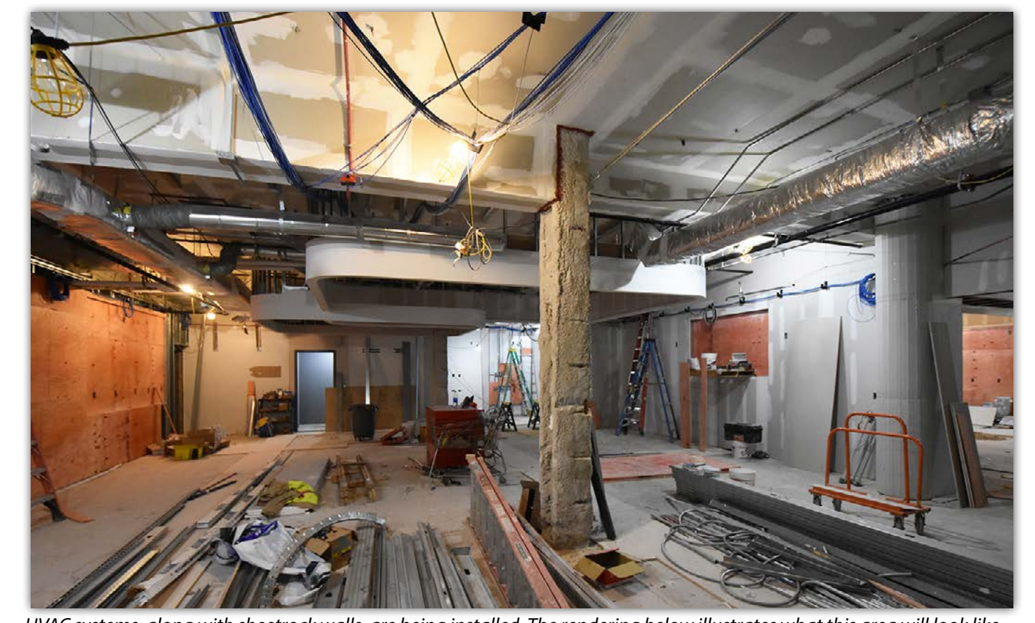
HVAC systems, along with sheetrock walls, are being installed. The rendering below illustrates what this area will look like once the project is complete.