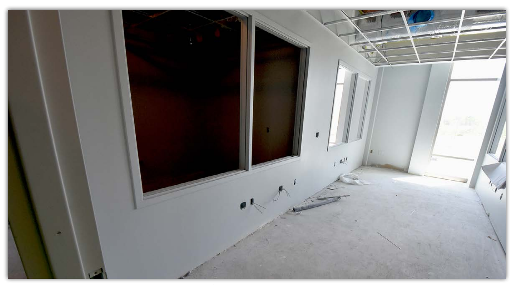
Windows will soon be installed in the observation room for the Marriage and Family Therapy Center in the Research Park.

This program includes several projects, one of which will renovate the existing Dawson Building to relocate the Early Learning Center. Also included is the renovation of the second floor of Research Park Building 1 to house the Marriage and Family Therapy Center and the Center for Health Ecology