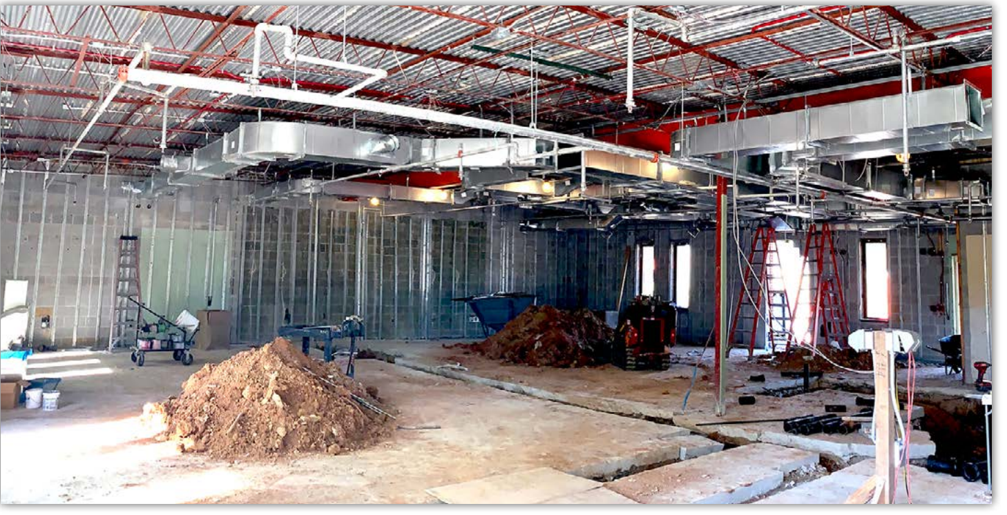
Installation of overhead mechanical, electrical and fire protection systems is underway inside the Dawson Building.