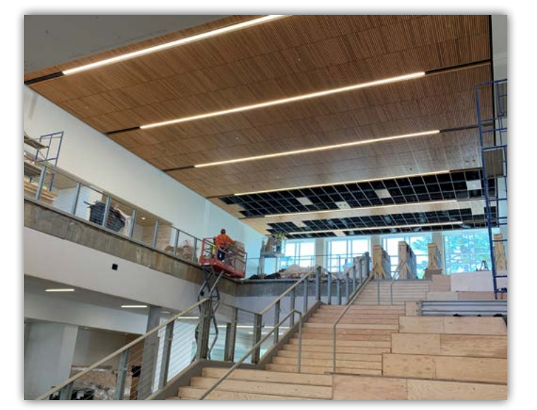
Decorative wood ceilings are being installed throughout the main two story lobby.