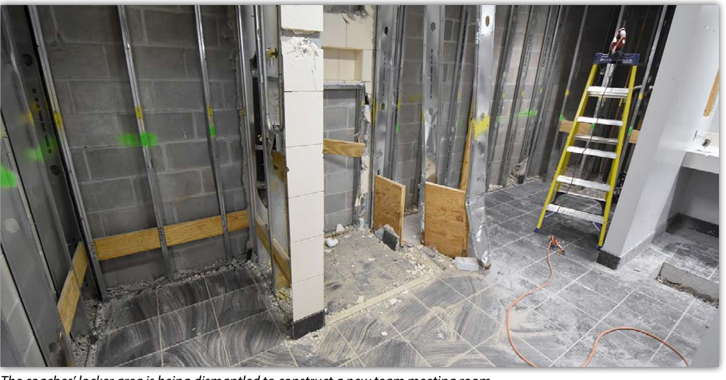
The coaches' locker area is being dismantled to construct a new team meeting room.