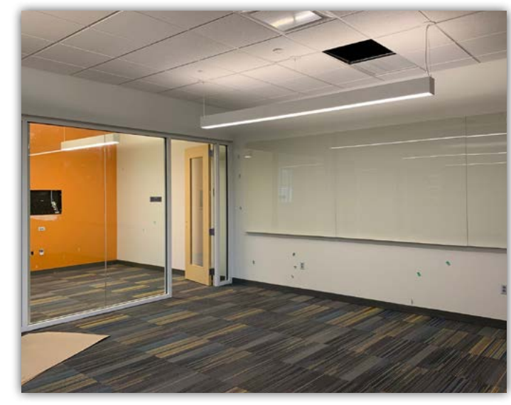
A student meeting and study space located on the first floor is being readied for final inspection.