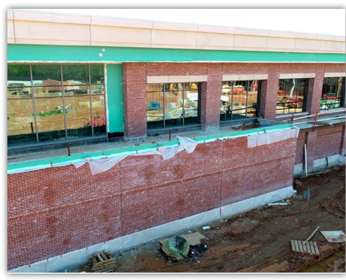
Window and brick installation continues on the operations area of the new facility.