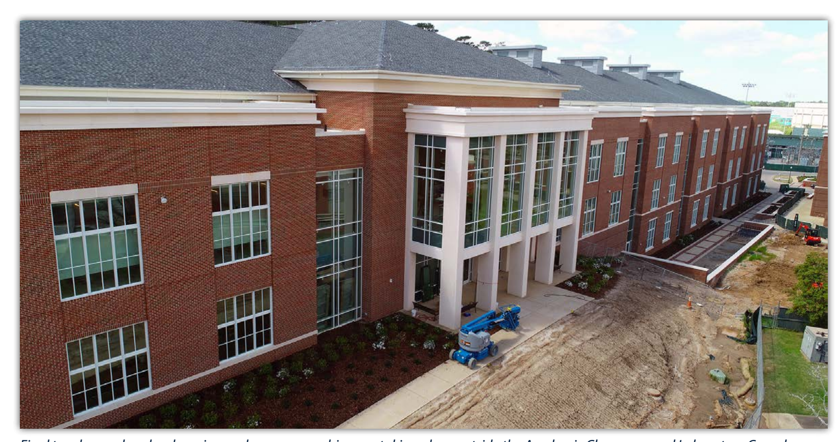
Final touches such as landscaping and pressure washing are taking place outside the Academic Classroom and Laboratory Complex.

The Academic Classroom and Laboratory Complex (ACLC) project will construct a 151,000-square-foot building with a total seating capacity of 2,000 students in 20 adaptable classroom/laboratories, 6 engaged active student learning (EASL) classrooms and 5 lecture halls.