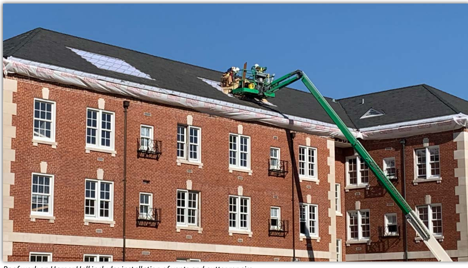
Roof work on Harper Hall includes installation of vents and gutter repairs.

Phase one of five planned phases will renovate approximately 51,510 square feet of existing interior space located in Harper and Broun halls. Program requirements include replacing mechanical, electrical, plumbing and HVAC systems; upgrades