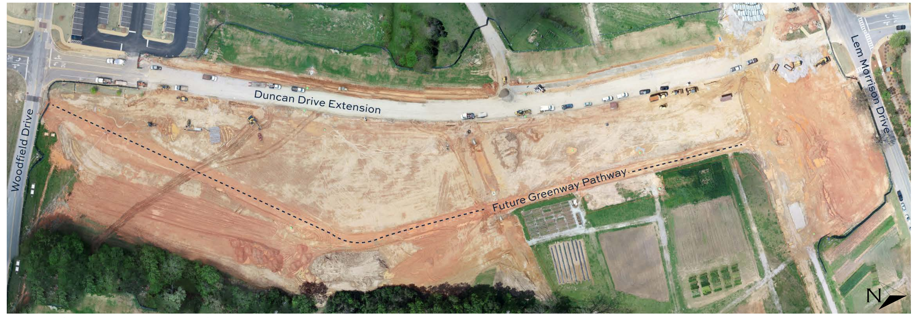
An aerial view of the entire Duncan Drive Extension and Infrastructure project site.