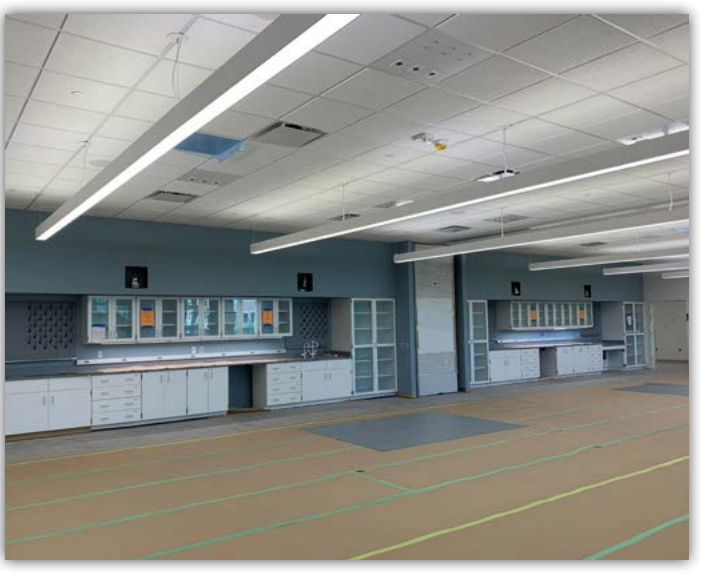
A flexible laboratory space located on the second floor is nearing completion.