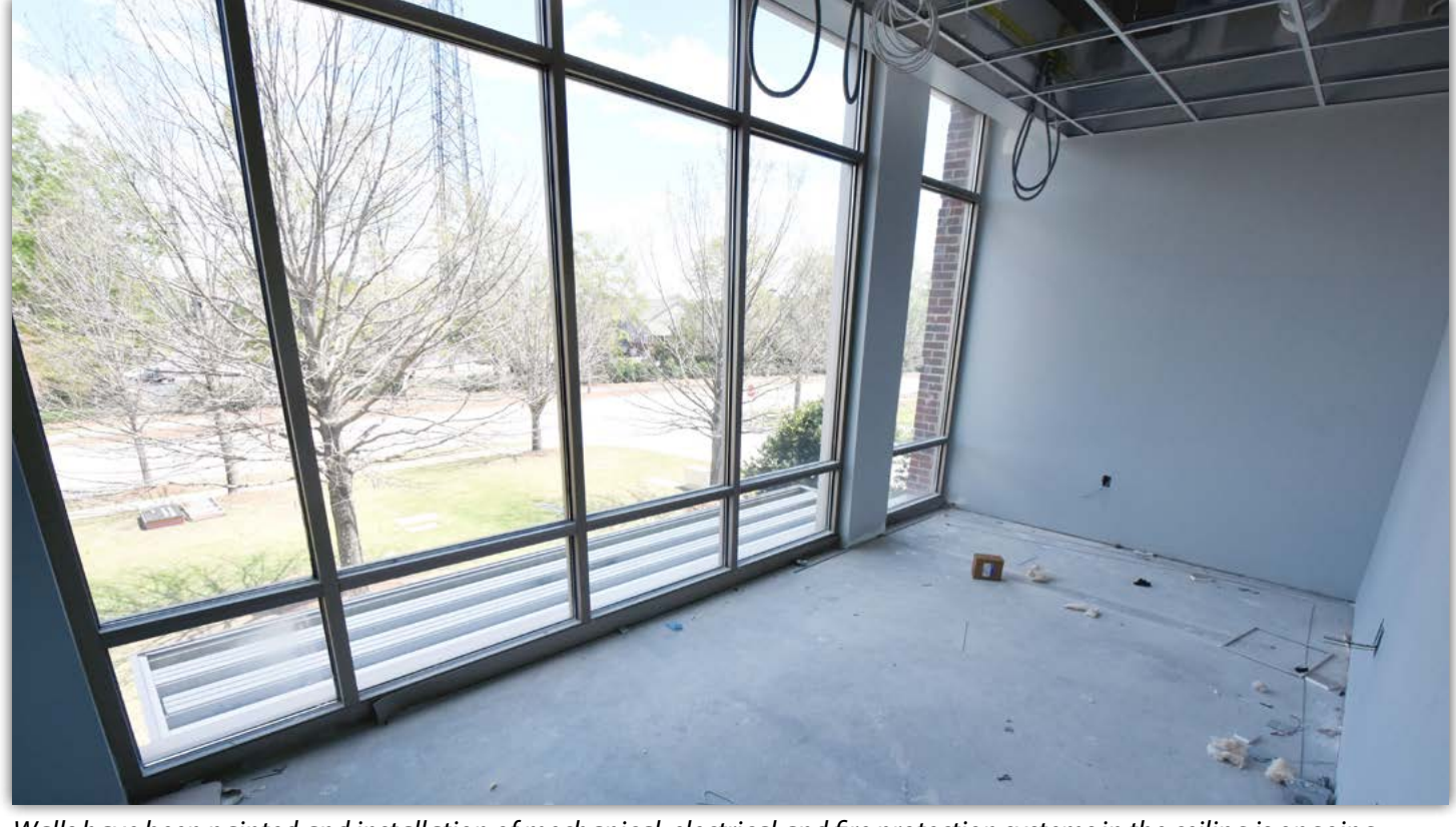
Walls have been painted and installation of mechanical, electrical and fire protection systems in the ceiling is ongoing.