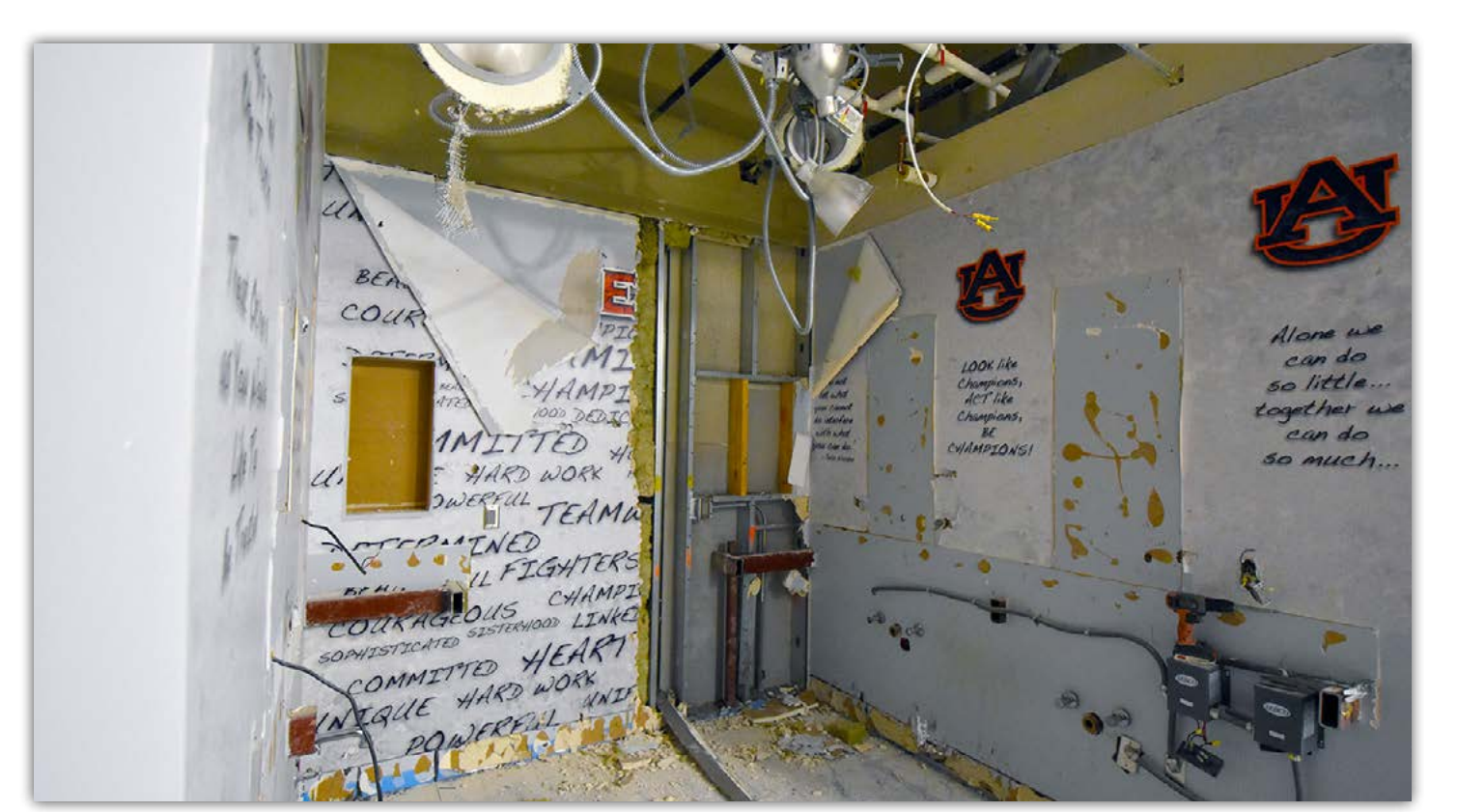
\label{thm:expression} \textit{Existing restroom finishes are being removed to make room for a new team lounge}.