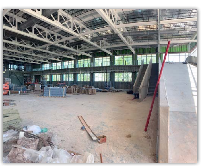
Lighting and fire alarm systems are being installed in the weight training area.