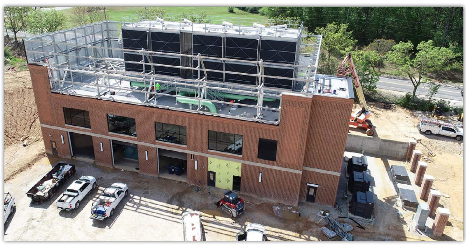
An aerial view of the chilled water plant site shows where windows were recently installed.

The chilled water system expansion project will take place in two phases. The first phase will construct a 7,200-square-foot chilled water plant that will house two 2,500-ton chiller units. The plant will support future anticipated growth on the south side of campus and is planned for completion in the spring of 2022.