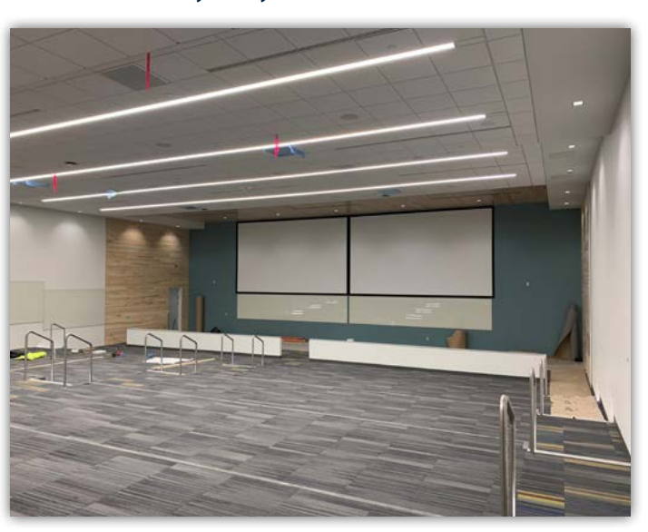
Glass whiteboards, video screens and wood finishes have been installed in the tiered classrooms.