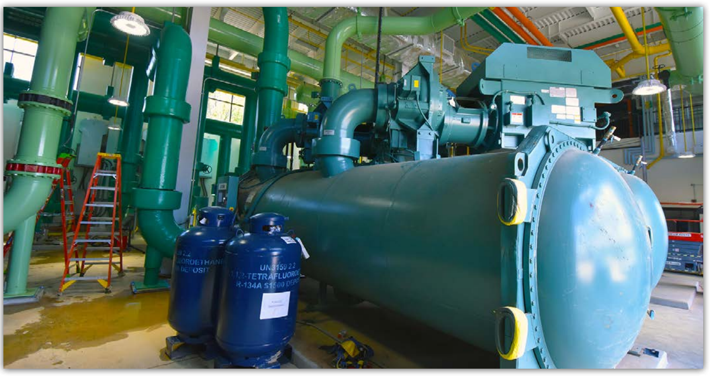
The two 2.500-ton chiller units have been installed.