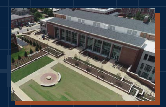
Brown-Kopel Student Achievement Center