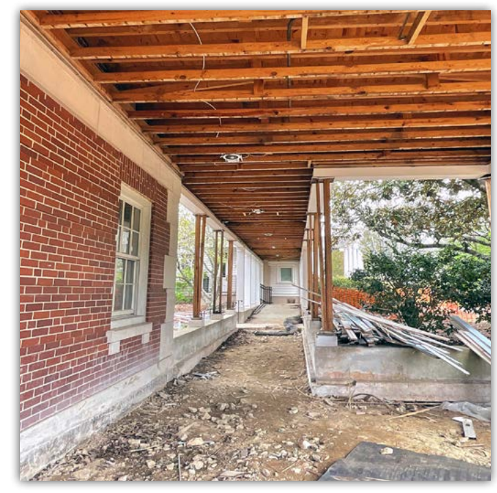
The connector between Harper and Cater Halls is being reconstructed.