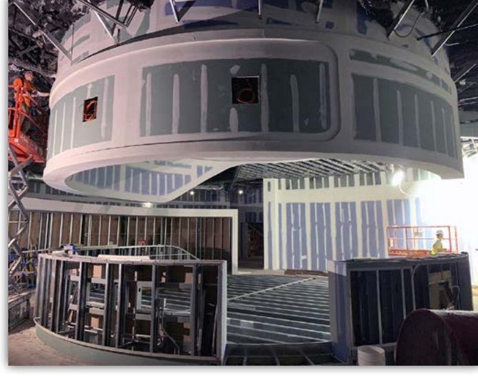
Painting of the walls will soon begin in the Huddle Locker Room.