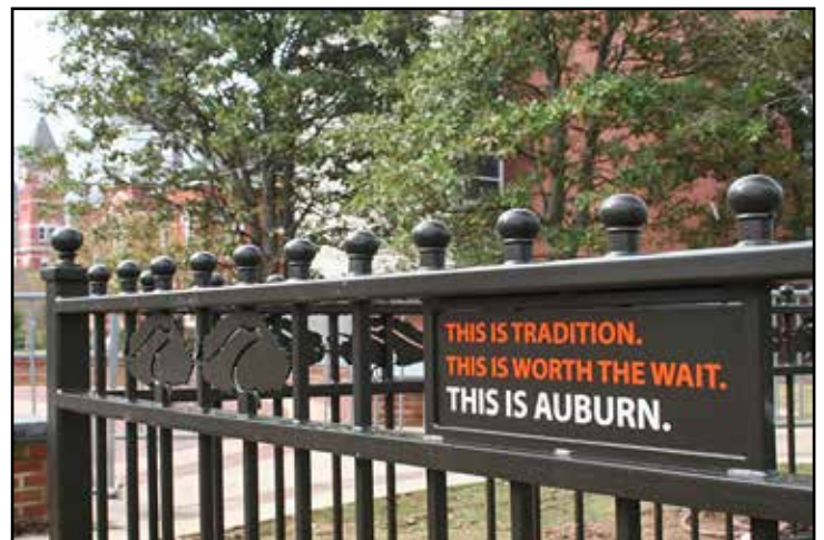
Decorative fence installed at the base of each Auburn Oak tree