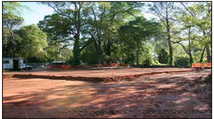
Pad site for new building