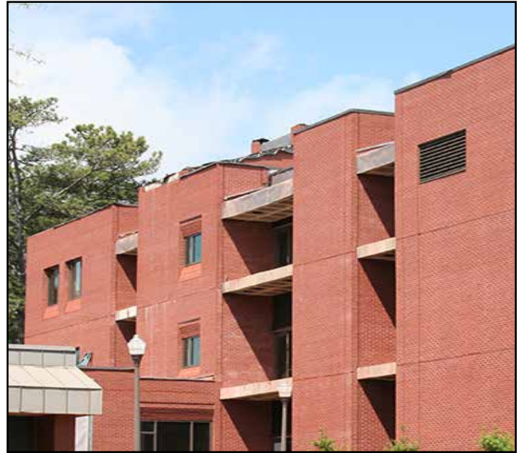
New brick on south elevation between Dudley and Goodwin

Project Status: The project is 60 percent complete. It is within budget and on schedule. Phase I brick replacement is near completion. North elevation window installation is complete, and work has begun on the west elevation.