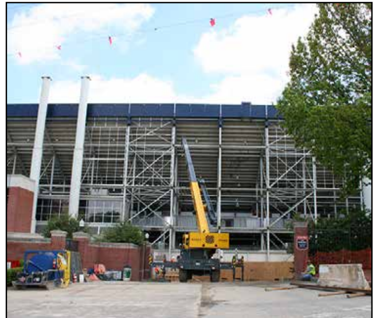
View from Heisman Drive