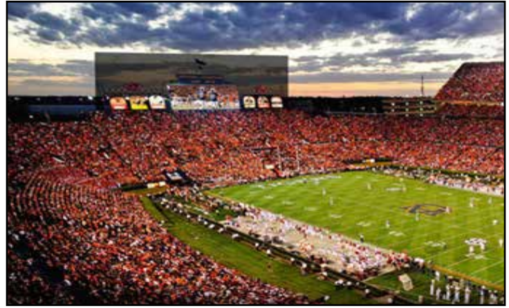
Size comparison for the Jordan-Hare Stadium south endzone scoreboard

Project Status: The project is approximately 15 percent complete, within budget and on schedule. Demolition of the old scoreboard and structural steel is complete. Deep foundations will be completed this week. Structural steel will start prior to A-Day and continue until early July. Construction for this work will be complete prior to the 2015 football season.