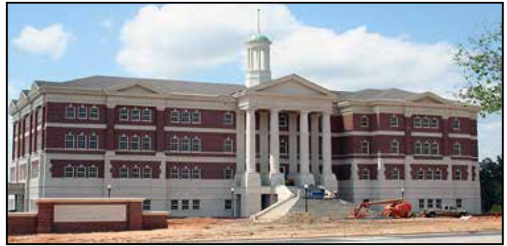
Front elevation view from South Donahue Drive

Project Status: The project is 95 percent complete. Life Safety inspections are underway to obtain the Certificate of Occupancy. Exterior stair railings, irrigation, sidewalks and landscaping are finishing up in the areas closest to the building and along South Donahue Drive.