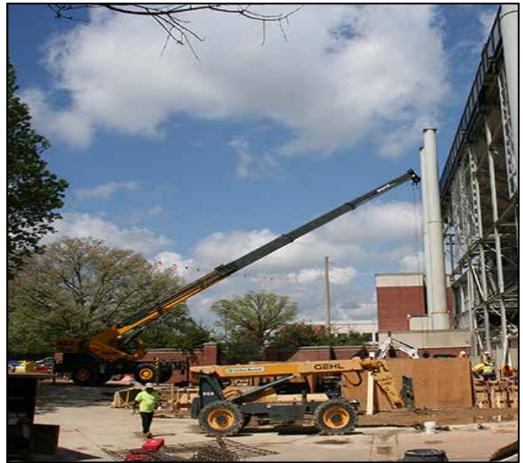
Installation of deep foundations