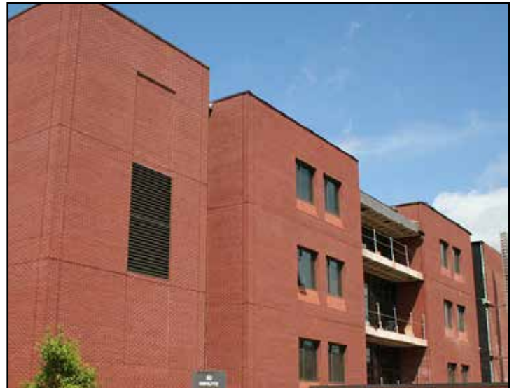
New brick on east side of the building