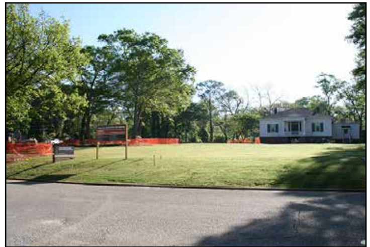
Southwest street view