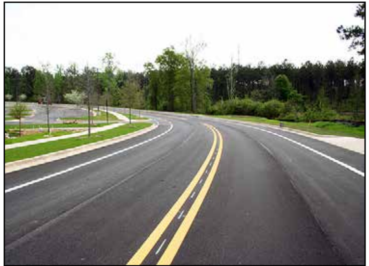
East toward South Donahue Drive