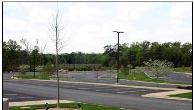
Parking lot located behind the building