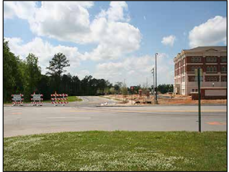
Entrance from South Donahue Drive

Project Status: The project is 96 percent complete and finishing ahead of schedule. Work on the last few pavement markings is near completion. The vegetation has been stabilized and sediment barriers are being removed.