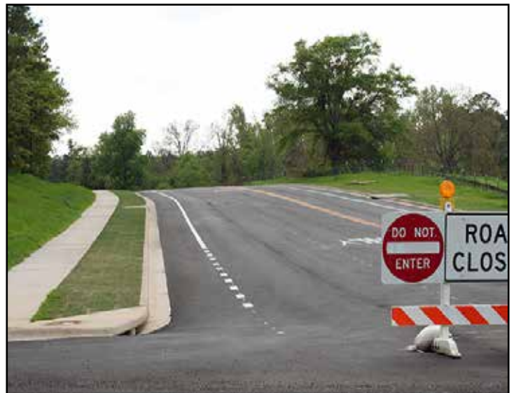
Entrance from Lem Morrison Drive