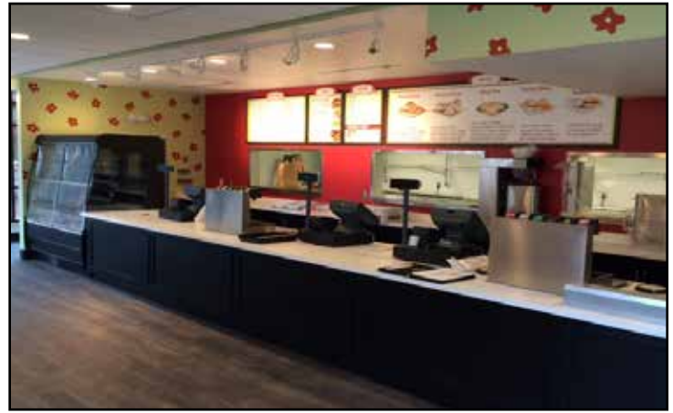
Chicken Salad Chick order stations

Project Status: The project is complete and finished within budget. Chicken Salad Chick opened for business on February 10, 2015.