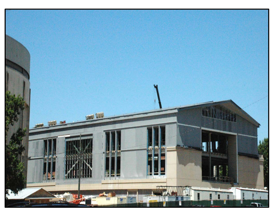
AU Wellness & Recreation Center View Looking Northeast (Precast Panels Being Installed)