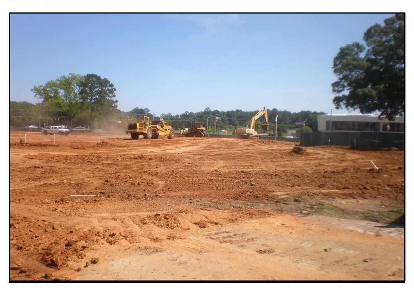
Auburn University Montgomery Residence Hall Site Work Underway

Site work and structural frame contracts are underway. Remaining contract packages will be bid by late April 2012. The project has a completion date of July 2013. Site fencing and relocation of duct bank is complete. Site demo/grading is well underway with foundations starting the end of this month.