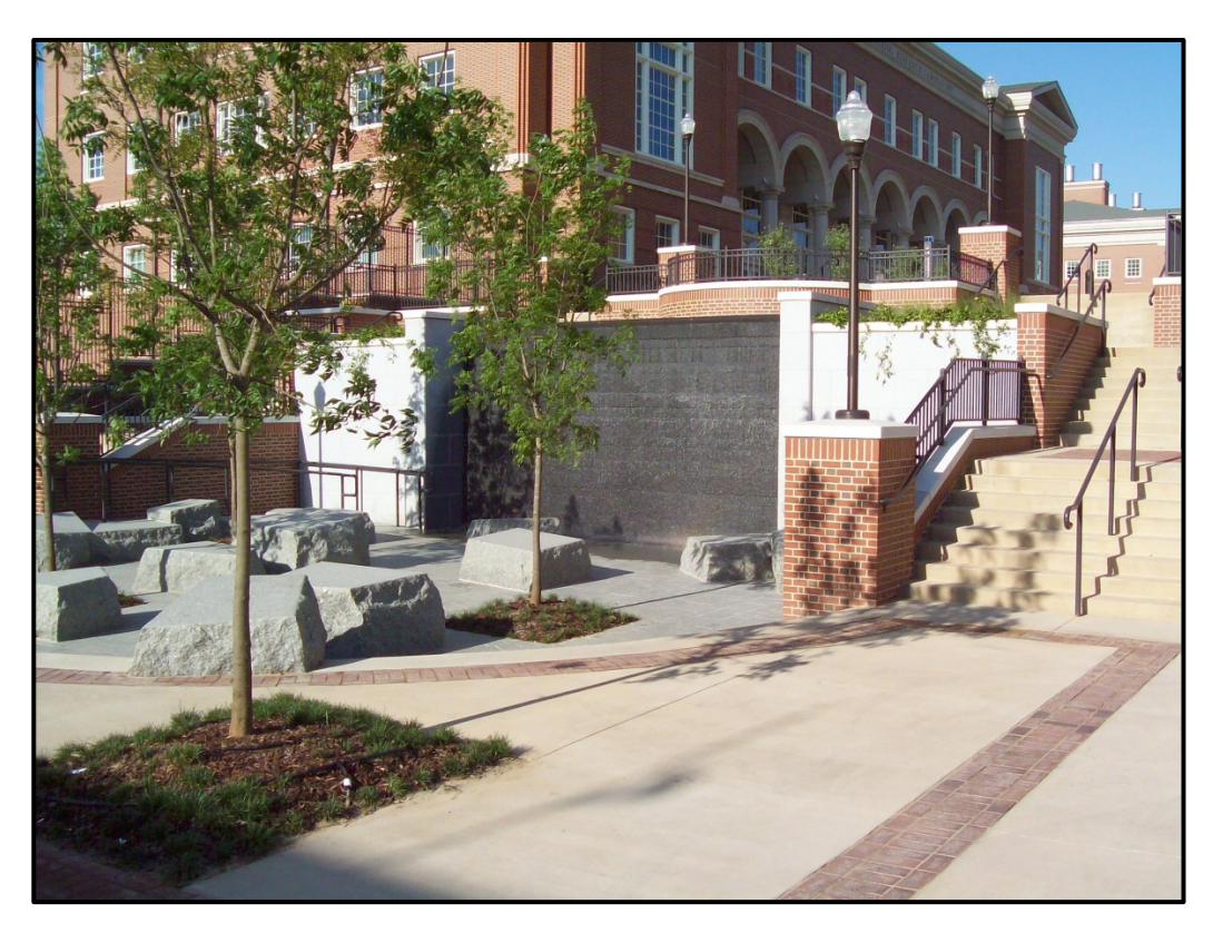
Ginn Plaza - View Looking West