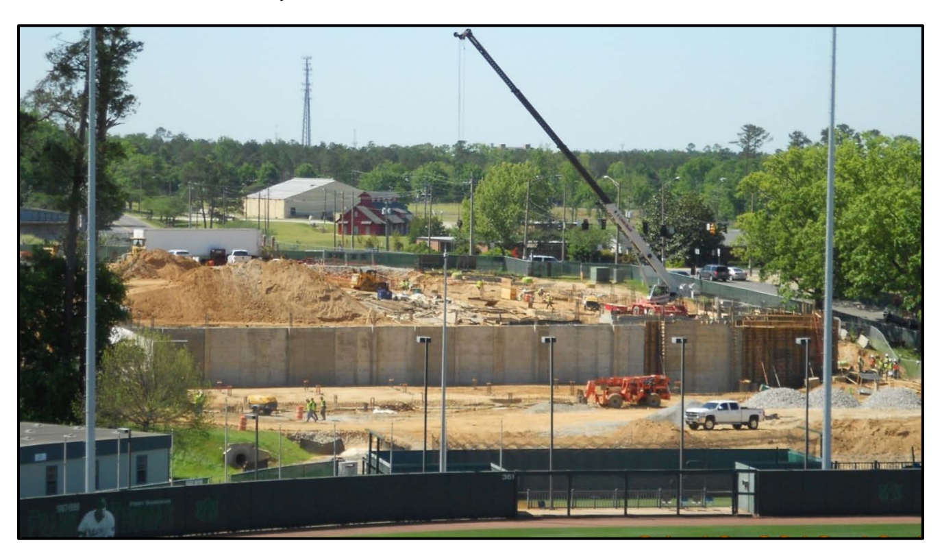
Student Residence Hall at West Samford Avenue and South Donahue Drive View Looking South

Construction Cost: $51.0 million. The project is on schedule, and all contracts have been awarded within budget. The overall project is 5 percent complete and has a completion date of July 2013. Mass grading is complete, and foundations are 38 percent complete. The first elevated slab placement is scheduled for the week of May 8, 2012.