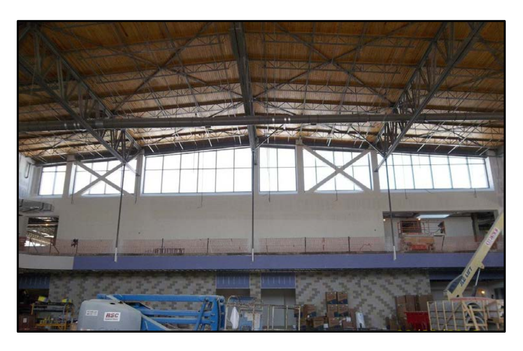
Basketball Court Area and Elevated Running Track