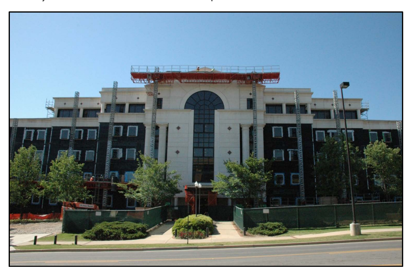
Lowder Hall - North Elevation Repair Work

Construction Cost: $5.6 million. This project involves replacing exterior brick and windows to repair water intrusion problems. The project is currently 15 percent complete and has a completion date of February 2013. Brick demolition is complete on the north elevation, and window installation is underway. Brick installation will commence in late April 2012.