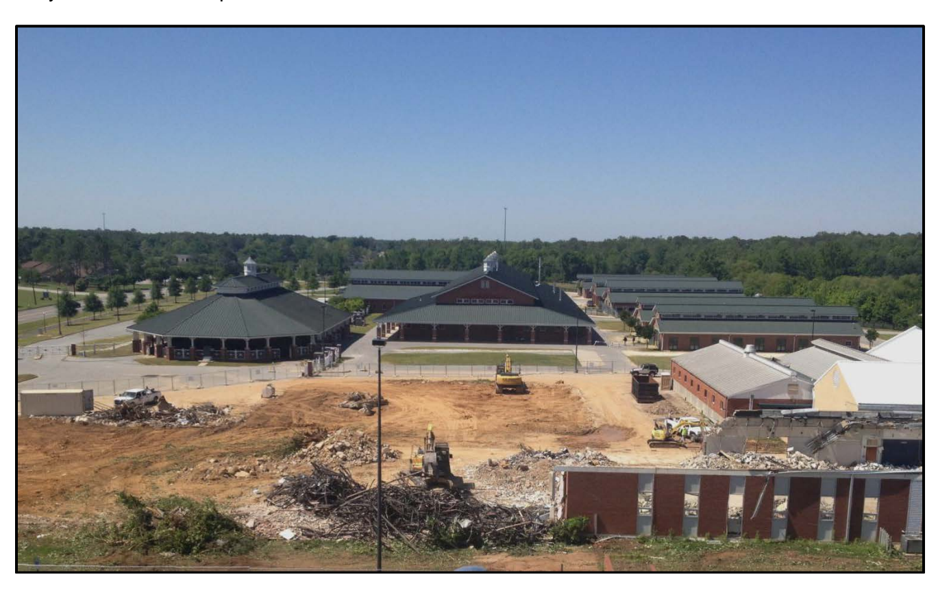
Small Animal Teaching Hospital Phase II Demolition of McAdory Hall, Old Dairy & Beef Barns, and Equine Treatment Barn

Phase 2 started in March 2012 and has a substantial completion date of September 2014. Bidding for the project was completed in April 2012, and the project is within budget. The new Small Animal Teaching Hospital will be located on the site of the old large animal hospital facilities. The beef and equine treatment barns have already been demolished, and the demolition of McAdory Hall and the old dairy barns will be completed this month.