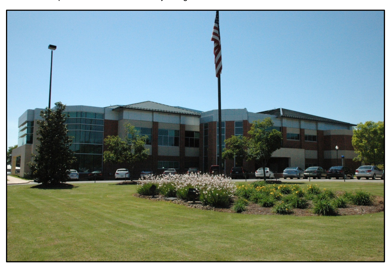
Small Animal Teaching Hospital Phase I Overton-Rudd Classroom Addition

Phase I of the project is 99 percent complete and is within budget. All building areas included in this phase of work have been turned over and are in use by College of Veterinary Medicine. Several exterior finish punch list items are currently being finalized for the Overton-Rudd classroom addition.