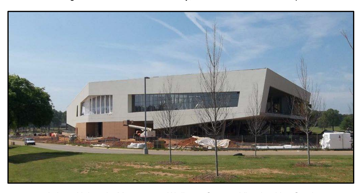
Auburn University Montgomery Wellness Center - View Looking South

Construction cost $16.1 million. The project is on schedule and within budget. This project is currently 85 percent complete and has a completion date of July 2012. Stucco installation is almost complete while curtain wall glazing is well underway. Interior framing is complete and drywall hanging/finishing is 92 percent complete. Perimeter pool tile installation is complete while the reflecting pool shell is to be poured next week. Sidewalks, spa retaining walls and remaining site work are well underway. The intramural fields are to grade and field house masonry, columns and roof are complete.