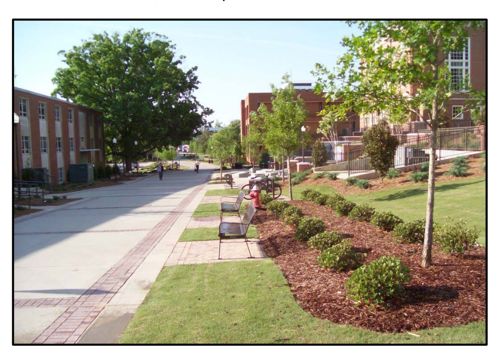
Tiger Concourse and Ginn Plaza - View Looking South

Construction Cost: $1.9 million. The Carroll Commons/Broun Hall parking lot was completed for pedestrian use in August 2011. The final phase of the project, which consisted of the pedestrian walkway from Broun Hall north to Magnolia Avenue, the transit stop and drop-off area on Magnolia Avenue, and the Ginn Plaza Fountain, was completed in March 2012.