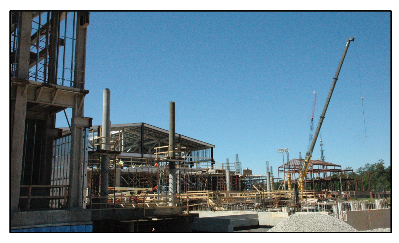
AU Wellness & Recreation Center View Looking Southeast