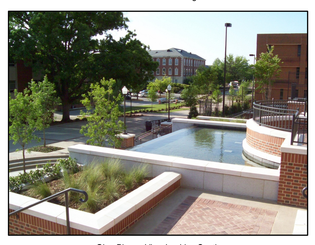
Ginn Plaza - View Looking South