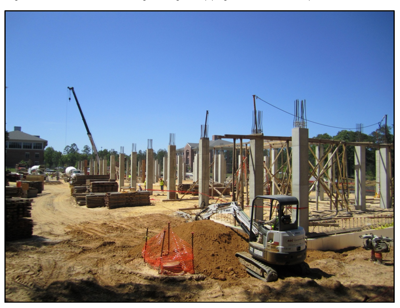
Center for Advanced Science Innovation and Commerce (CASIC) Building View Looking West

Construction Cost: $19.6 million. This project is on schedule and within budget. The project is currently 8 percent complete and has a substantial completion date of July 2013. This project is an 82,200 square foot, three story laboratory and research building, located in the Auburn Research Park. Structural foundations and first floor concrete columns are complete. Second floor slab formwork has begun on the east end of the building. Underground piping for storm water is in place.