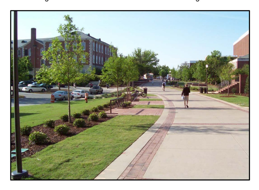
Tiger Concourse and Ginn Plaza - View Looking South