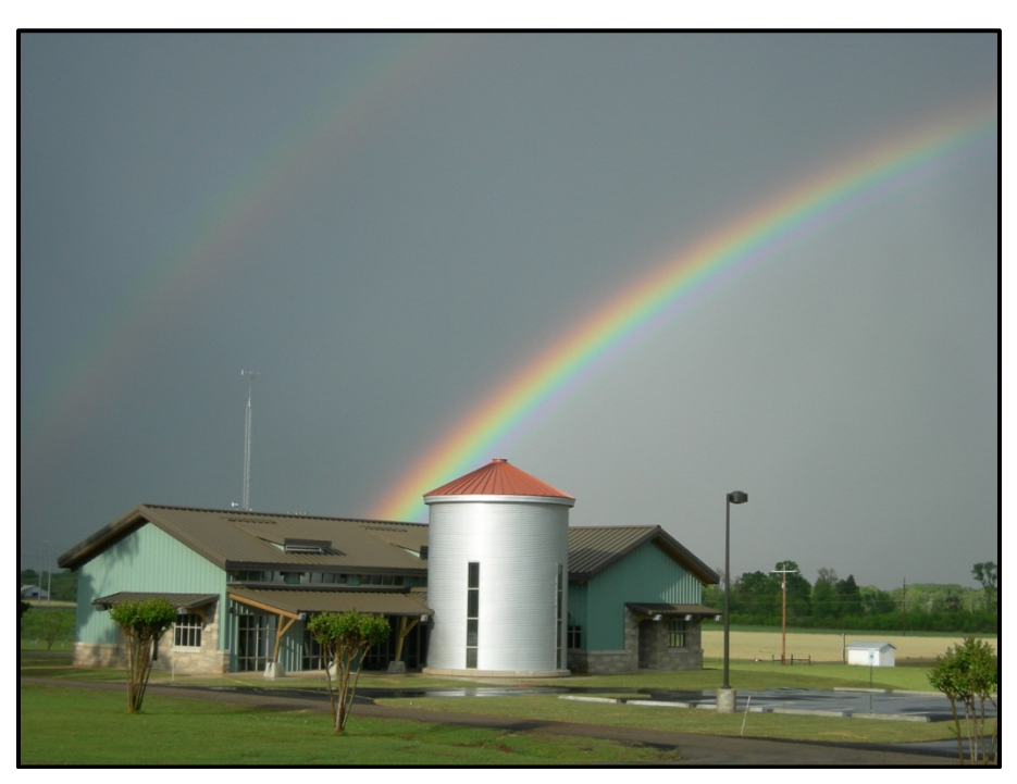
Tennessee Valley Research & Extension Center - View Looking Northeast

Construction Cost: $1.0 million. The project was completed on schedule and within budget. The ribbon cutting ceremony was held April 6, 2012. Furniture has been installed and the occupants are moving into the facility this month.