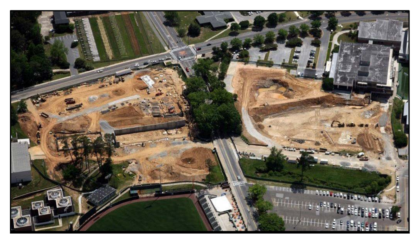
Aerial Photo of Student Residence Hall at West Samford Avenue and South Donahue Drive and Biggio Drive Parking Facility Project Sites