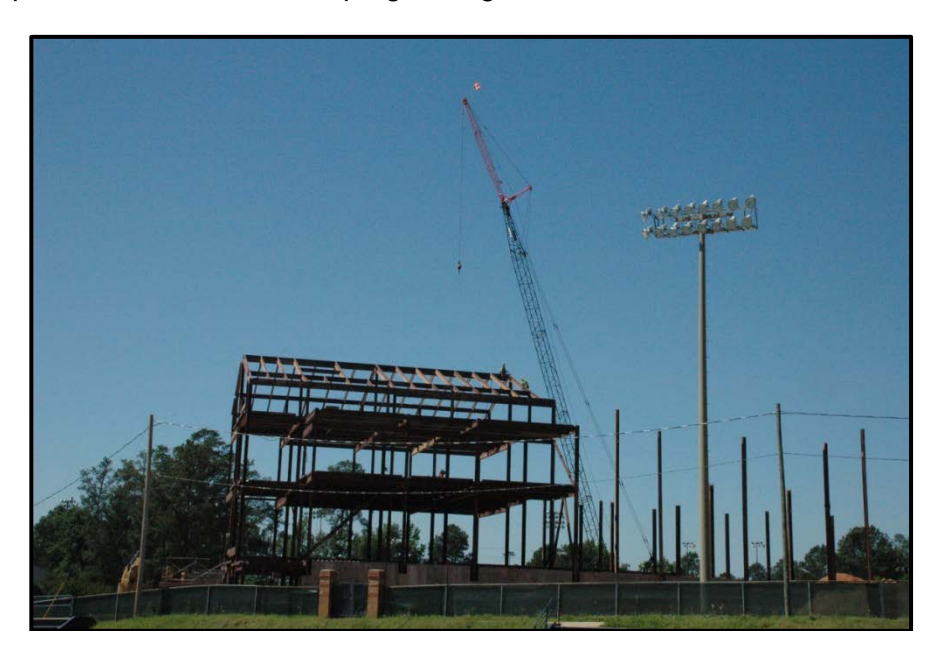
College of Education, Department of Kinesiology Facility - View Looking South

Construction Cost: $16.3 million. The project is on schedule and within budget. The project is 22 percent complete and has a substantial completion date of February 2013. Rough grading of the site is complete and storm sewer and domestic water piping is nearing completion. Major electrical crossings at Wire Road were completed over Spring Break. Concrete footings and foundation walls are 80 percent complete with structural steel progressing on schedule.