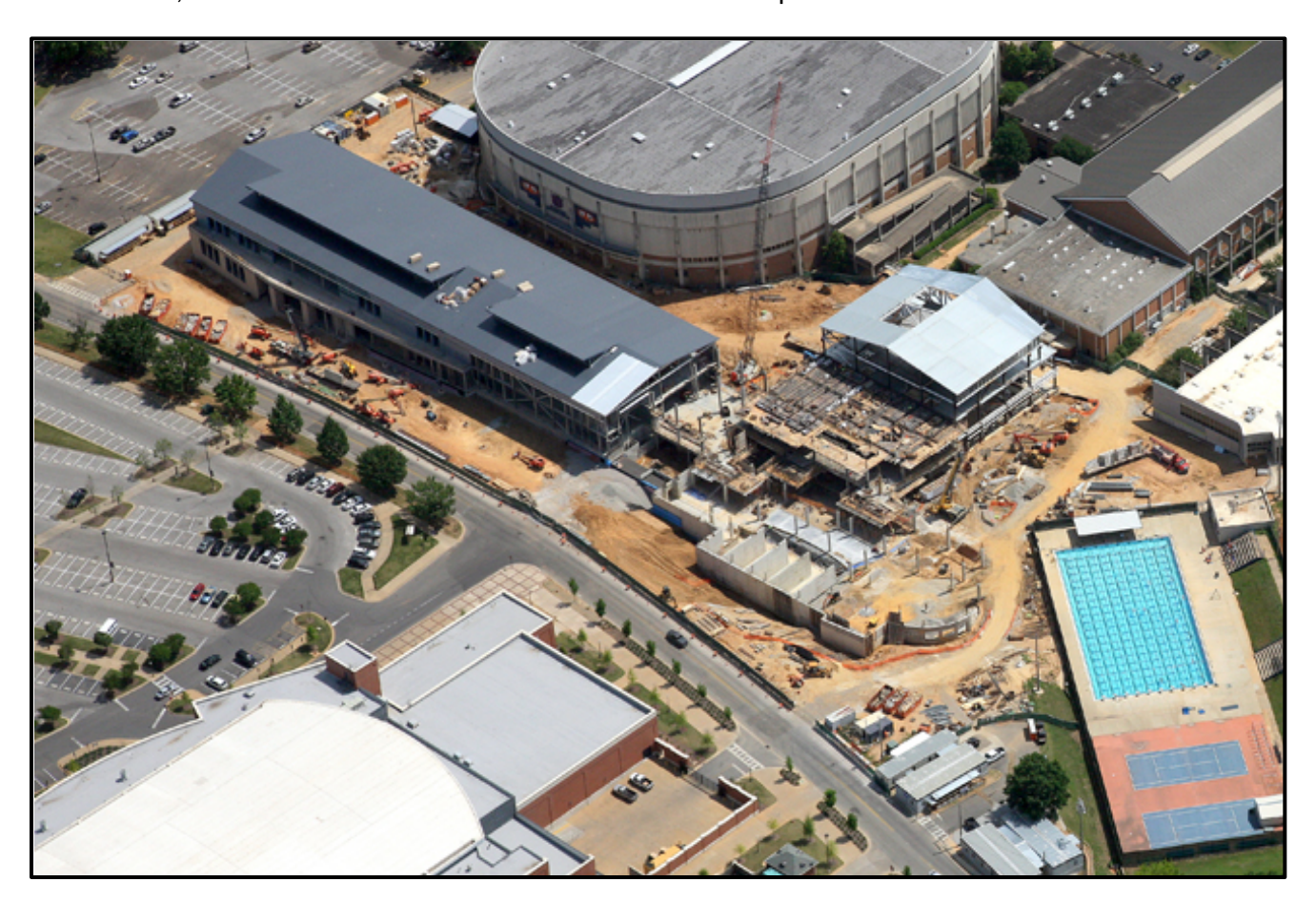
Aerial Photo of AU Wellness and Fitness Center

Construction Cost: $53.0 million. The project is on schedule and within budget. The project is 44 percent complete and has a substantial completion date of May 2013. In the health and wellness area, construction of the foundation walls, on-grade slabs, and elevated slabs are ongoing. Interior framing and rough mechanical, electrical, and plumbing work are underway in the basketball court section of the building. The clerestory window installation and concrete pours for the elevated exercise track have been completed. The exterior building envelope, brick and precast work are progressing well at the south, east and north elevations. Steel erection is complete in the multi-use area.