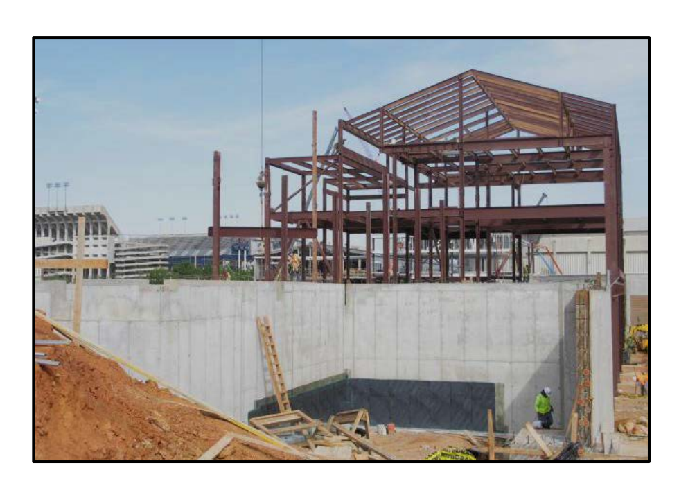
College of Education, Department of Kinesiology Facility - View Looking East