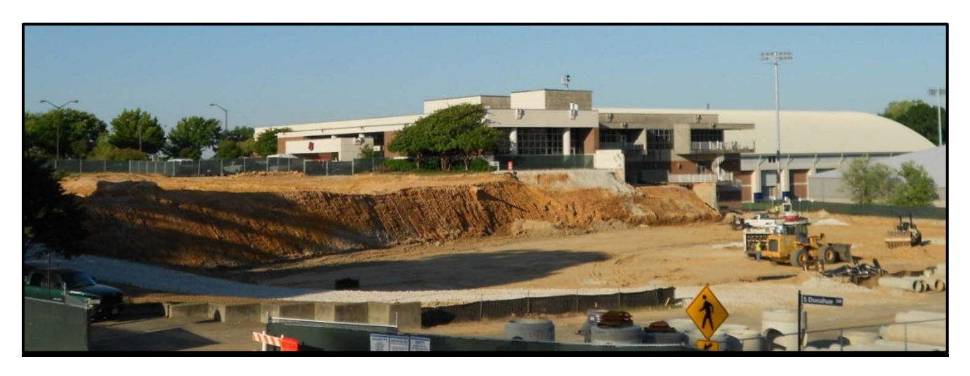
Biggio Drive Parking Facility Project Site View Looking Southwest

Construction Cost: $8.0 million. The project is on schedule, and all contracts have been awarded within budget. The overall project is 8 percent complete and has a completion date of January 2013. Site grading is 85 percent complete and foundation installation is scheduled to begin this month.