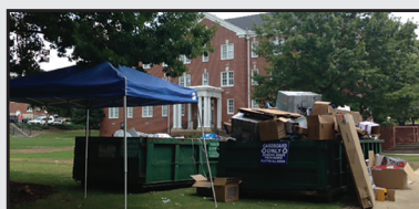
Recycling bins in the Quad Center.

WRRD helps with move-in day by arranging for large roll-away bins to be placed near the residence halls for both cardboard recycling and landfill trash. During move-in days, the WRRD staff begin a “Move-in Mania” phase where they help students and parents separate cardboard from trash and ensure it is placed in one of the 19 available trash and recycling stations throughout campus. Event Operations Group is brought in to help parents and students with properly disposing of trash and recycling cardboard. Employees were also provided meals and a shirt.