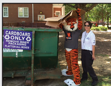
Aubie shows students how to recycle.