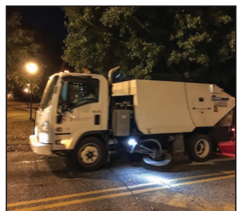
Landscape Services begins sweeping the streets at 5:30 a.m. on Fridays. They also prepare the grounds by mowing, weeding and mulching throughout the week prior to all home games.