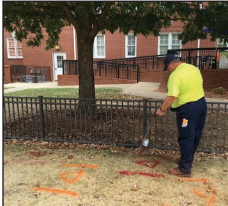
Michial McCormick , Utilities and Energy, marking utilities on campus. Utilities must be marked each week throughout the season.