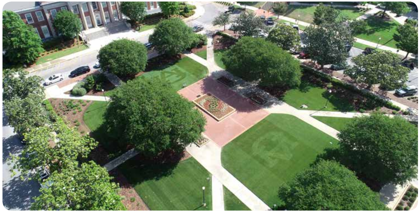
Members of Landscaping Services cut a parting gift for spring graduates into Ross Square. The AU logo was cut into the grass to celebrate the recent graduates.