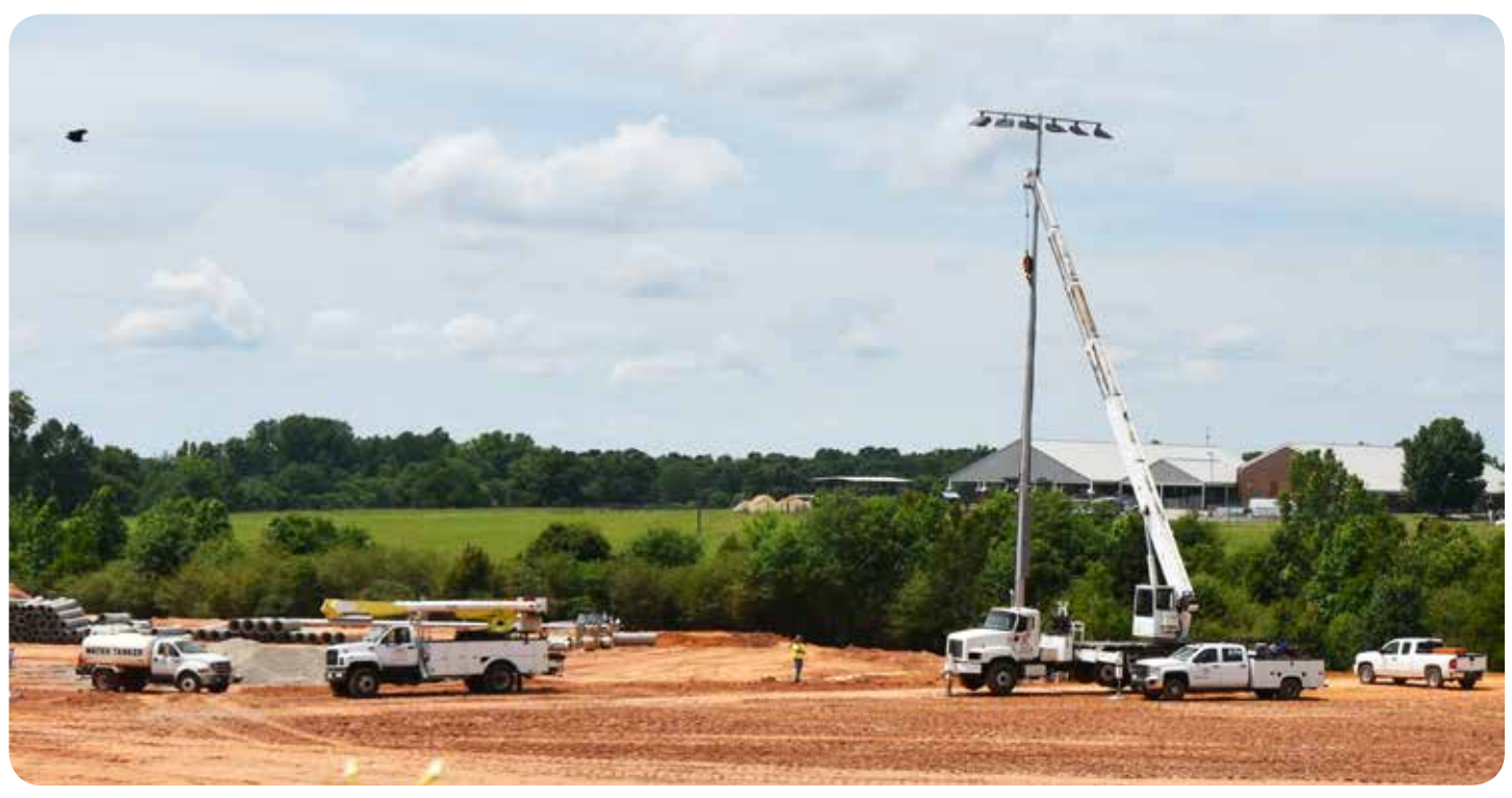
LED field lighting has been placed across the 30 acres containing the Recreation Field Expansion along Lem Morrison Drive. The entire project will add three multi-purpose fields, two softball fields, sand volleyball courts, a 5,300 square foot fieldhouse and a 2,000 square foot maintenance building.