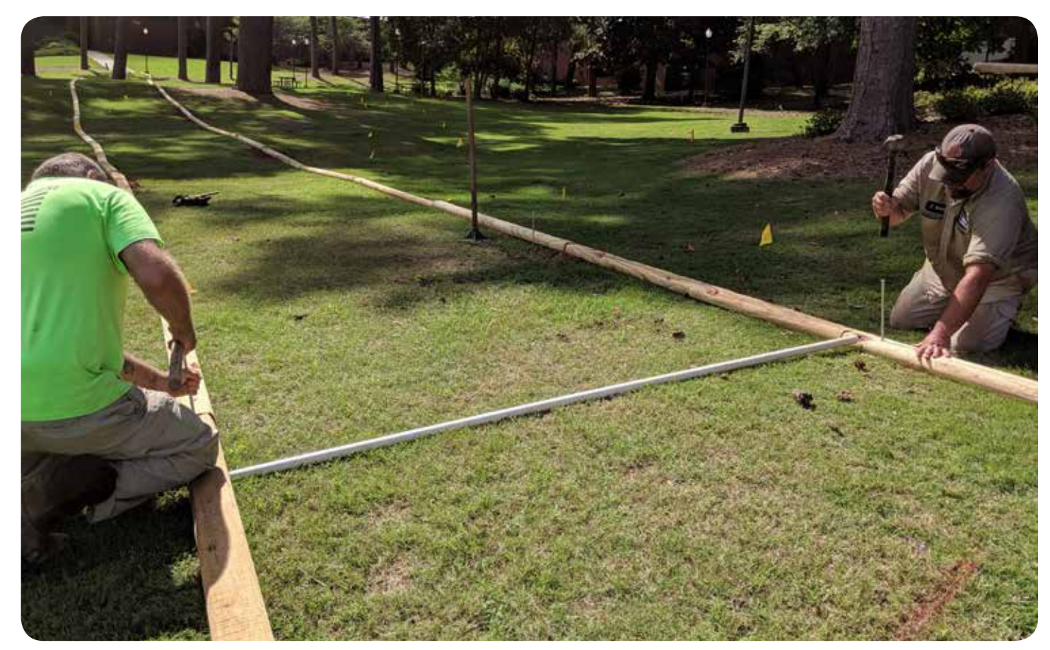
Members of Landscape Services recently finished up a walking path behind the construction fence of the ACLC, following the blocking off of Graves Drive. The path travels from Duncan Drive to the sidewalks outside the College of Architecture. The path was placed to help facilitate foot traffic during construction of the ACLC and Central Dining Hall.