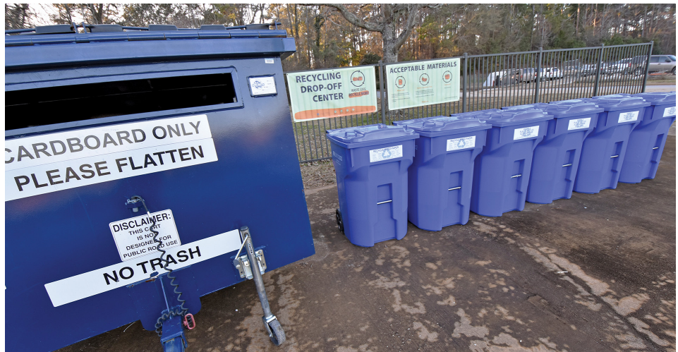
To help support the continued cleanliness of Auburn's campus and the community around it, a new drop-off site has been created to make recycling easier for the Auburn Family.