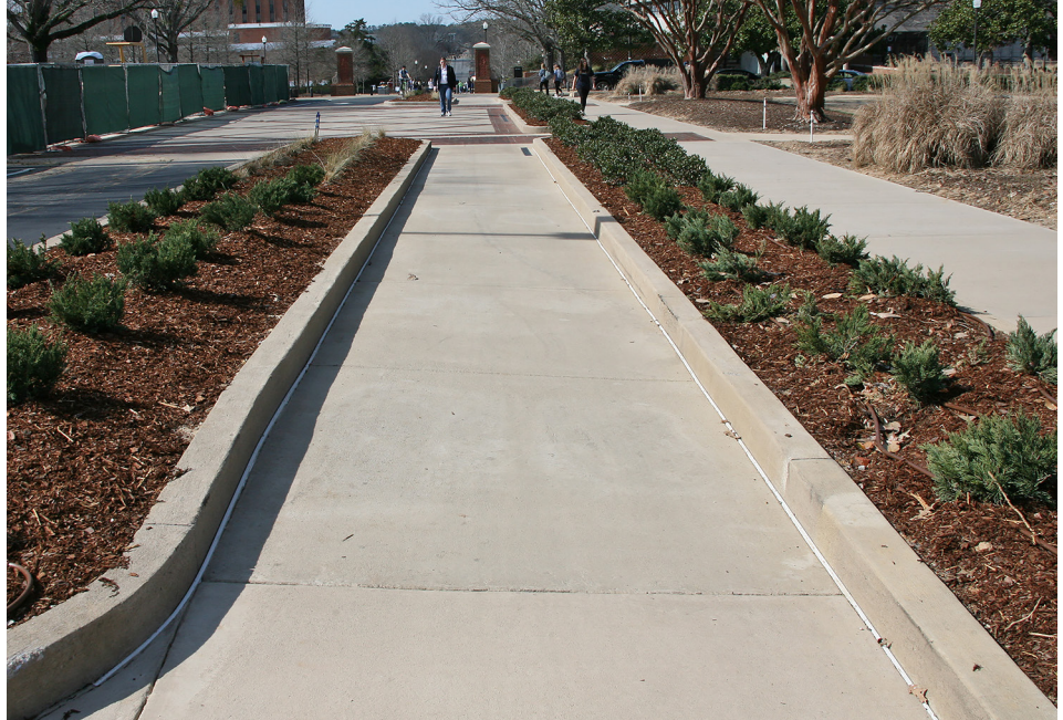
Auburn's Mell Corridor project is currently on track for its June completion date, meaning students and staff will be traveling and utilizing the area outside the Mell Classroom Building in a completely new way by the 2018 fall semester.

Phase two is currently underway with the third and final phase expected to