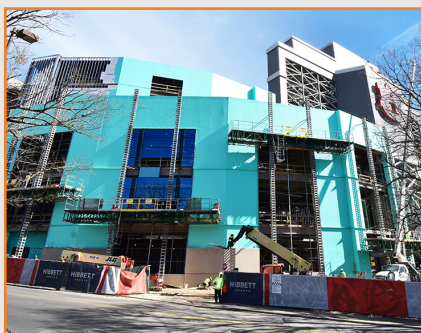
Jordan-Hare's Gameday Support Facility currently is being built along the outside of the stadium.

For more construction updates, head to aub.ie/construction