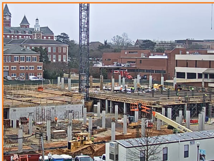
The foundation walls of the Brown-Kopel Engineering Student Achievement Center currently are being placed to support the building's first floor.