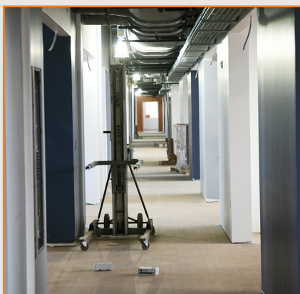
Paint and drywall go up inside the Gavin Engineering Research Laboratory during the renovation of the former Textile Building.