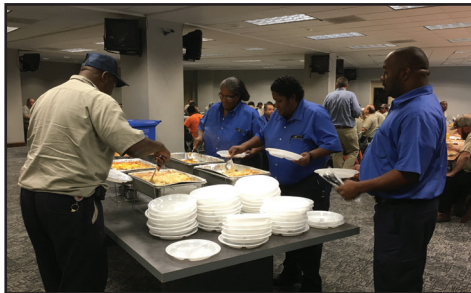
Certificate of Appreciation brunch.