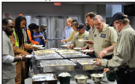
Tiger Ticket luncheon.