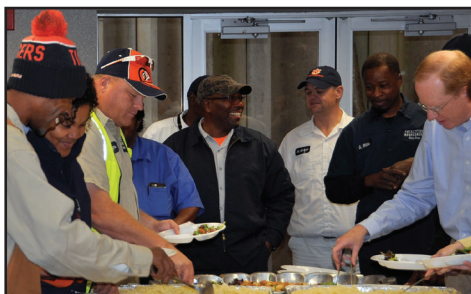
Tiger Ticket luncheon.