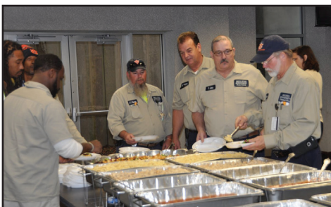
Tiger Ticket luncheon.