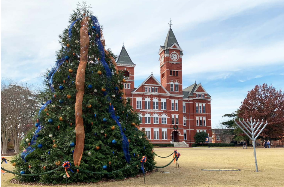
Teams from landscaping, carpentry and Zone 4 electricians bring the holidays to life in Samford Park by decorating the tree, placing the menorah and hanging wreathes on Samford Hall.

To find out, let's take a walk down memory lane.