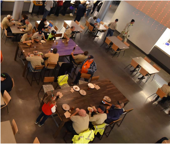
The Facilities team enjoys one of the newest dining options on campus inside The Edge at the Central Dining Hall.