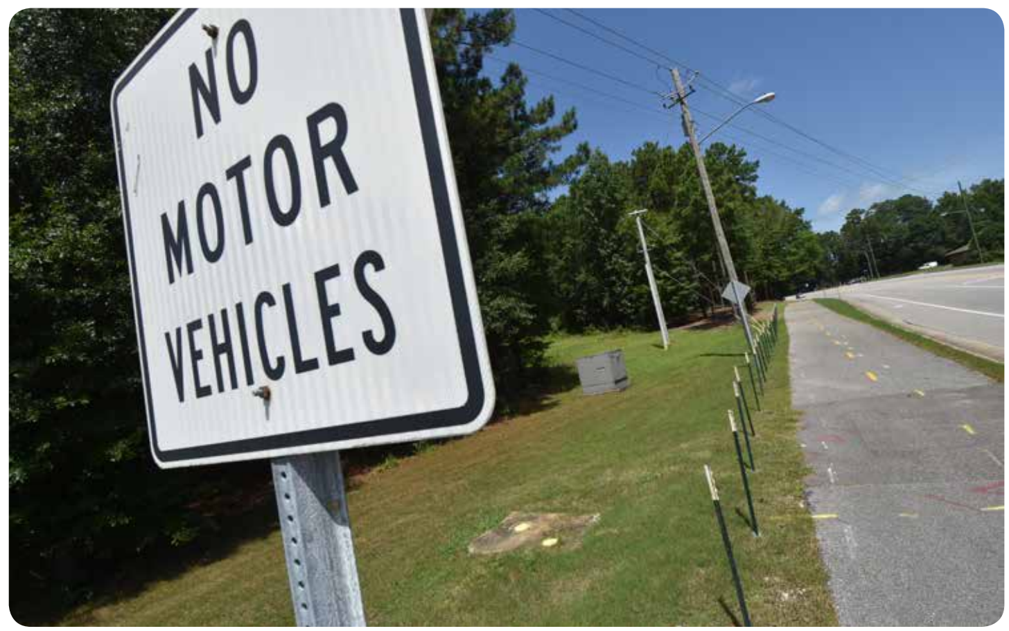
The campus is geared up for football season, with Facilities employees making all the precautions necessary to have a succesful year on the Plains! Auburn's first game is Saturday, Aug. 31, versus the Oregon Ducks in Dallas, TX.