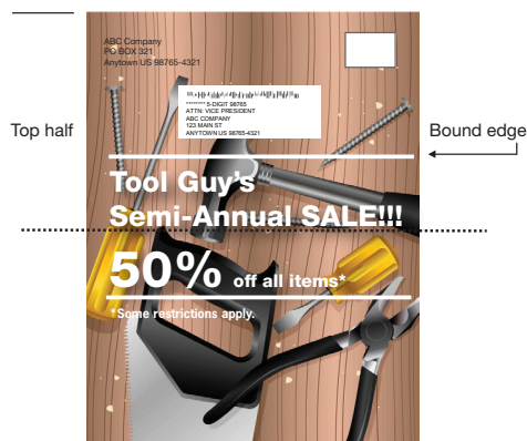
Catalog addressed on back cover. “Top” is the upper edge when the spine is on the right.

You can place the delivery address on the front or the back of the mailpiece, but it must be on the same side as the postage. The address may be parallel or perpendicular to the top edge, but not upside-down as read in relation to the top edge. A perpendicular address can face to the left or the right.